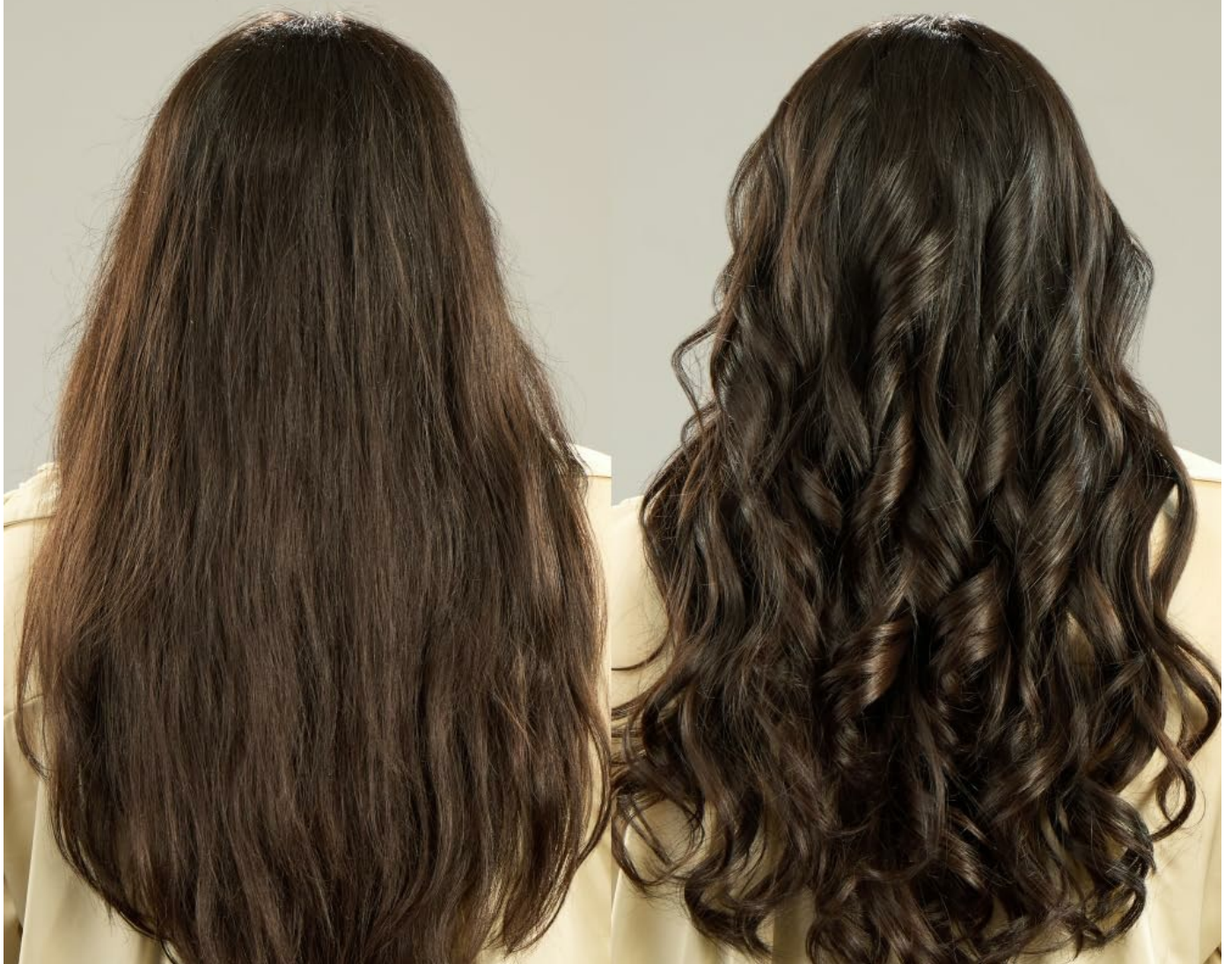
Figure 4: Example of hair before and after using the curling wand.