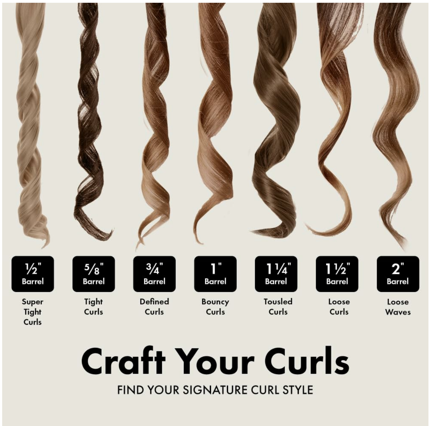
Figure 5: The 1-inch barrel is ideal for bouncy curls, as shown in this curl type guide.