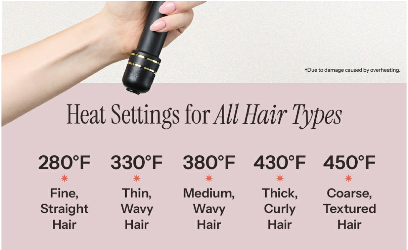
Figure 3: Recommended heat settings for various hair types.