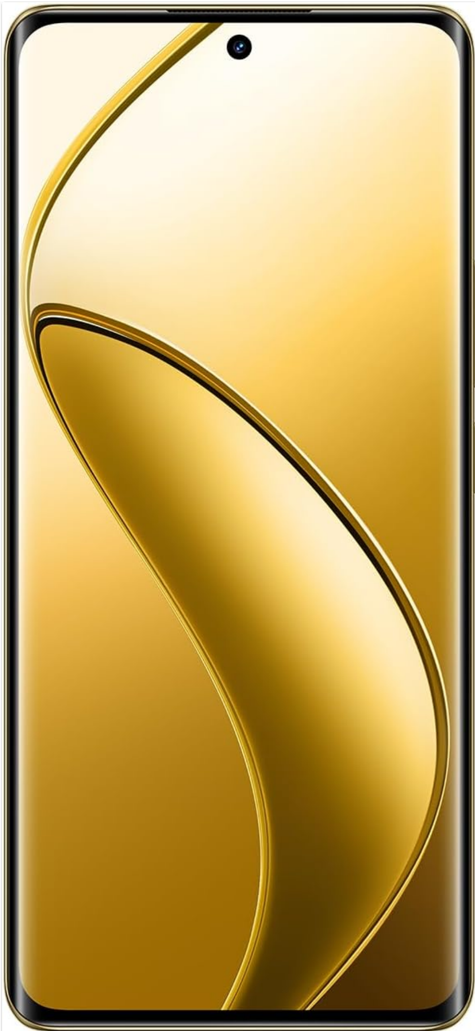
Figure 2.2: Close-up of the realme 12 Pro+ 5G smartphone's front display, showing the curved edges and the punch-hole front