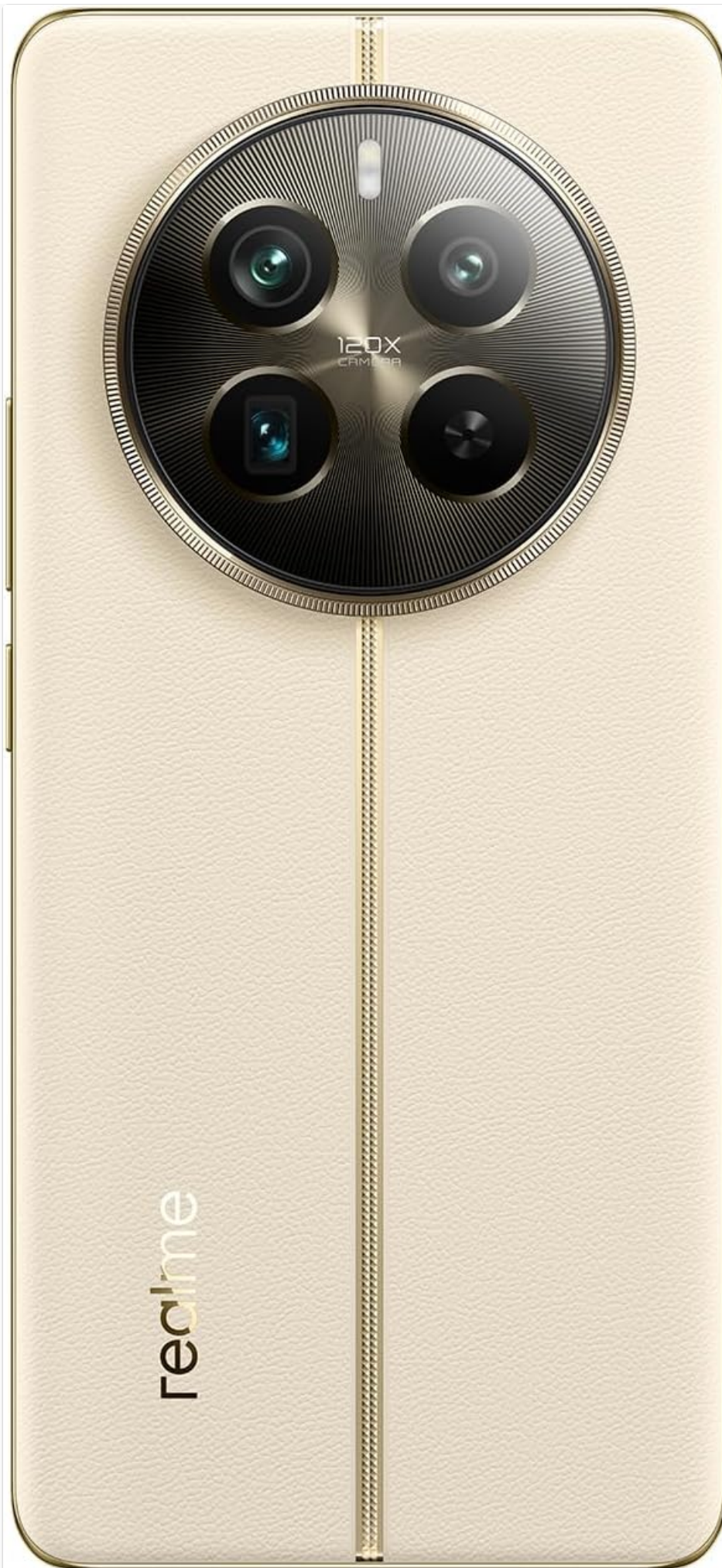
Figure 2.3: Rear view of the realme 12 Pro+ 5G smartphone, focusing on the prominent circular camera module housing multiple