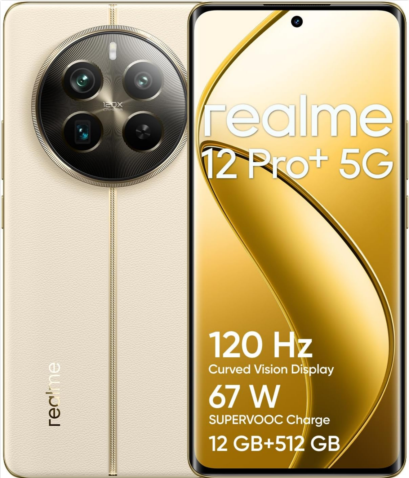
Figure 2.1: Front and back view of the realme 12 Pro+ 5G smartphone, highlighting the display, front camera, and the circular rear camera module with a textured back panel.

Familiarize yourself with the physical components of your realme 12 Pro+ 5G smartphone.