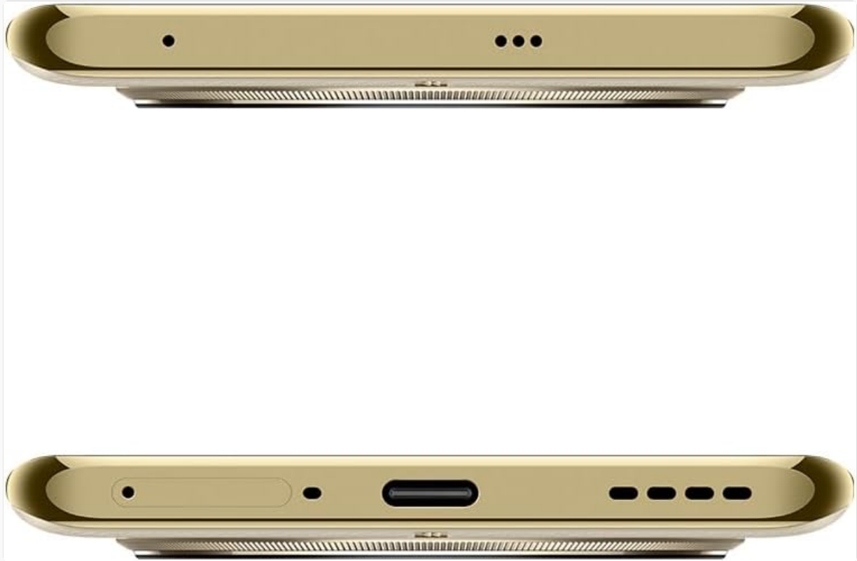
Figure 2.5: Top and bottom edges of the realme 12 Pro+ 5G smartphone, illustrating the USB-C charging port, speaker grille, microphone, and SIM card tray slot at the bottom, and an additional microphone at the top.