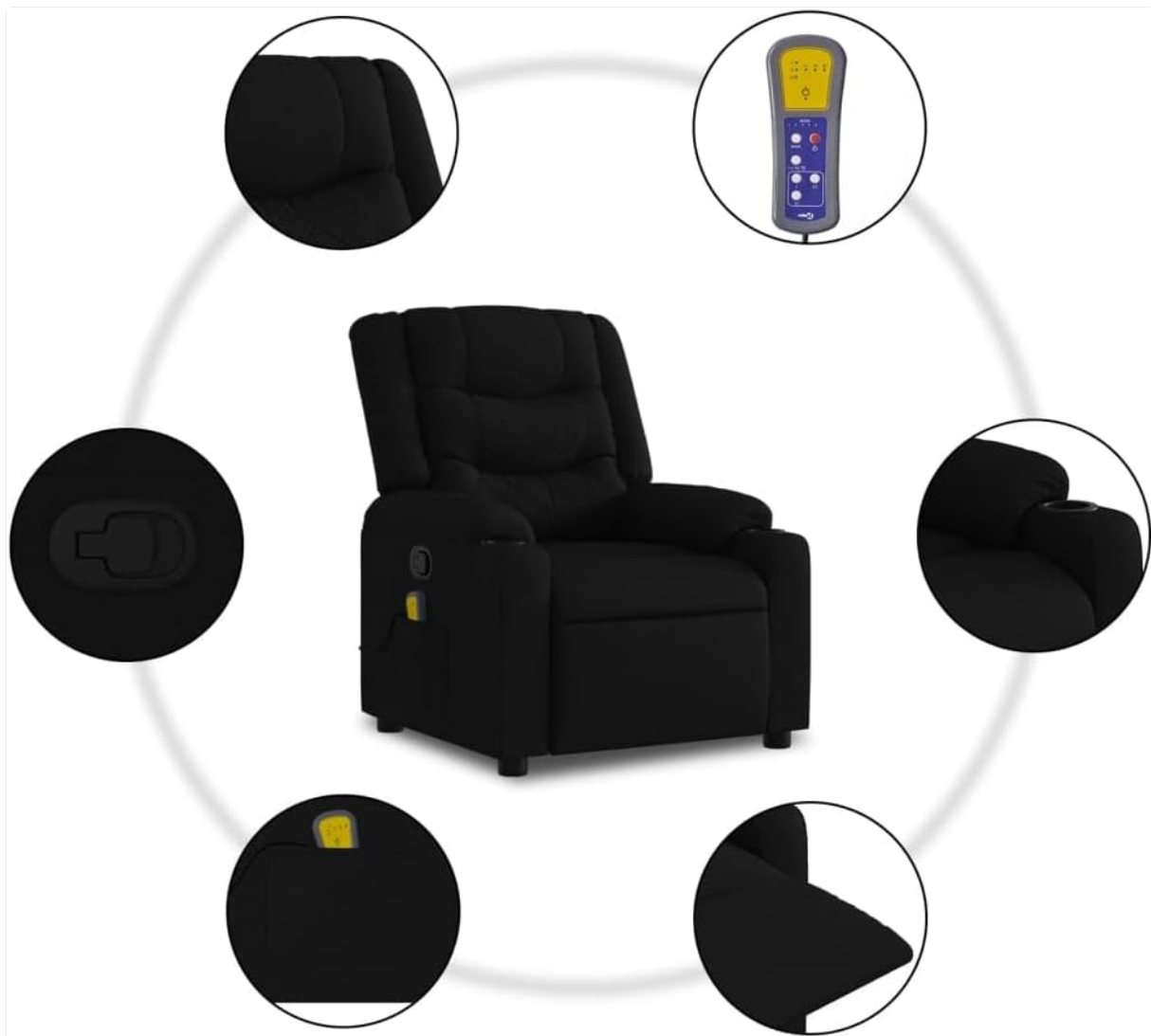
Image 3.3: Detailed view of the remote control, cup holder, and reclining lever.