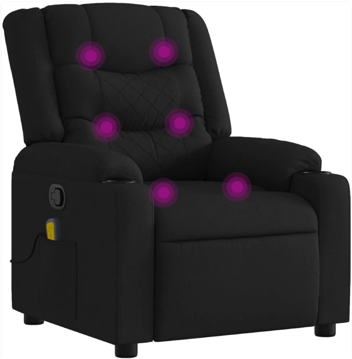
Image 3.2: The armchair with an overlay indicating the 6 massage points.