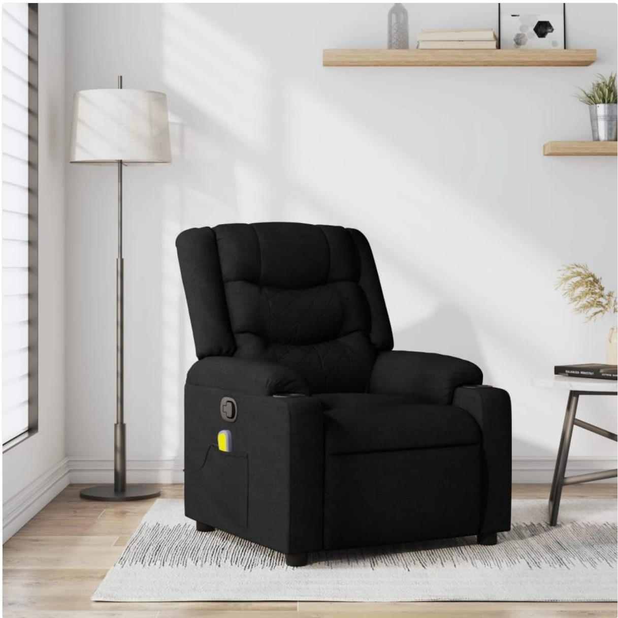
Image 1.1: The vidaXL Reclining Massage Armchair in a typical home environment.