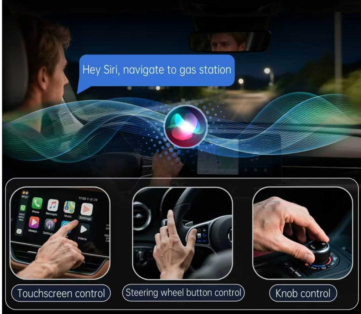
Figure 5.2: Various control methods for CarPlay, including voice, touchscreen, steering wheel, and knob controls.