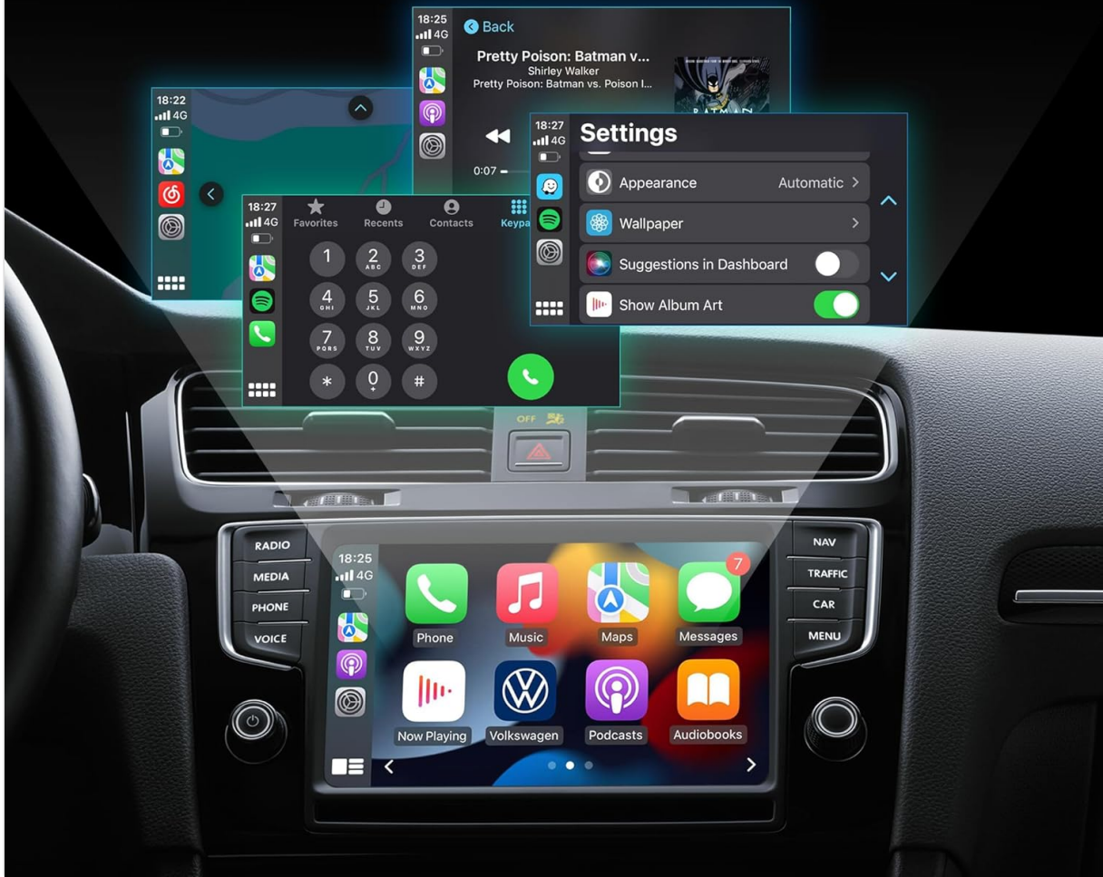
Figure 5.1: Overview of CarPlay functions available through the adapter.

Your browser does not support the video tag.