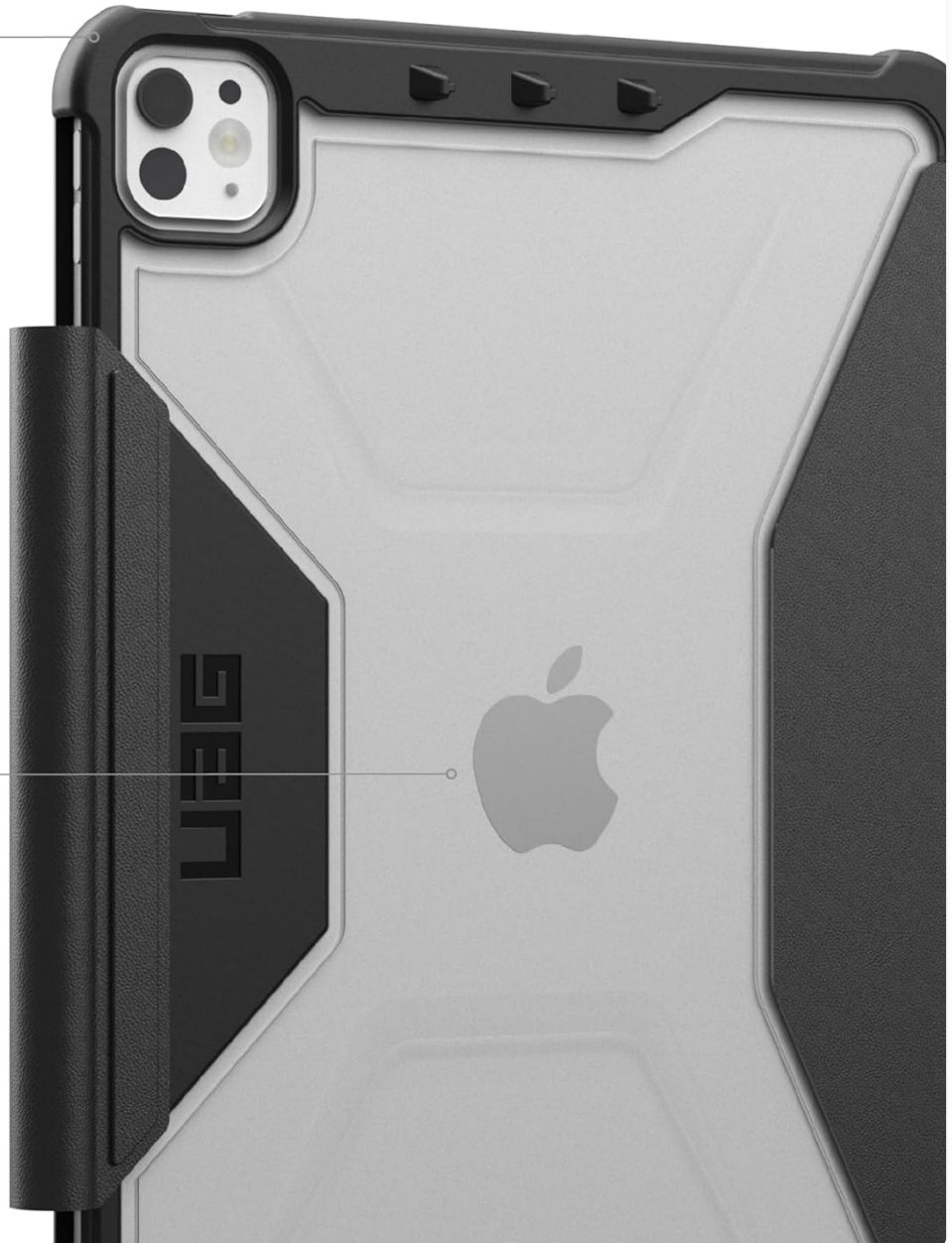
Image 3.2: Detailed view of the case's corner, illustrating the air-soft technology and lightweight build.