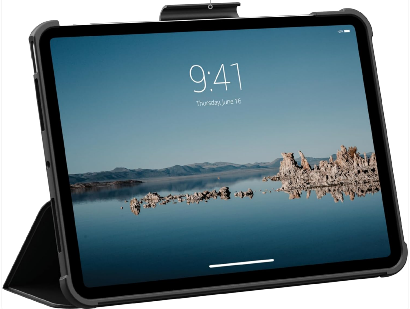
Image 3.3: The case with an iPad, highlighting the dedicated Apple Pencil holder for secure storage and charging.