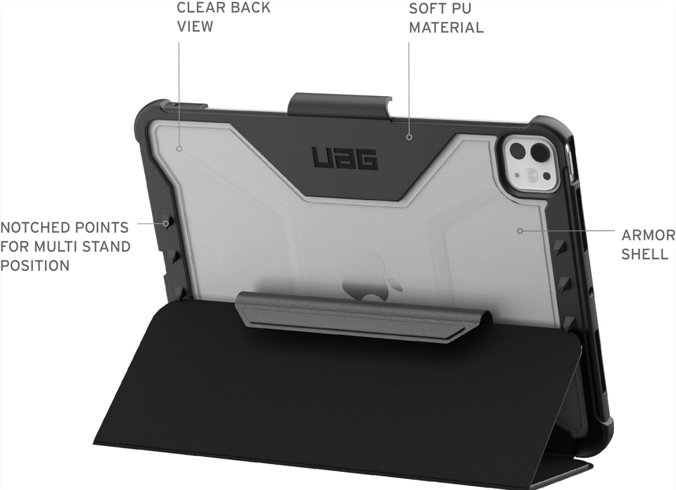
Image 3.1: Annotated view of the case's rear, detailing its protective components and design features.