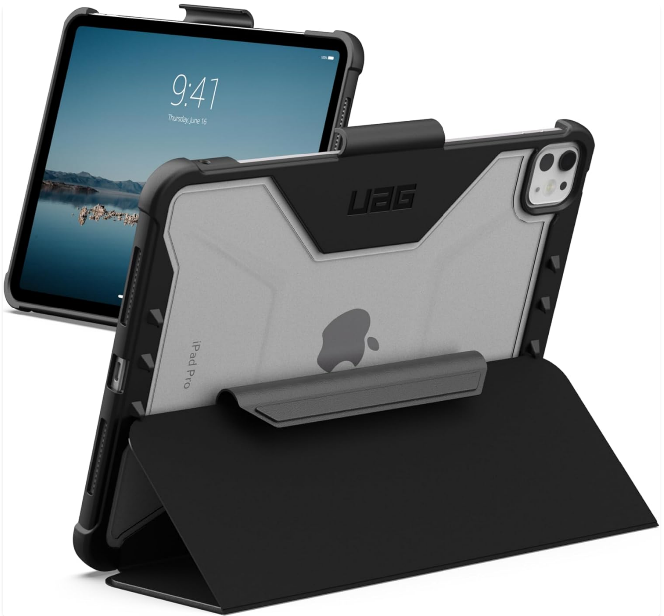
Image 1.1: The UAG Plyo Series Case protecting an iPad Pro 11 inch, displayed in a multi-position stand configuration.