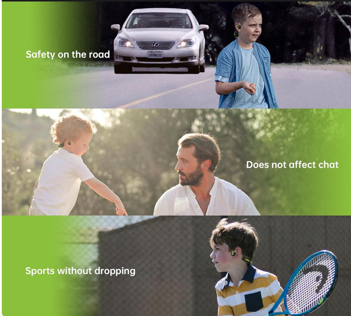
Figure 2.3: Awareness of Surroundings for Enhanced Safety