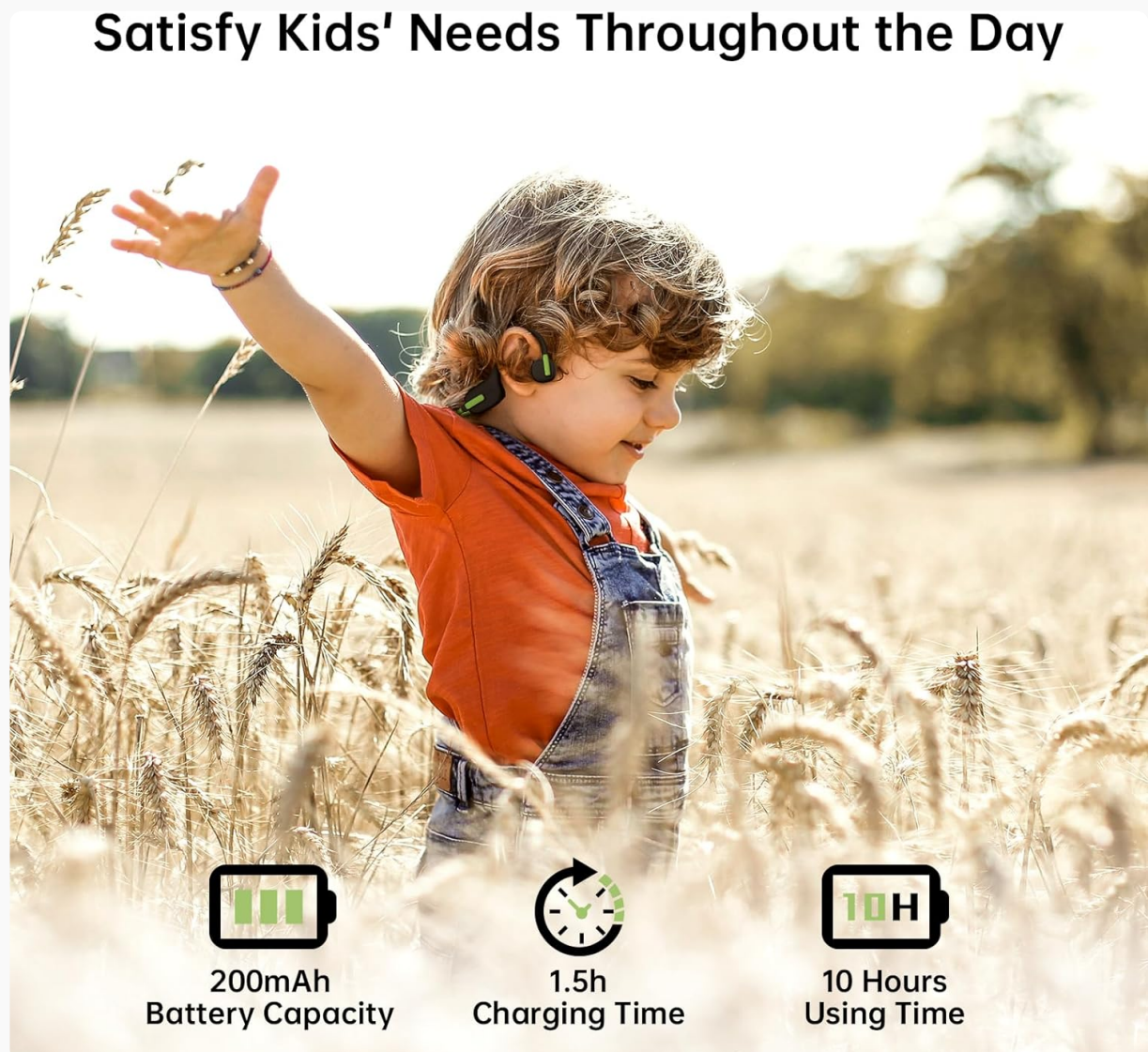
Figure 4.1: Bluetooth 5.3 Connectivity and Battery Information

The headphones will automatically attempt to reconnect to the last paired device when powered on.