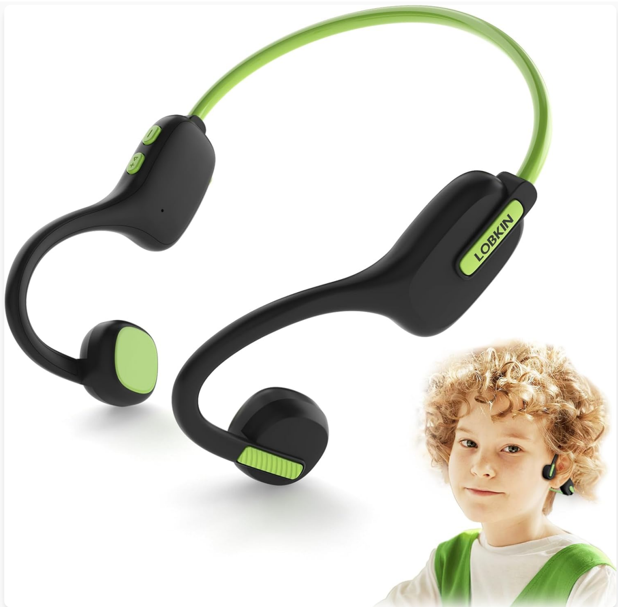
Figure 1.1: LOBKIN Kids Open Ear Headphones (Green)