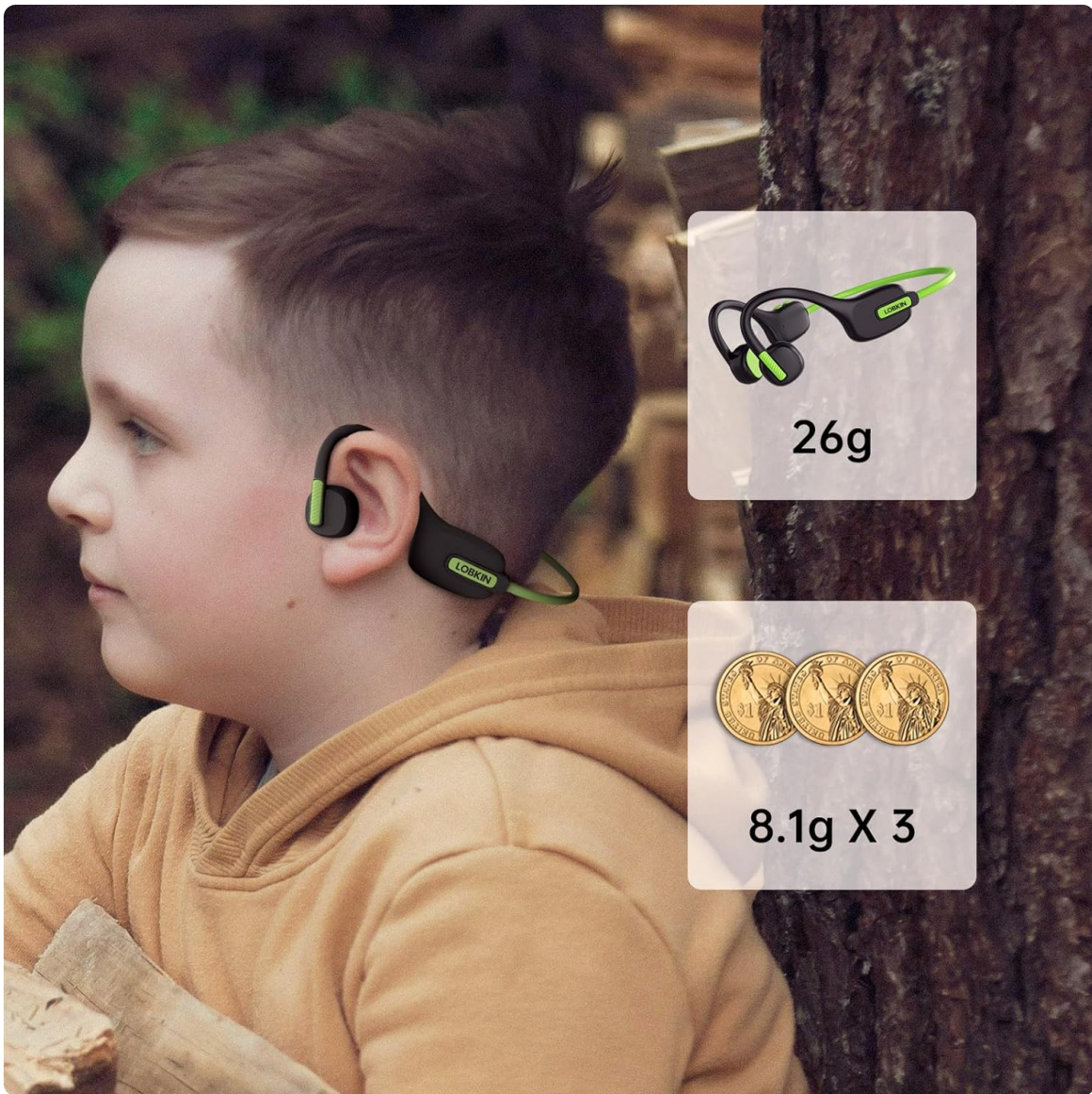
Figure 2.4: Lightweight Design for Maximum Comfort