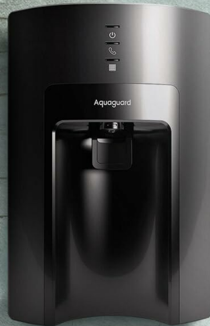
Figure 1: Front view of the Aquaguard Sure Delight NXT RO+MC Water Purifier.

Your browser does not support the video tag.