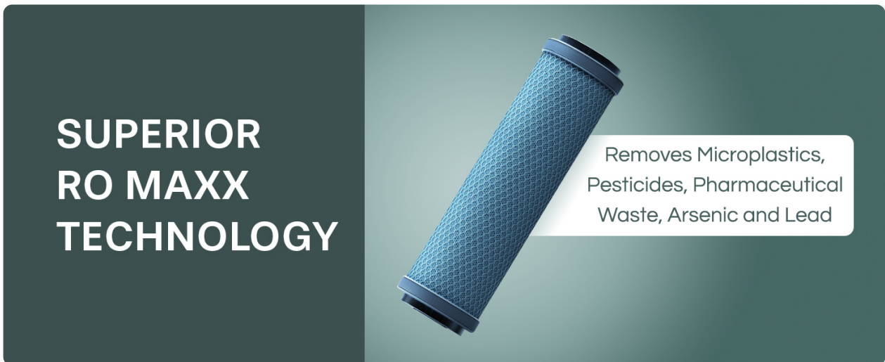
Figure 3: RO Maxx technology removes various contaminants.