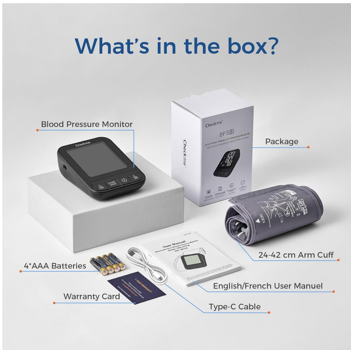
Image 3.1: The package contents include the blood pressure monitor, upper arm cuff, AAA batteries, Type-C cable, user manual, and warranty card.