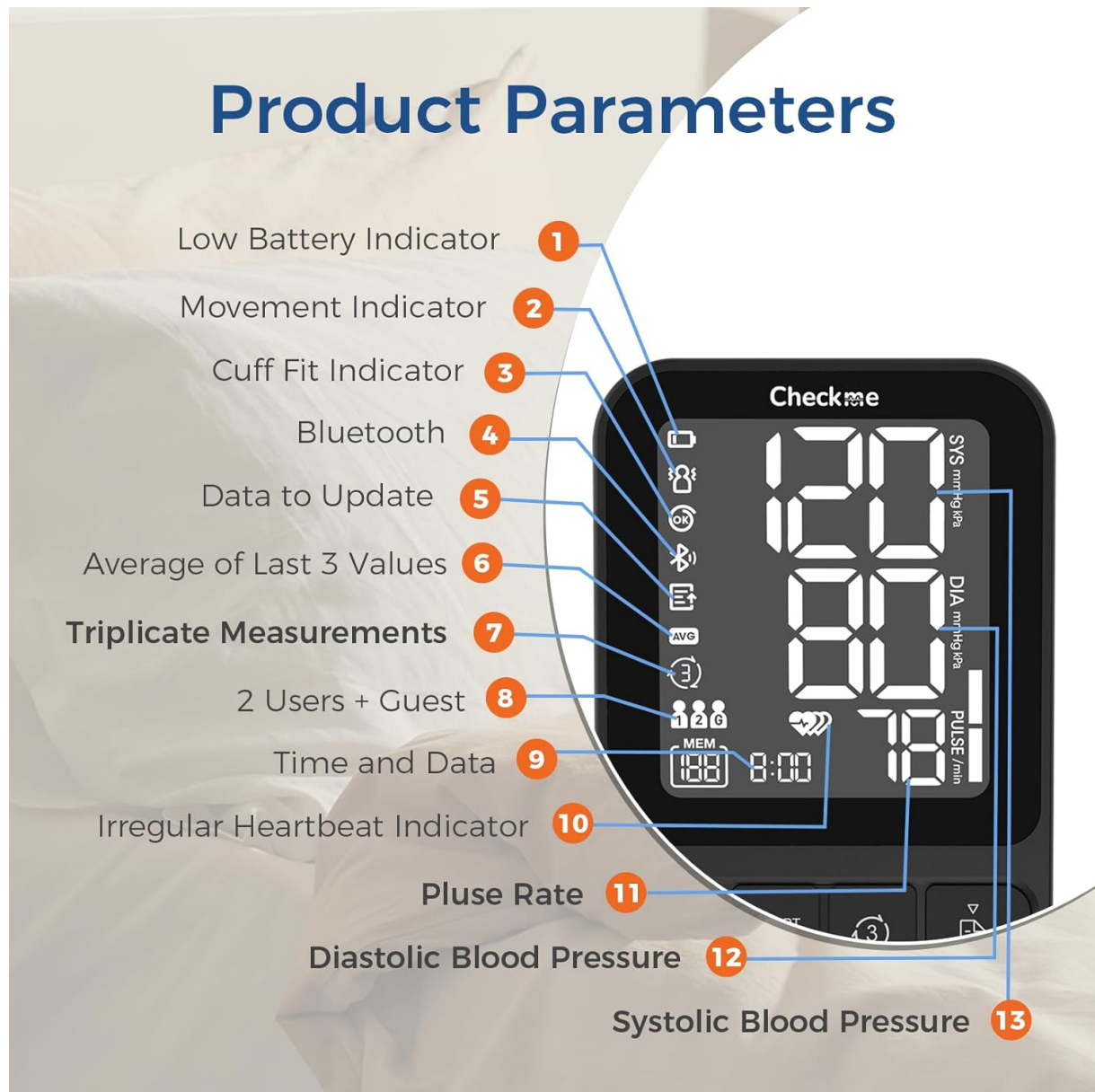
Image 4.1: Product diagram showing the monitor's display and buttons. Key indicators include: 1. Low Battery, 2. Movement, 3. Cuff Fit, 4. Bluetooth, 5. Data to Update, 6. Average of Last 3 Values, 7. Triplicate Measurements, 8. 2 Users + Guest, 9. Time and Date, 10. Irregular Heartbeat, 11. Pulse Rate, 12. Diastolic Blood Pressure, 13. Systolic Blood Pressure.

Familiarize yourself with the components and display indicators of your blood pressure monitor.