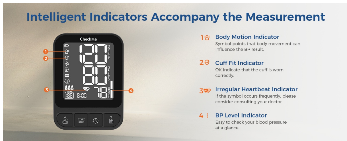
Image 4.2: Detailed view of intelligent indicators: 1. Body Motion Indicator (points to body movement that can influence BP result), 2. Cuff Fit Indicator (OK indicates correct cuff wear), 3. Irregular Heartbeat Indicator (suggests consulting a doctor if frequent), 4. BP Level Indicator (easy blood pressure check at a glance).