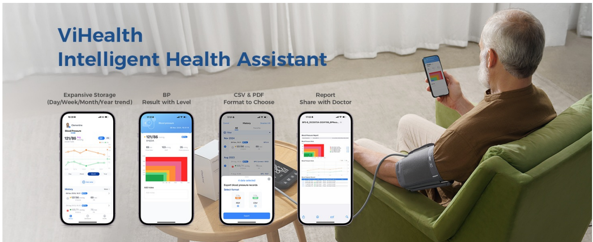
Image 6.8: The ViHealth app functions as an intelligent health assistant, providing expansive storage, BP results with levels, CSV & PDF report options, and report sharing capabilities.