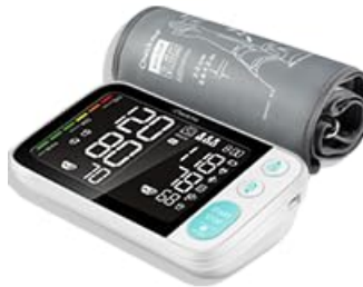
Image 6.4: Visual guide for recalling records: Press 'MEM' when off, press 'USER' or 'MEM' to select user, then 'START/STOP' to confirm.