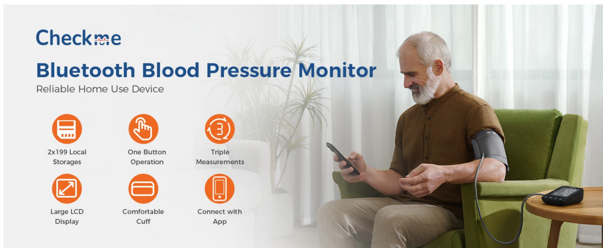
Image 1.1: Overview of the Checkme BP3-B Bluetooth Blood Pressure Monitor, highlighting features such as 2x199 local storage, one-button operation, triple measurements, large LCD display, comfortable cuff, and app connectivity.

This manual provides instructions for the proper use and care of your Checkme BP3-B Bluetooth Blood Pressure Monitor. This device is designed for home use to measure systolic and diastolic blood pressure, as well as pulse rate, using an upper arm cuff. It features an X3 average function for enhanced accuracy, a large backlit display, and Bluetooth connectivity to the ViHealth app for data management.