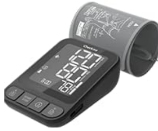
Image 5.3: Visual guide for setting the year, date format, month/day, time format, and hour/minute using the monitor's buttons.