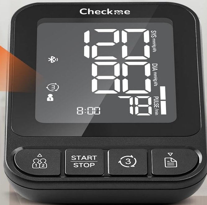
Image 6.6: The monitor's 'Triple Measurement by One Click' feature allows setting interval times of 30s, 60s, or 90s.