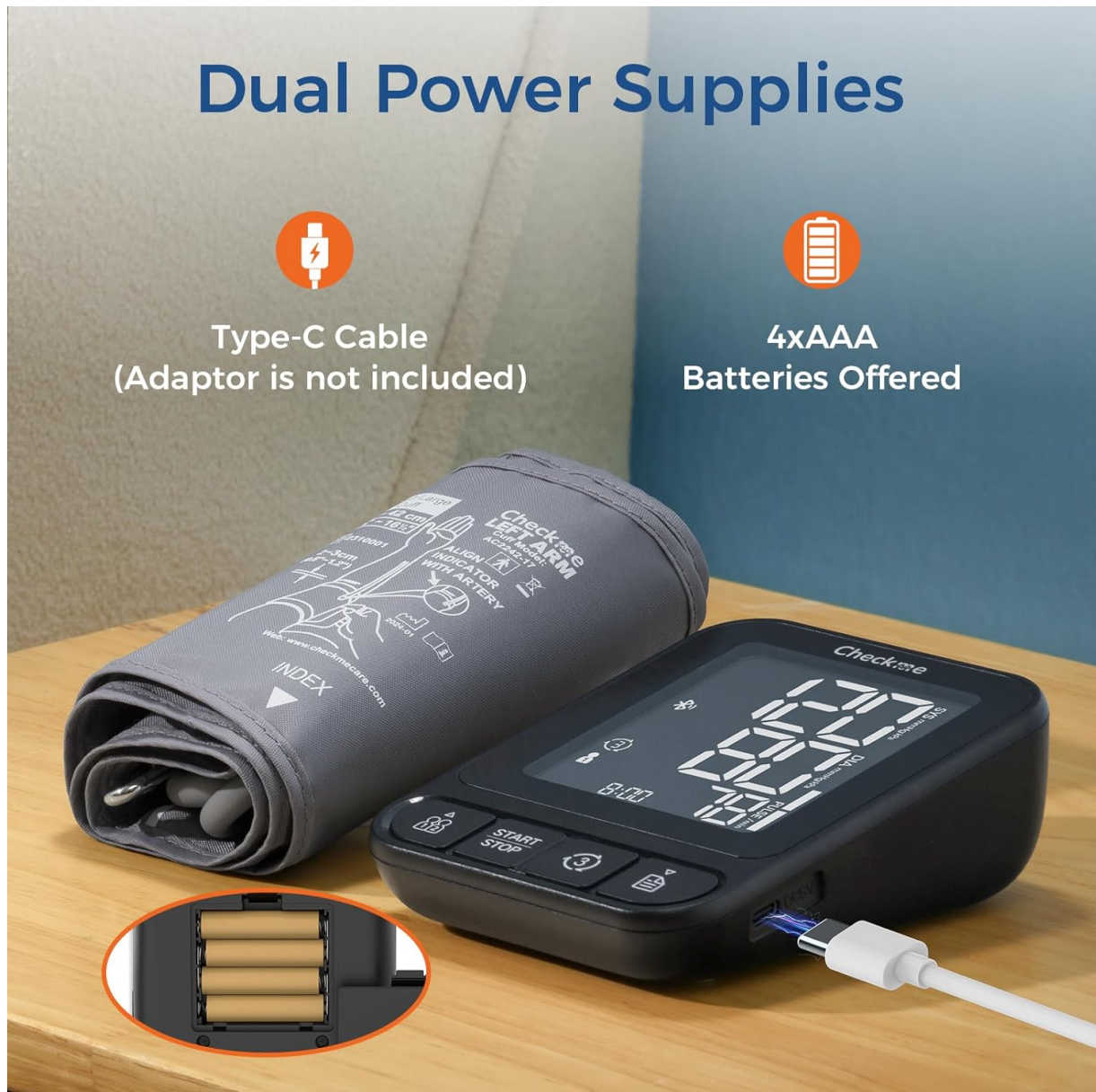
Image 5.1: The monitor supports dual power supplies: 4x AAA batteries (included) or a Type-C cable (included; adapter not included).