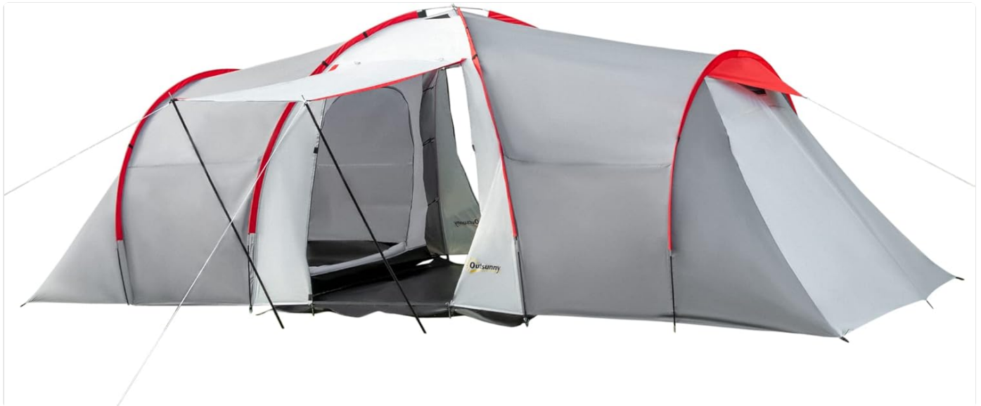
Image: The Outsunny 4-6 Man Tunnel Tent, showcasing its full tunnel design with multiple sections and a grey and red color scheme.

The Outsunny 4-6 Man Tunnel Tent is designed for comfortable outdoor living, featuring a spacious layout with two separate bedrooms, a central living area, and a vestibule. It offers protection against the elements with a 2000mm waterproof rating and UV50+ protection. This portable tent is suitable for various outdoor activities such as camping, hiking, and festivals.