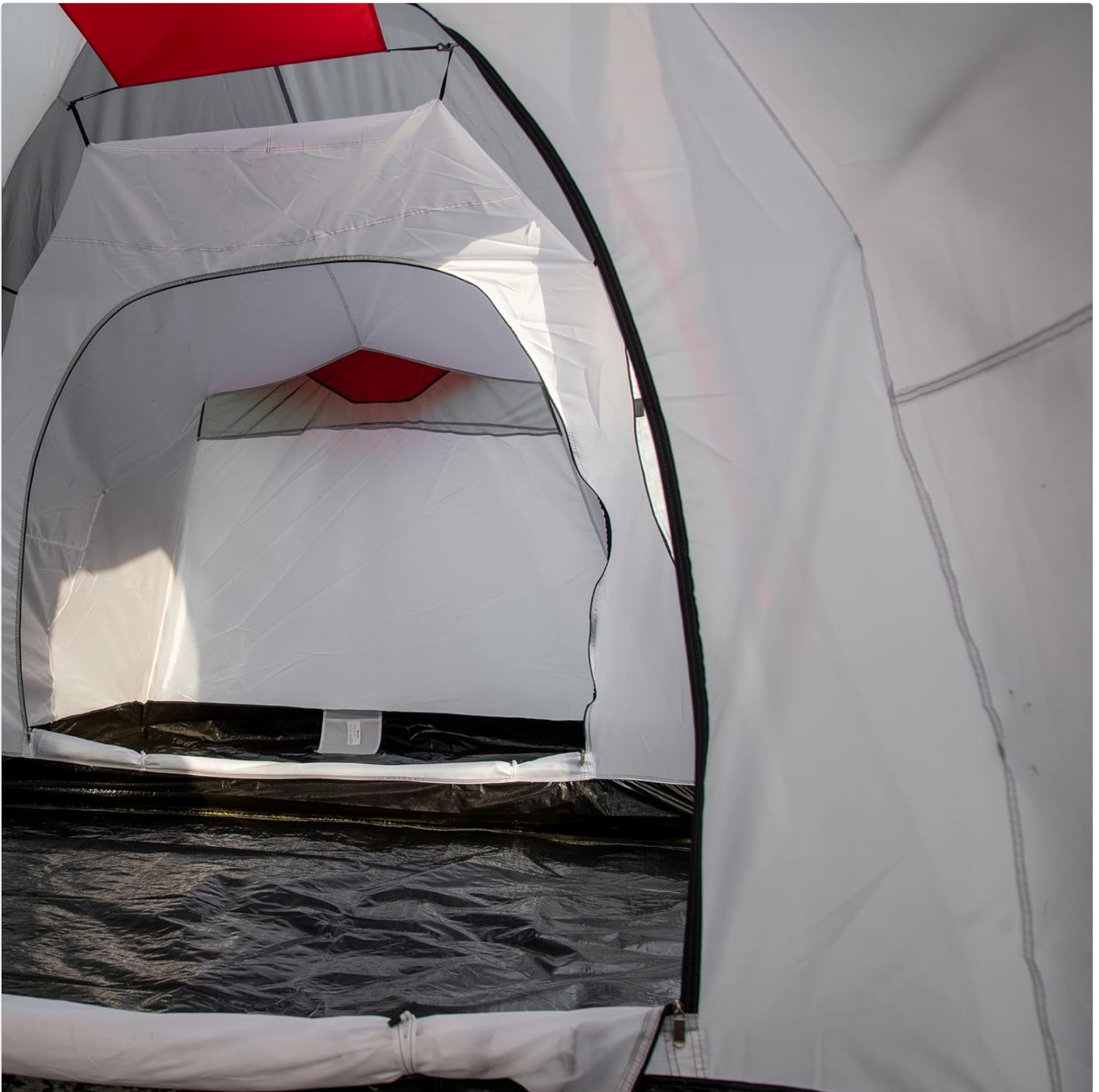
Image: An interior view of the tent, highlighting the separate inner bedroom tents and the black welded floor material designed to keep the interior dry.