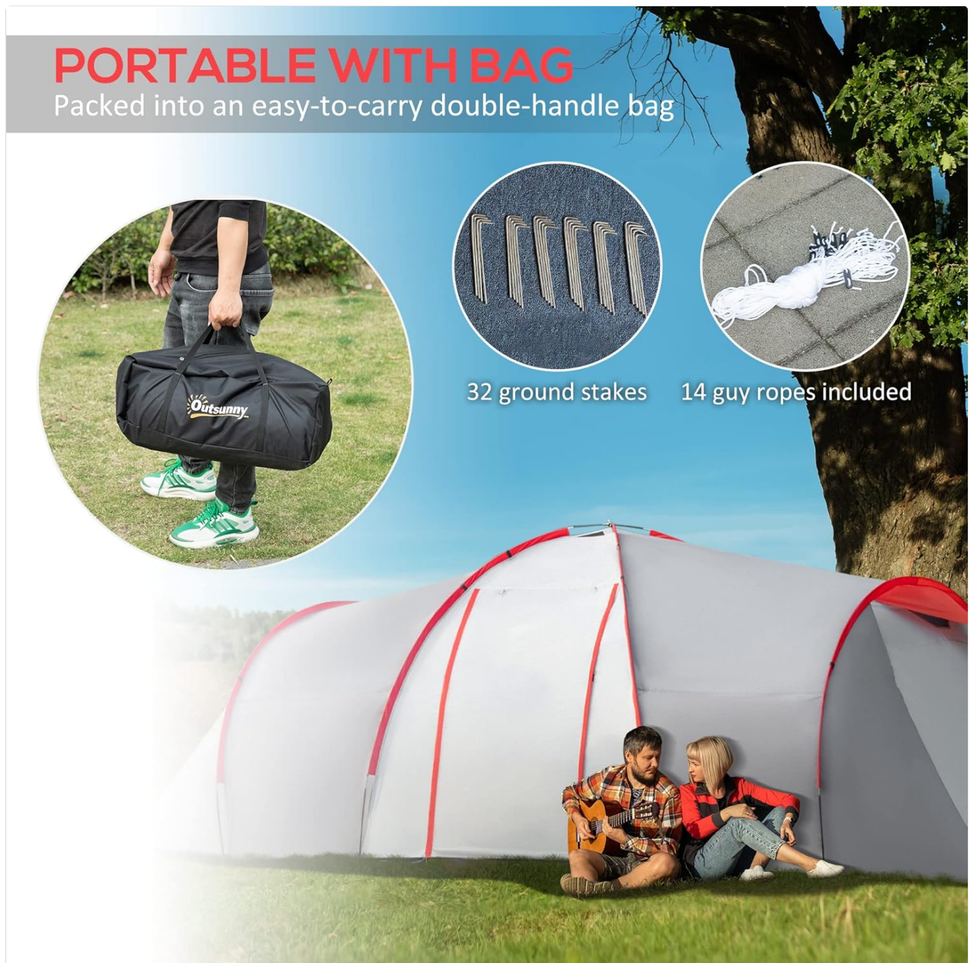
Image: A visual representation of the tent's portability, showing the carry bag, 32 ground stakes, and 14 guy ropes included with the tent.