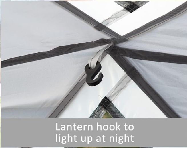
Image: Detailed views of the tent's interior, showing the welded floors for dryness, mesh windows for ventilation, and a lantern hook for internal lighting.