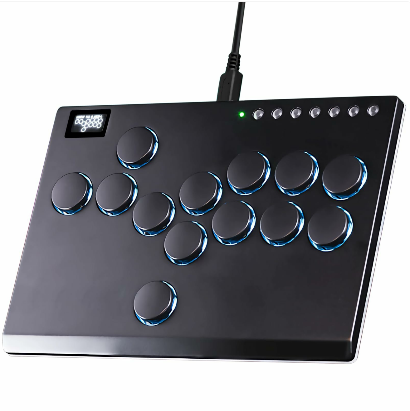
A top-down view of the black Haute42 M13 arcade stick, showcasing its 13 circular buttons and compact design.