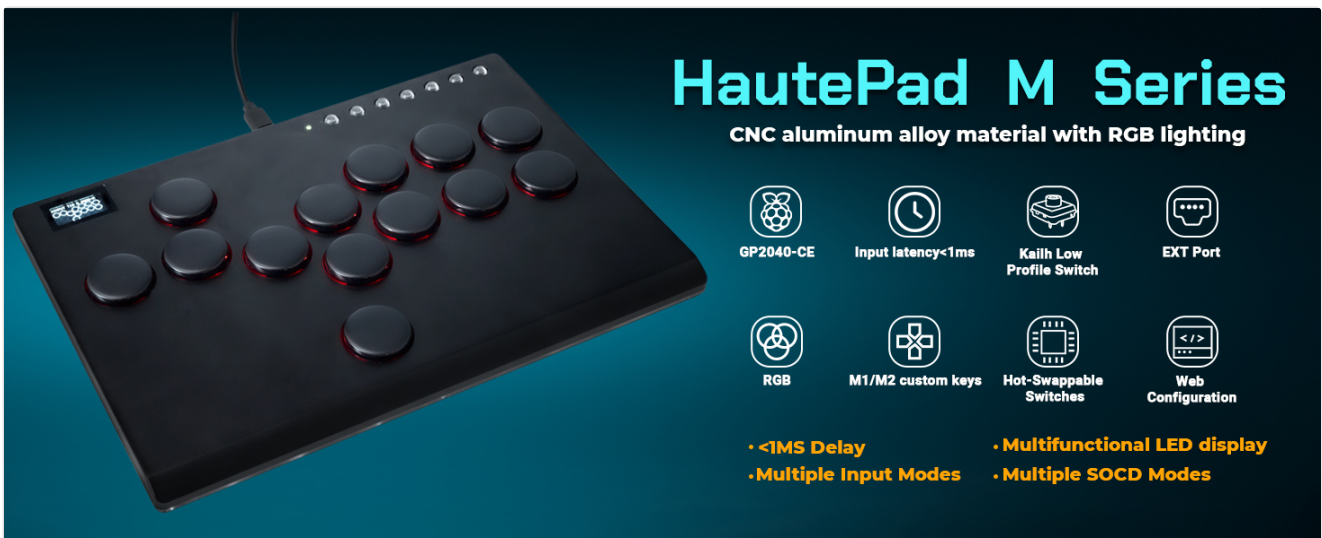
This image highlights key features of the HautePad M Series, such as the GP2040-CE processor, less than 1ms input latency, Kailh Low Profile Switches, an EXT Port, RGB lighting, M1/M2 custom keys, hot-swappable switches, and web configuration support.