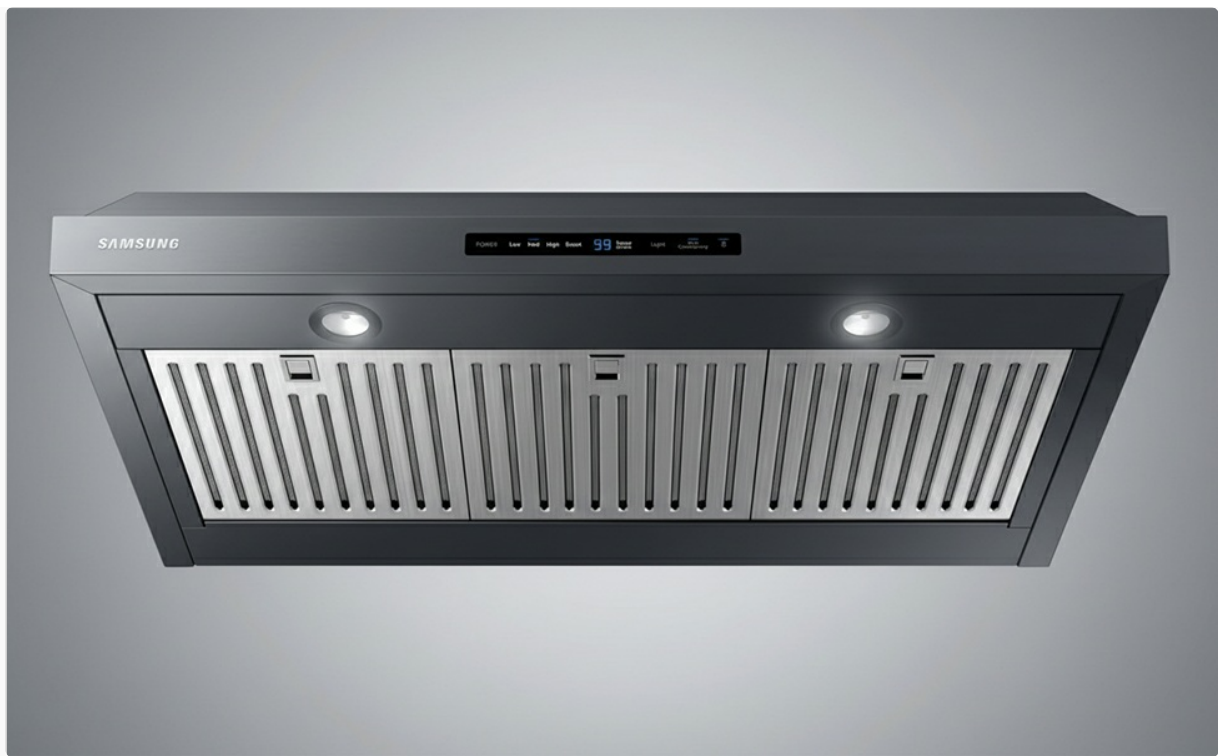
Image: Bluetooth connectivity with a Samsung cooktop.