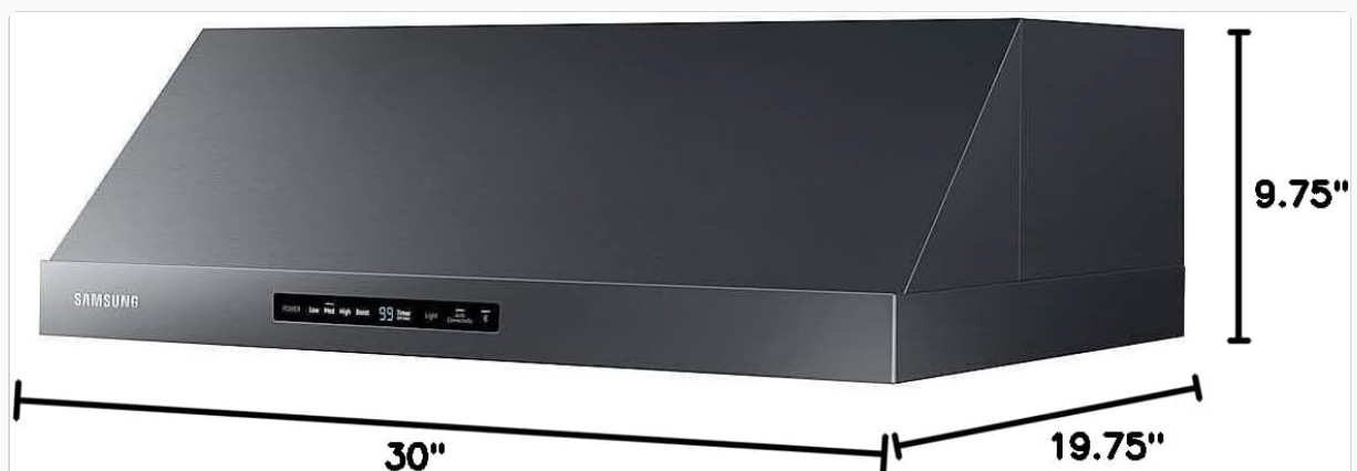
Image: Product dimensions for installation planning.

Refer to the detailed installation guide provided with your product packaging for specific mounting instructions, ducting requirements, and electrical connections.