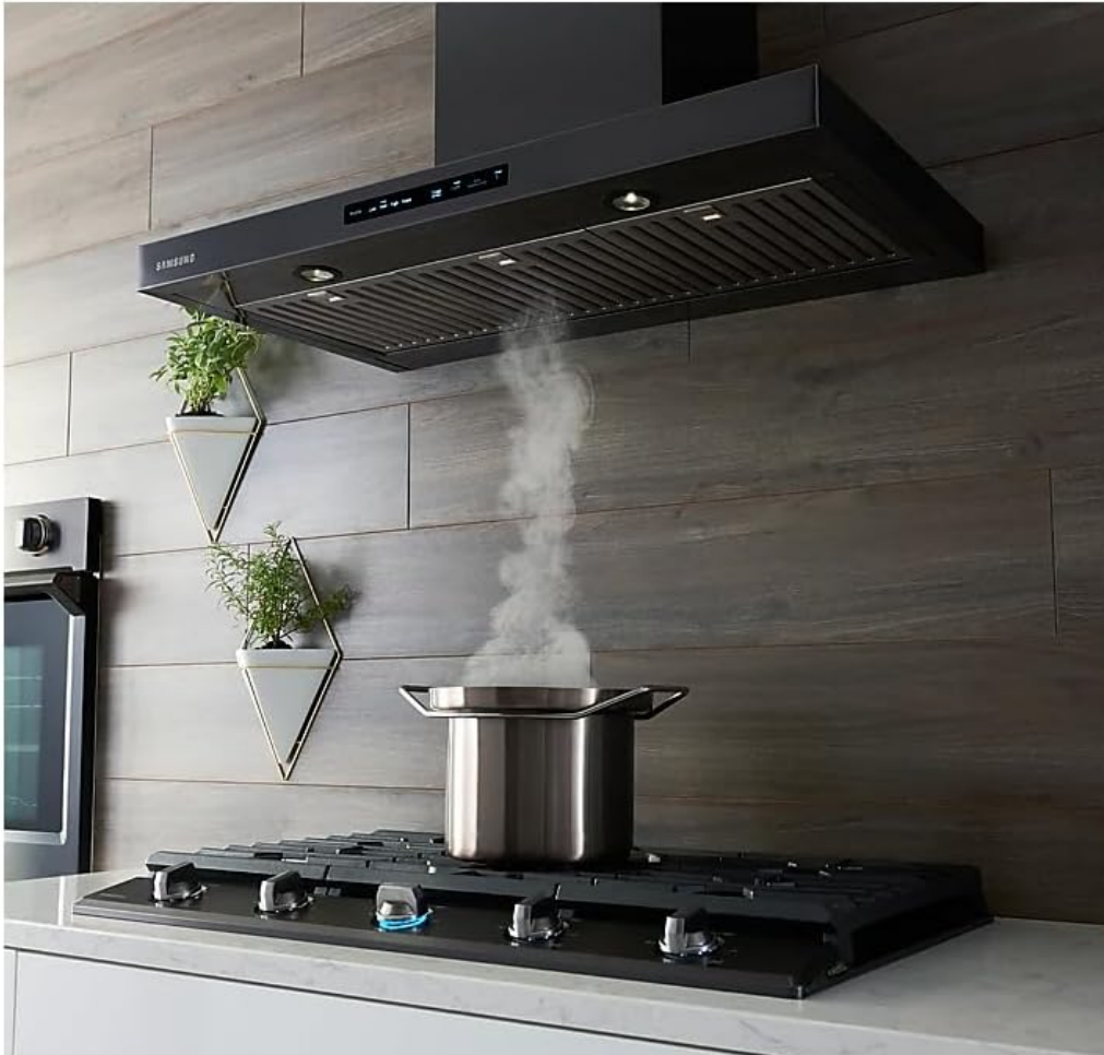
Image: Range hood in operation, demonstrating powerful ventilation.

Powerful 390 CFM 2 ventilation circulates air to remove odors quickly.