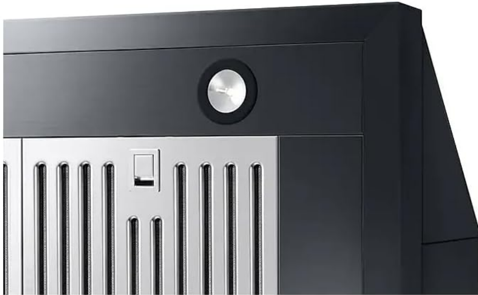
Image: Detail of the LED lighting feature.

With bright LED lights, you can see everything on the cooktop.