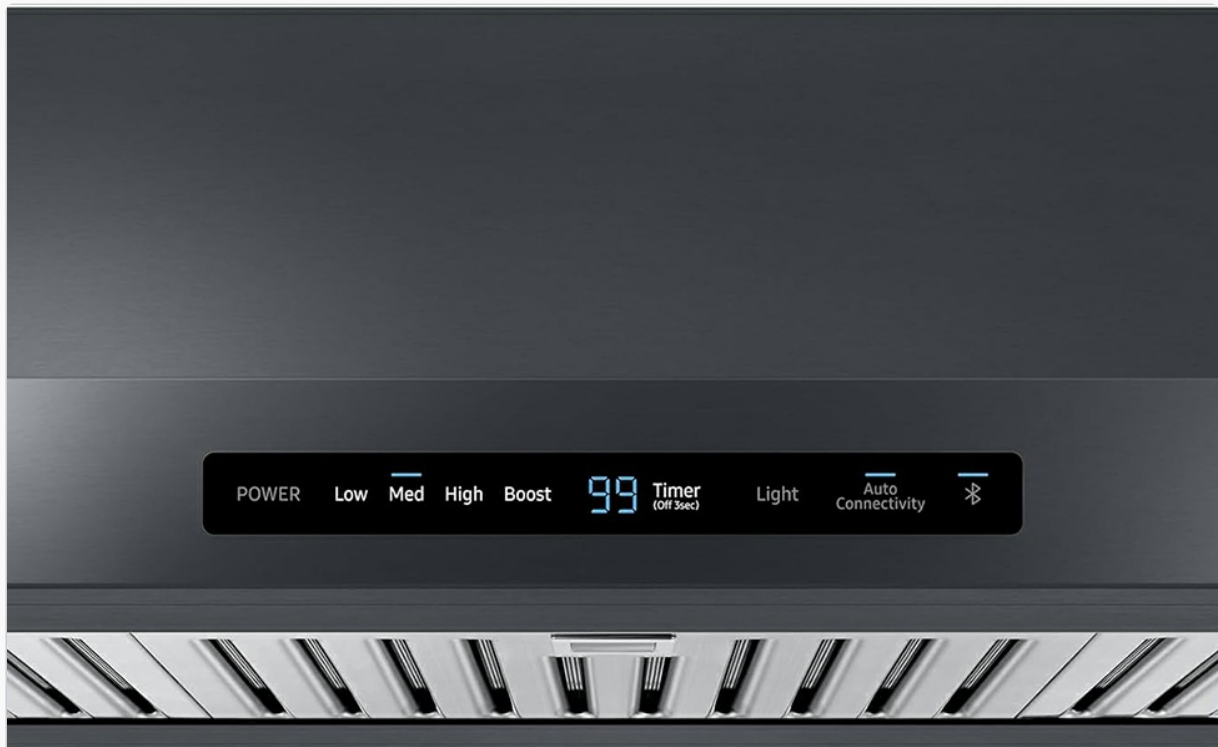
Image: Remote control and monitoring via the SmartThings App.