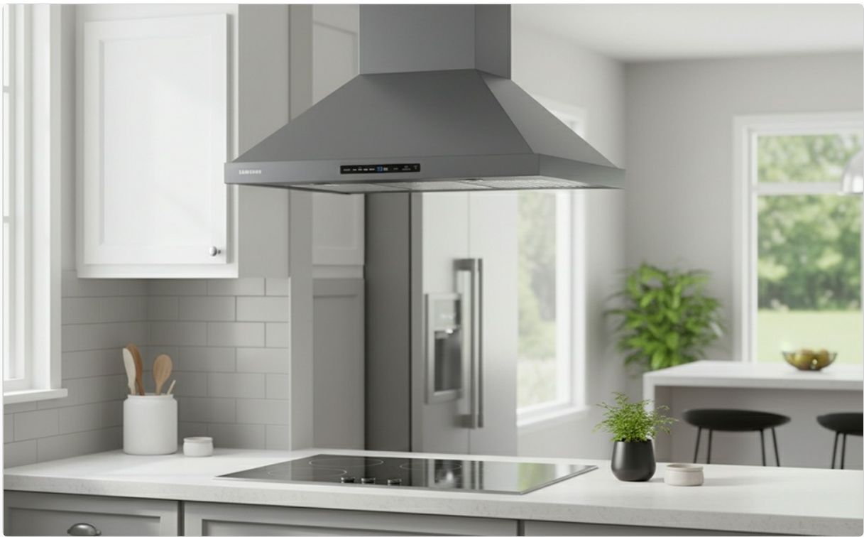
Image: Digital touch controls for power, fan speed (Low, Med, High, Boost), timer, light, and auto connectivity.