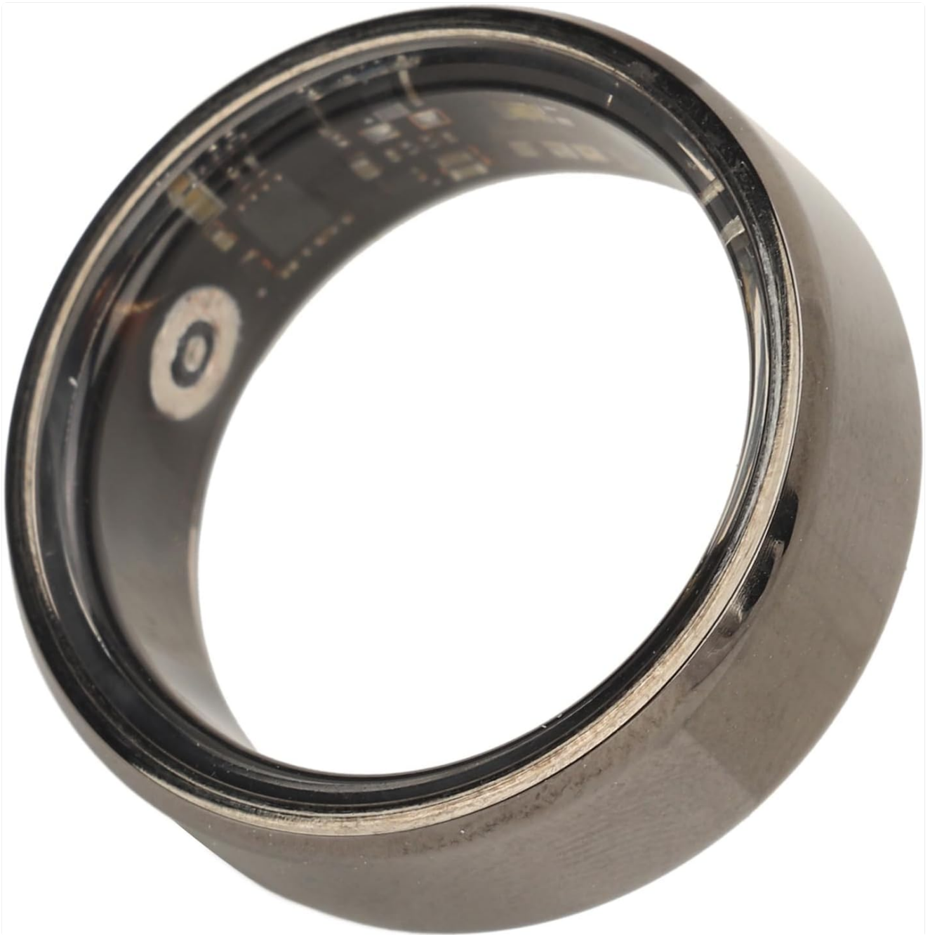
Figure 2.1: Front view of the Smart Ring Health Tracker, showcasing its sleek design and internal components.