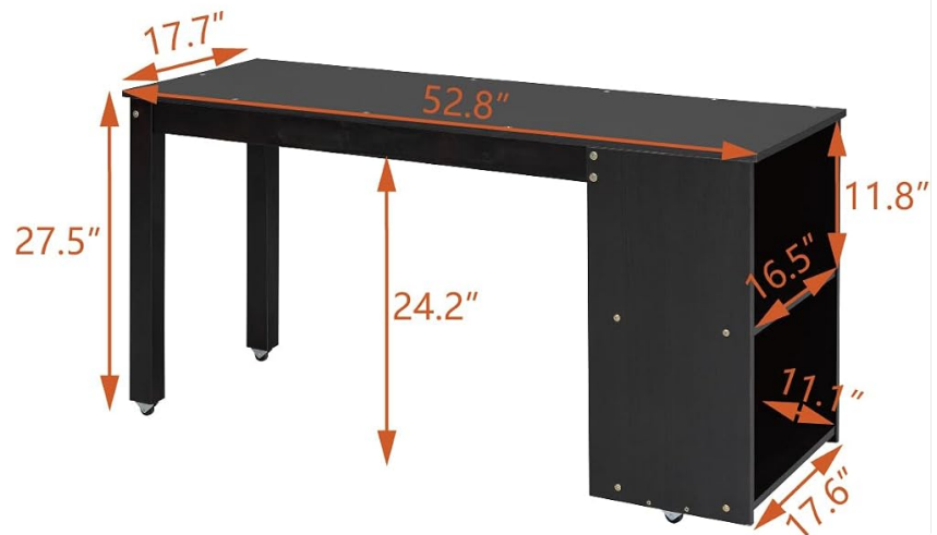
Image: Detailed dimensions of the retractable desk (52.8" L x 17.7" W x 27.5" H) and the separate under-bed shelving unit (52.8" L x 14.2" W x 27.3" H), indicating their individual sizes.