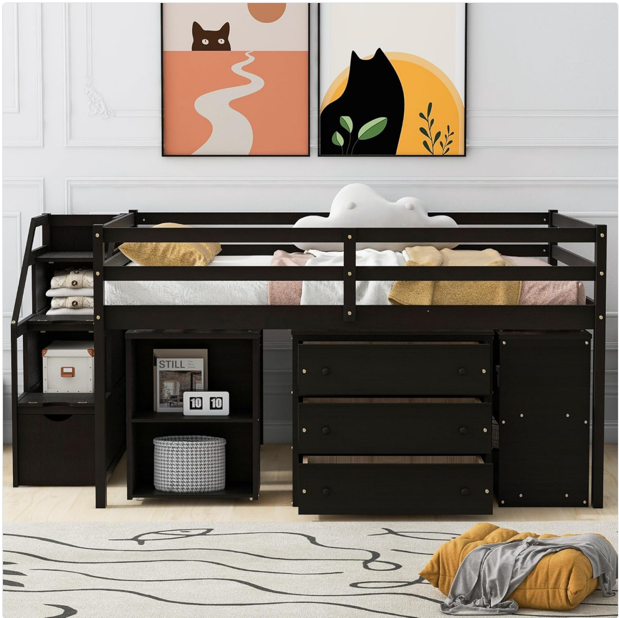
Image: The Mirightone Full Size Loft Bed, showcasing its espresso finish, integrated storage stairs, three drawers, and open shelving units. The bed frame features a sturdy guardrail and wooden slats.