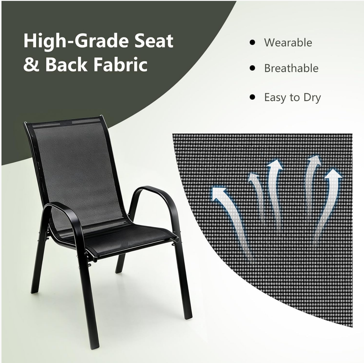
Image: Detail of the chair's high-grade, breathable, and quick-drying fabric.