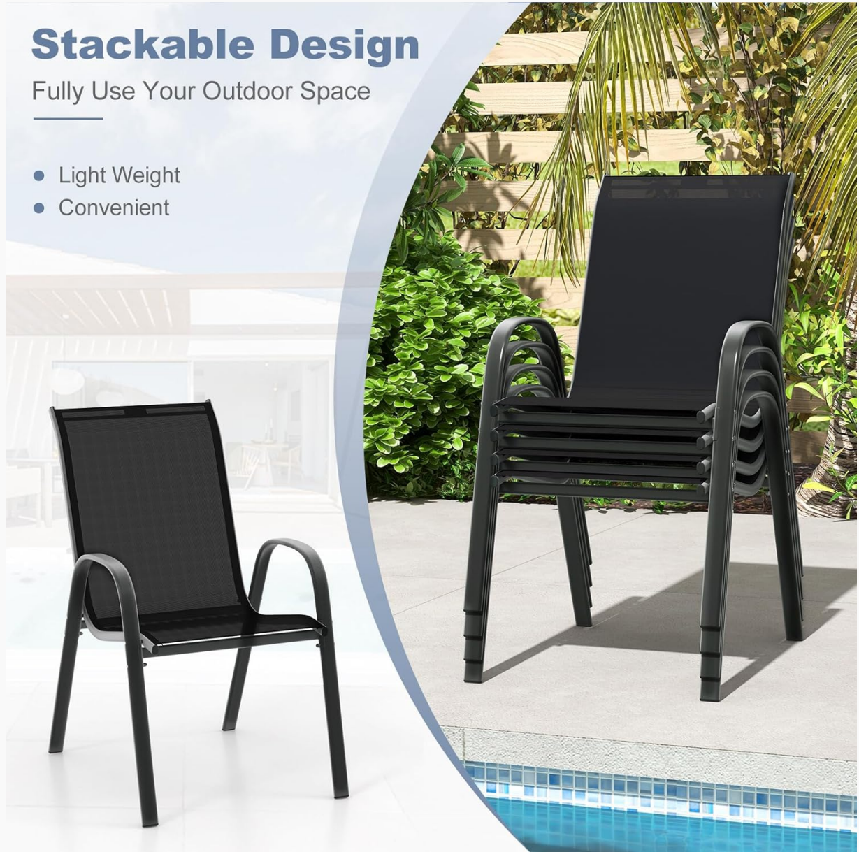
Image: The chairs stacked for compact storage, highlighting their space-saving design.