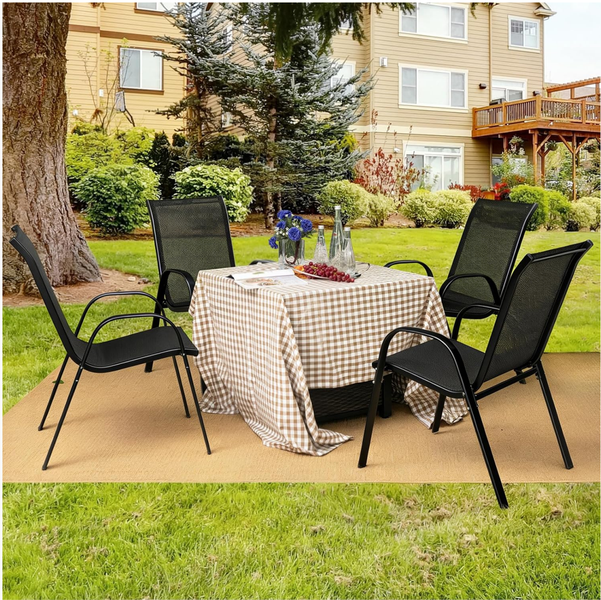
Image: The Giantex Set of 4 Patio Chairs in an outdoor dining arrangement.