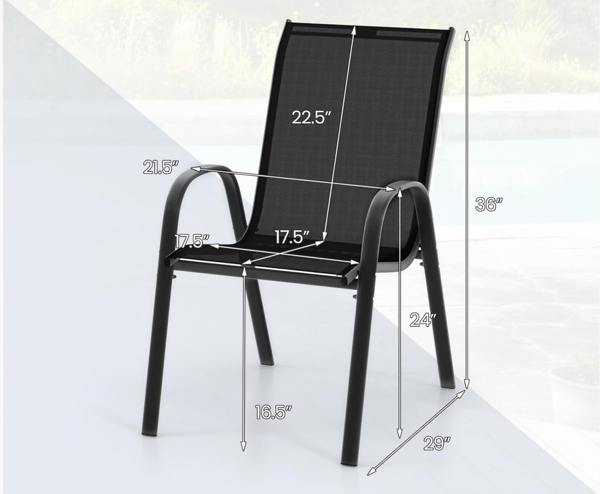
Image: Product dimension diagram for the patio chair.