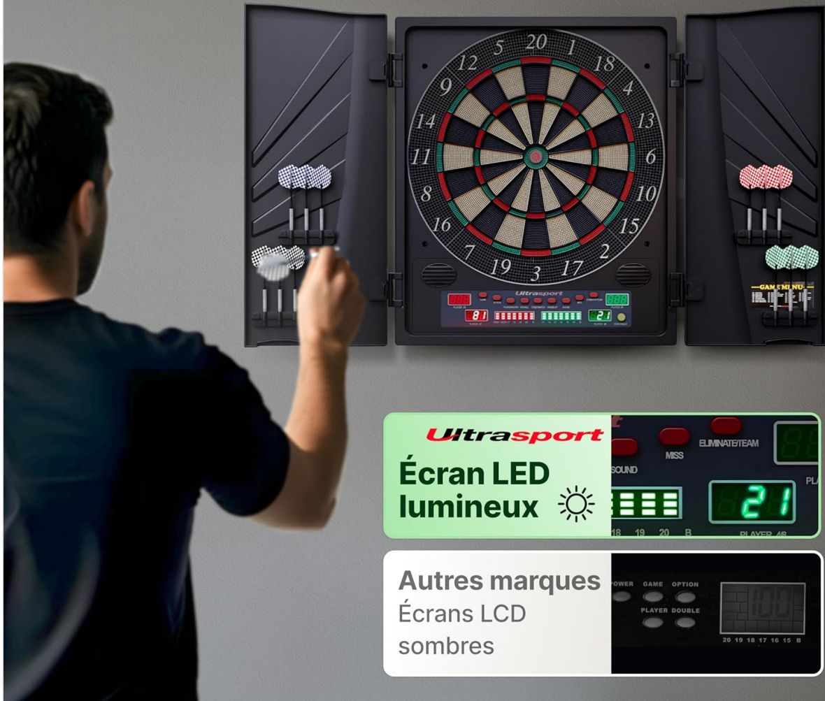
Image: The dartboard's luminous LED display in action, providing clear scoring.