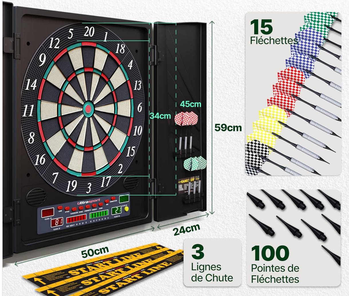
Image: Dartboard dimensions and included accessories, including 15 darts and 100 tips. Note: The product specifications list 12 darts.