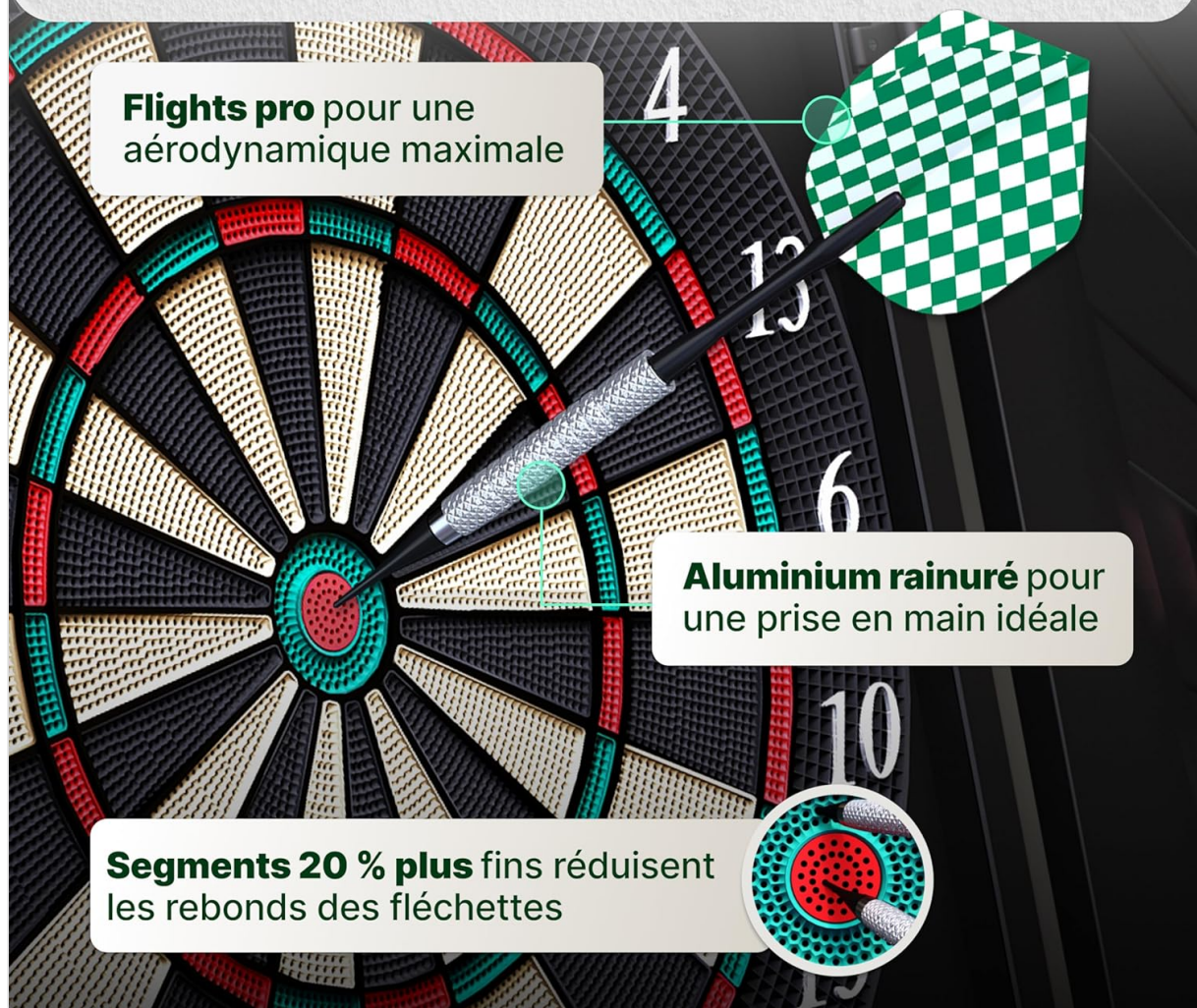
Image: Detail of the dartboard's segments and a dart, illustrating the design for reduced bounce-outs.