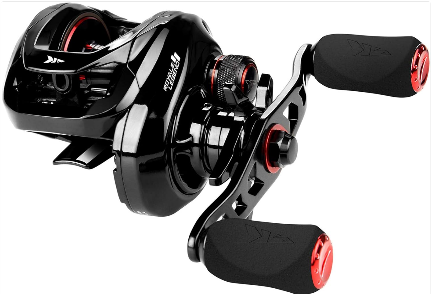
Figure 1.1: Front view of the KastKing Royale Legend II Baitcasting Reel.

The KastKing Royale Legend II Baitcasting Reel is engineered for comfort, performance, and durability. This manual provides essential information for the proper setup, operation, and maintenance of your new baitcasting reel, ensuring optimal performance and longevity.