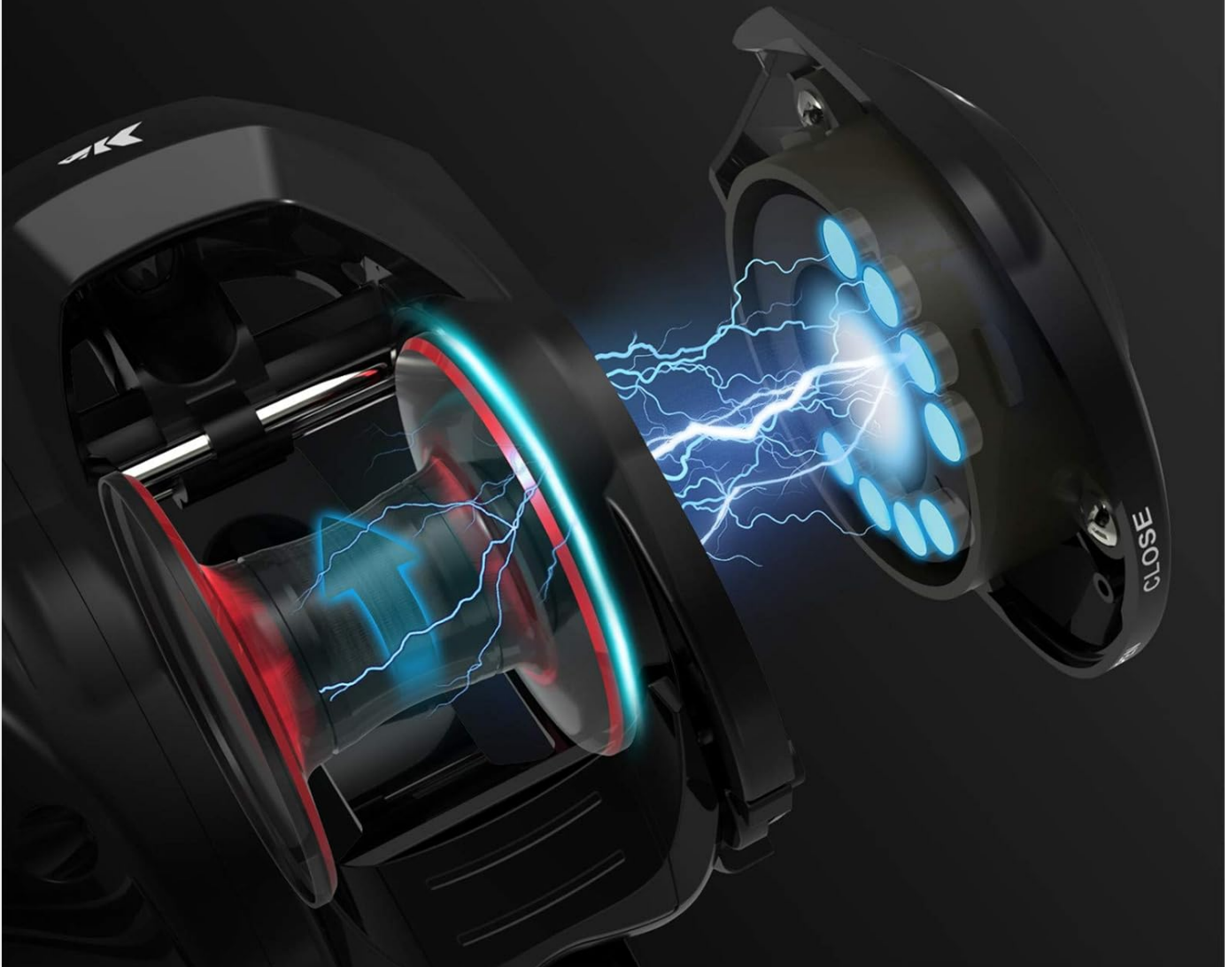
Figure 3.2: Illustration of the Cross-Fire 8 Magnet Braking System.