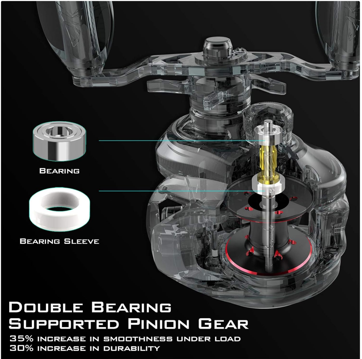
Figure 4.3: Double Bearing Supported Pinion Gear for enhanced smoothness and durability.

The double bearing supported pinion gear and Hamai precision machined brass gears ensure smooth and durable retrieval.