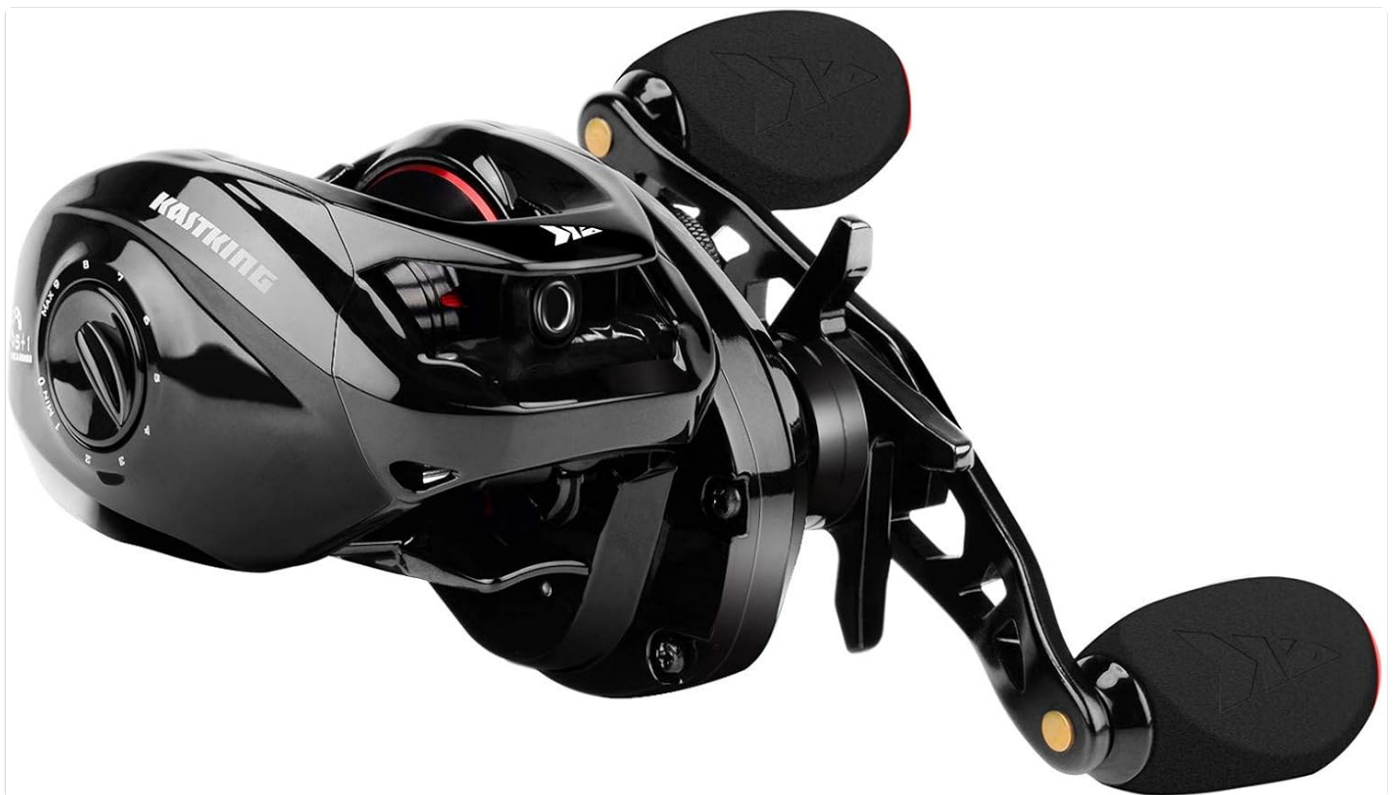
Figure 2.1: Side view of the KastKing Royale Legend II Baitcasting Reel, showing key external features.