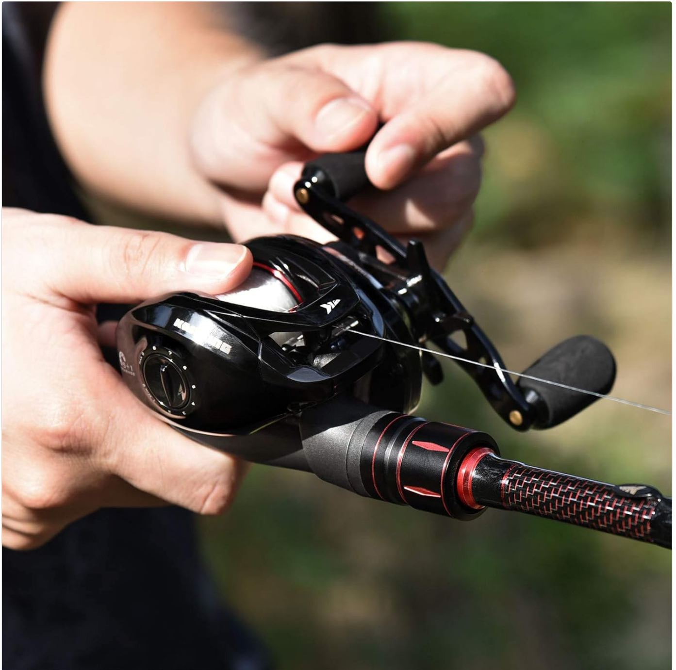
Figure 4.1: Proper grip and thumb placement during casting.