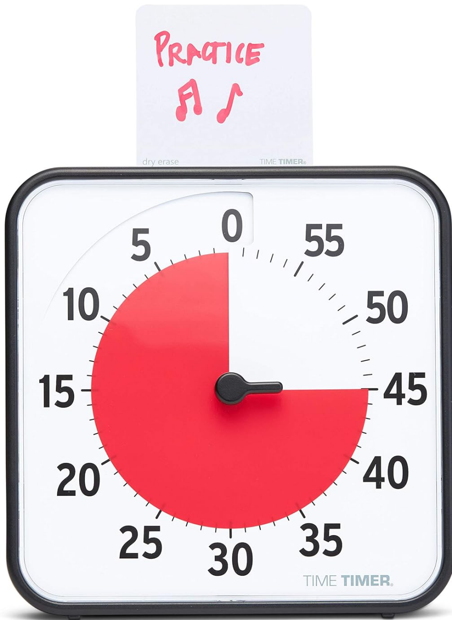
Image: The 8-inch 60-minute visual timer with an activity card in its slot.