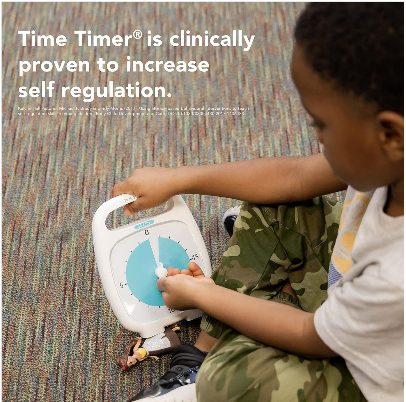
Image: A child interacting with the 20-minute visual timer, demonstrating its ease of use.