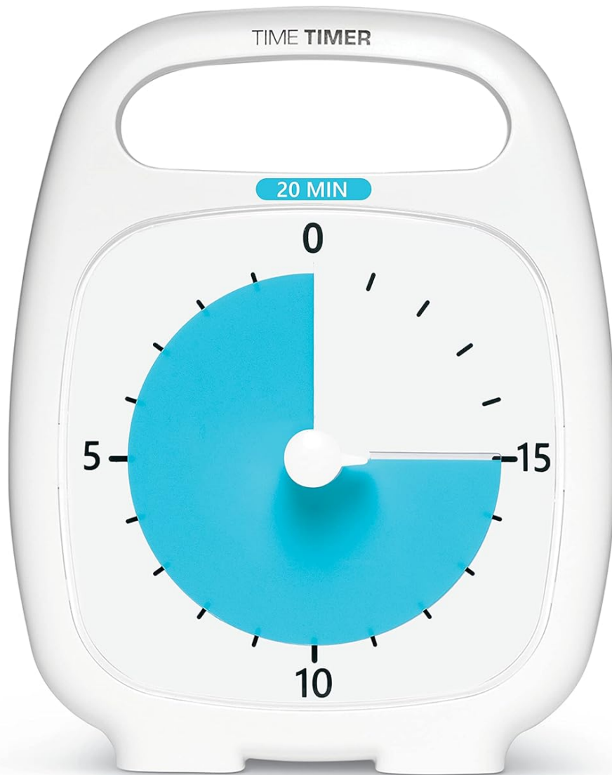
Image: The TIME TIMER PLUS 20-Minute Visual Timer, white with a blue disk.