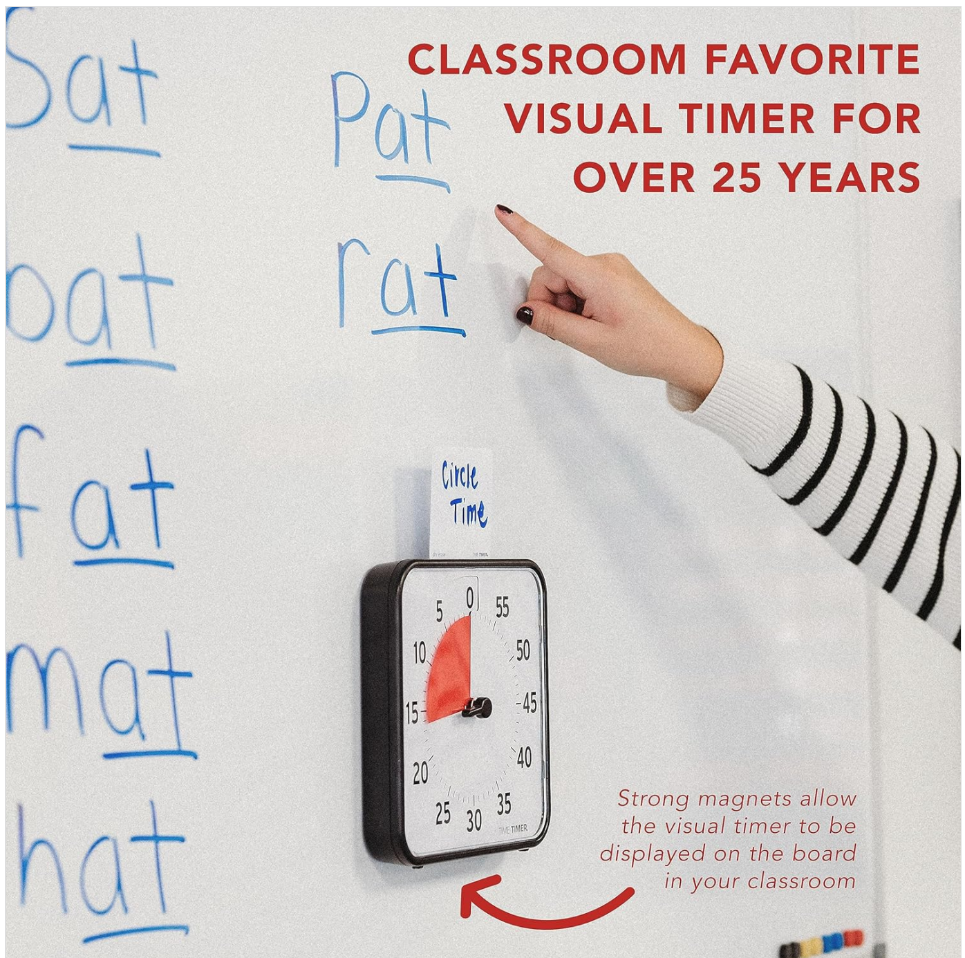
Image: The 8-inch 60-minute visual timer in use on a whiteboard, demonstrating its magnetic capability.