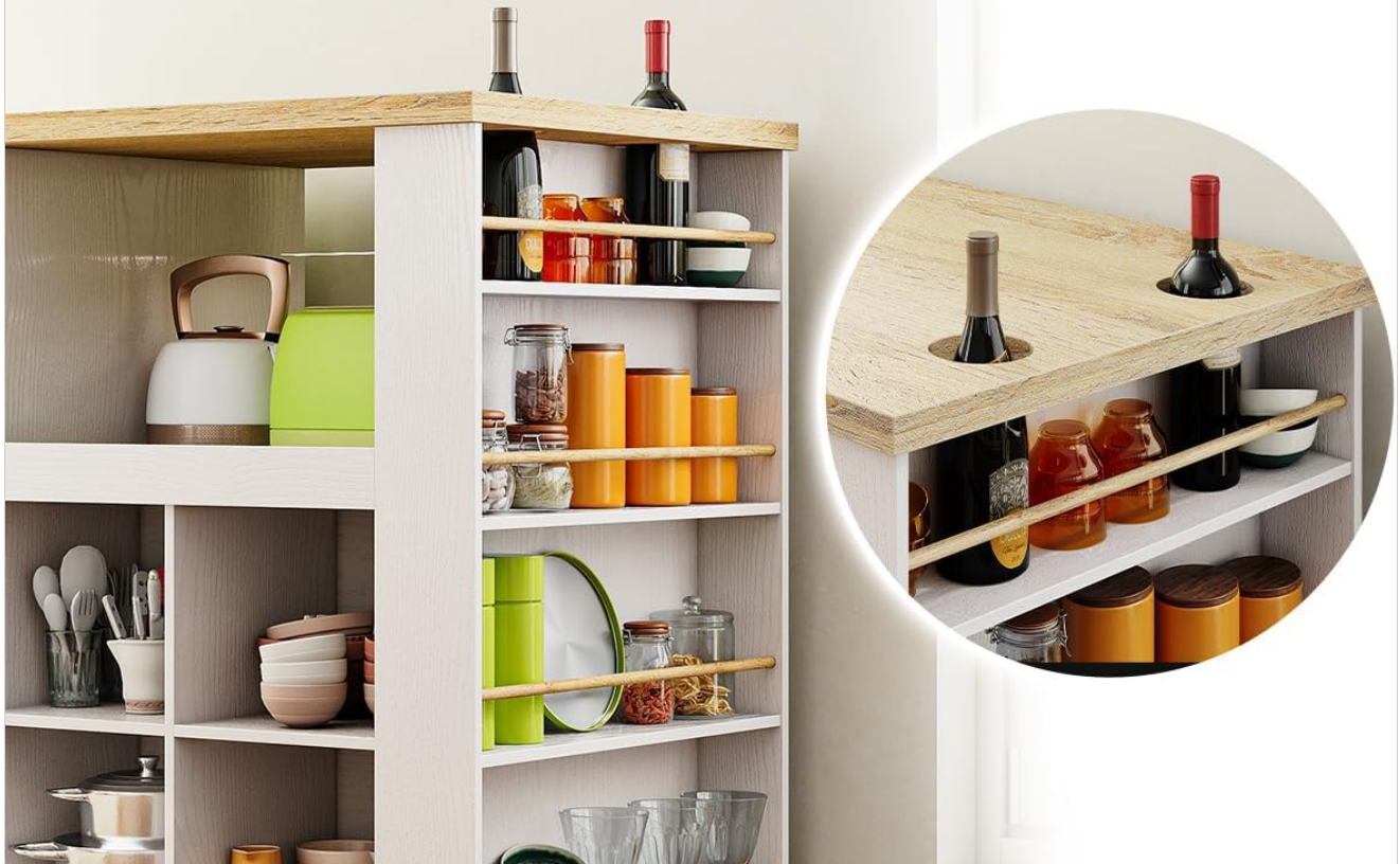
Image: A close-up view of the side of the kitchen island, highlighting the 4-tier spice rack with bottles and the tabletop's inner holes designed for bottle storage.