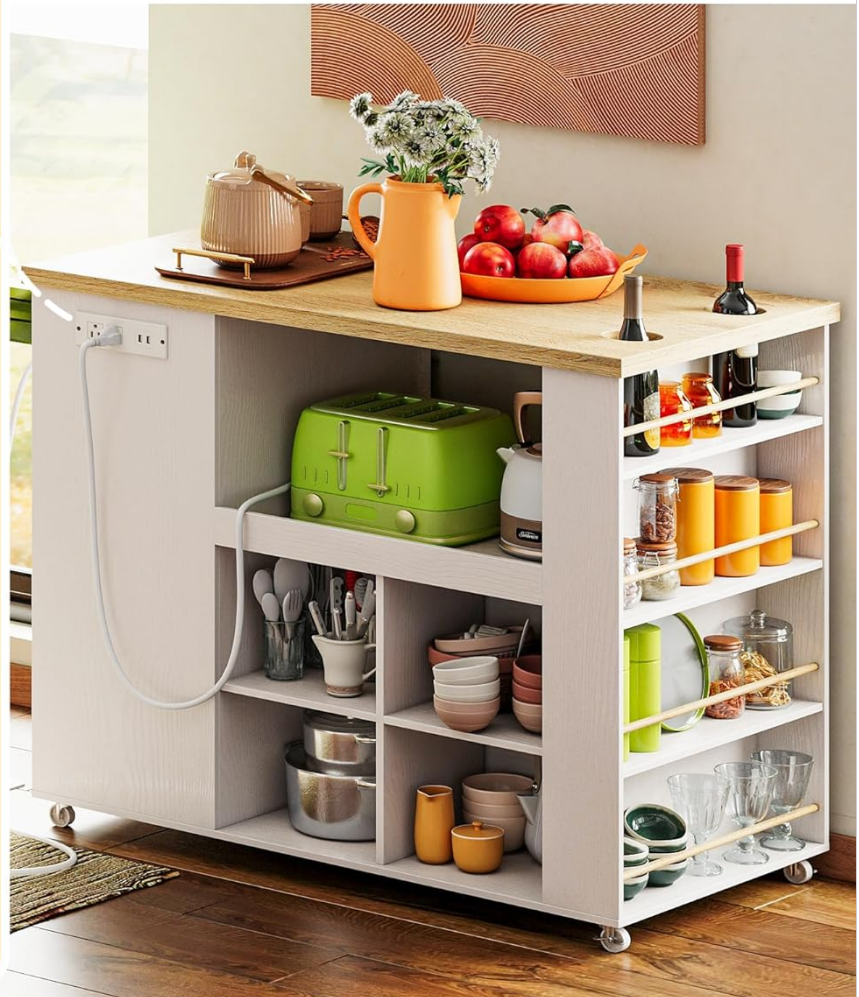
Image: A detailed view of the integrated power outlet unit on the side of the kitchen island, showing two AC outlets and two USB ports, along with the power cord.