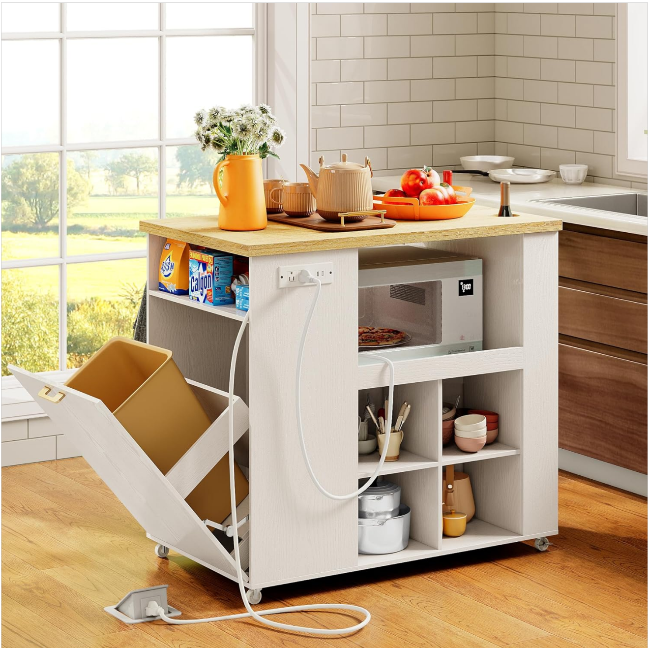
Image: The IRONCK Kitchen Island in a kitchen setting, showcasing its various compartments, including the tilt-out trash cabinet, microwave space, and open shelves. A power cord is visible, indicating the integrated outlets.