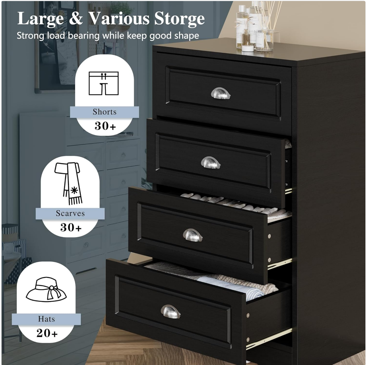
Image: Example of drawer storage capacity, showing organized items.