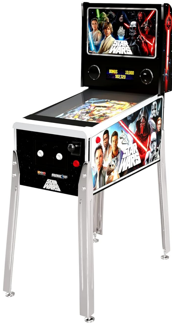
Image: Front view of the Arcade1Up Star Wars Digital Pinball Machine.