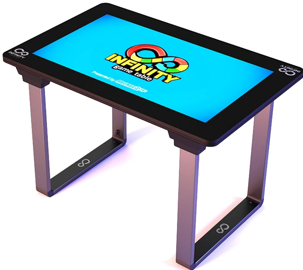
Image: Angled view of the Arcade1Up 32-inch Screen Infinity Game Table.