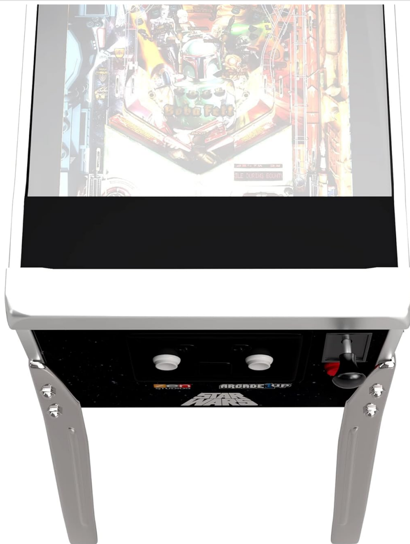
Image: Close-up of the control panel on the Arcade1Up Star Wars Digital Pinball Machine, showing power, volume, and launch buttons.