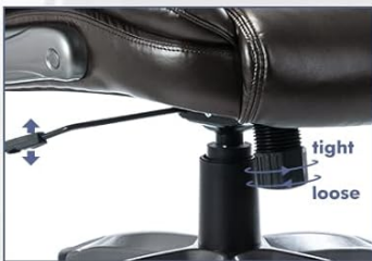
Height Adjustor and Tilt Tension Knob