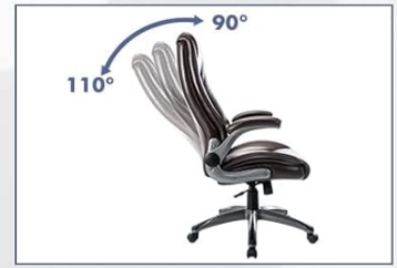
Rocking Back and Forth