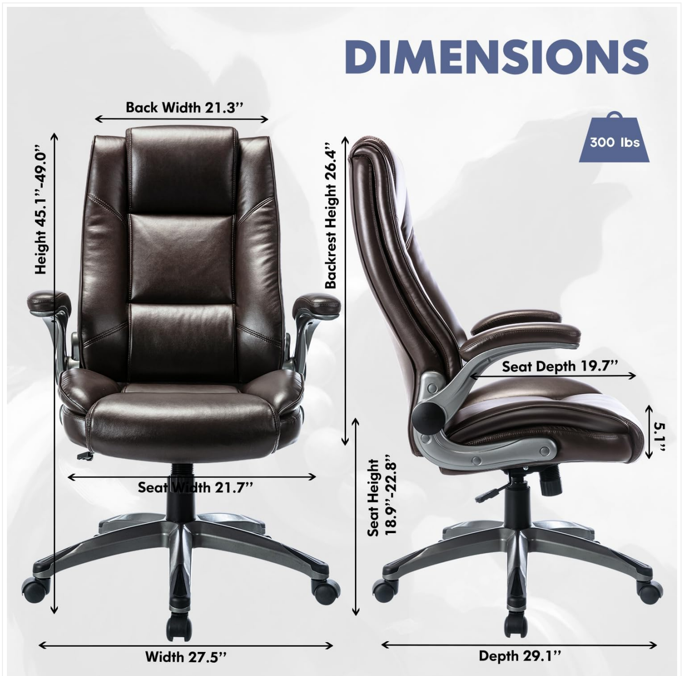
Image: Detailed dimensions of the chair, including height, width, seat depth, and backrest height, indicating a maximum weight capacity of 300 lbs.