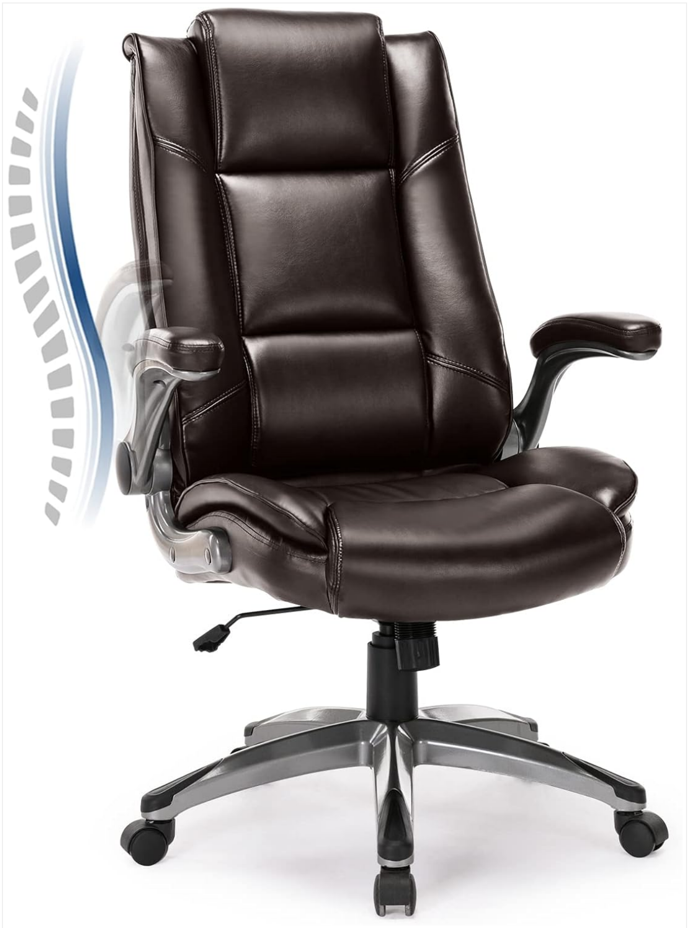
Image: The COLAMY Executive Office Chair, showcasing its high back, padded armrests, and brown bonded leather finish.