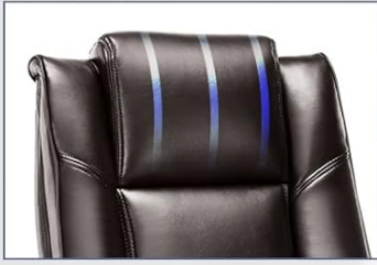
Thick Padded Headrest