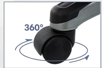
Solid and Smooth-Rolling Casters

Image: A cutaway view of the seat cushion, showing the high-density foam and inner spring pocket pack for enhanced comfort.