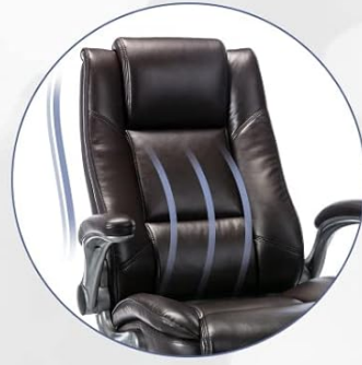
Perfect Neck & Lumbar Support