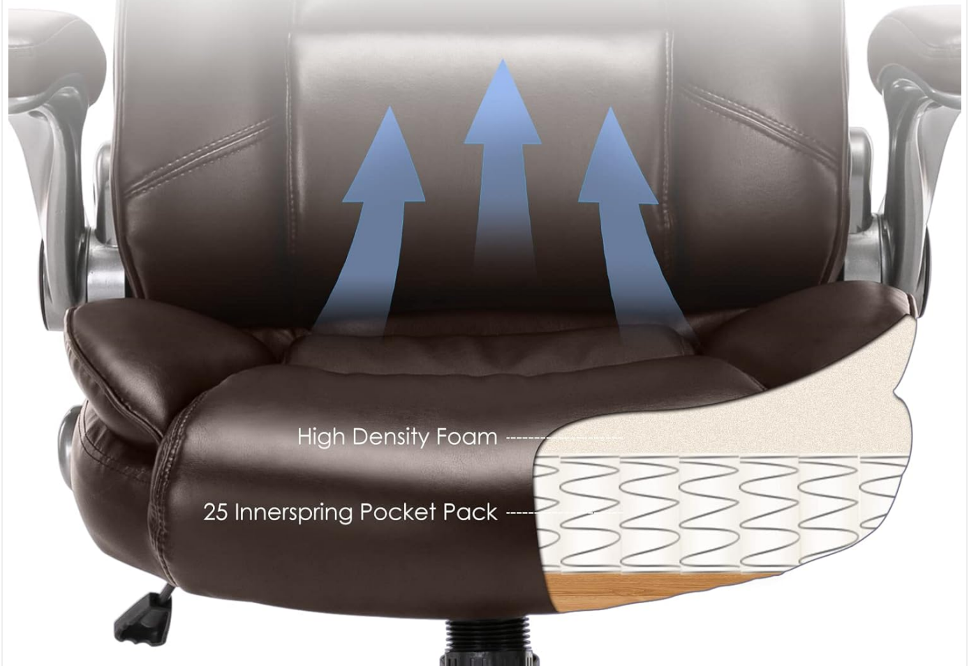
Image: The chair's backrest with an illustration of the adjustable lumbar support mechanism.