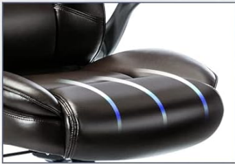
Double Padded Seat Cushion