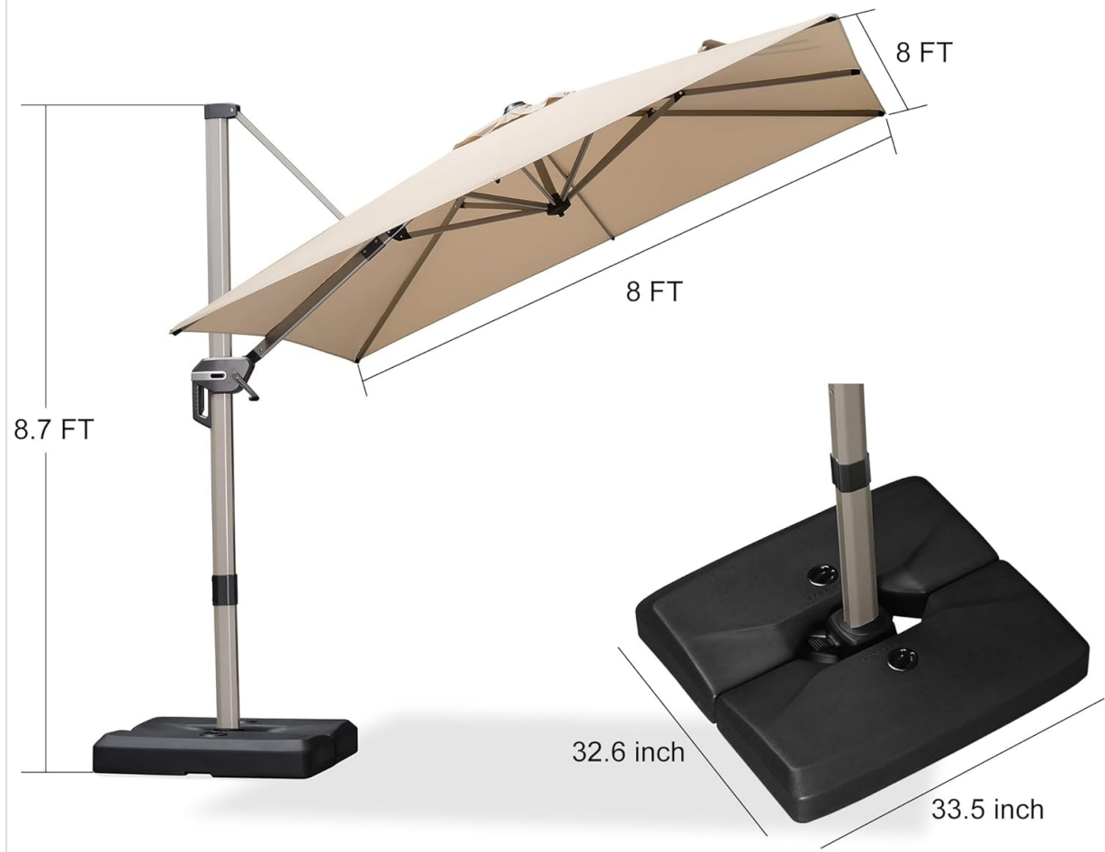
Figure 2.1: Overview of umbrella components and size information.