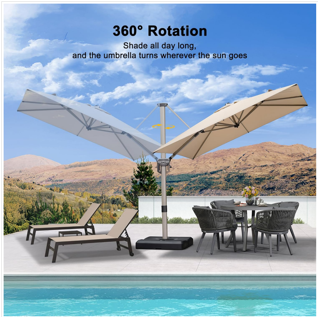
Figure 4.2: The umbrella's 360° rotation feature allows for continuous shade throughout the day.