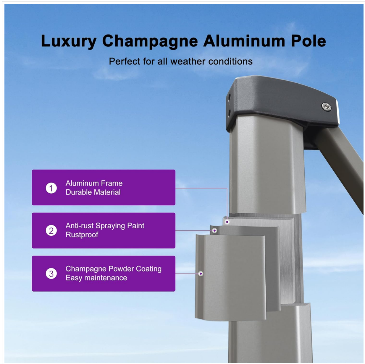
Figure 3.2: The luxury champagne aluminum pole, featuring durable aluminum frame, anti-rust spraying paint, and champagne powder coating for easy maintenance.