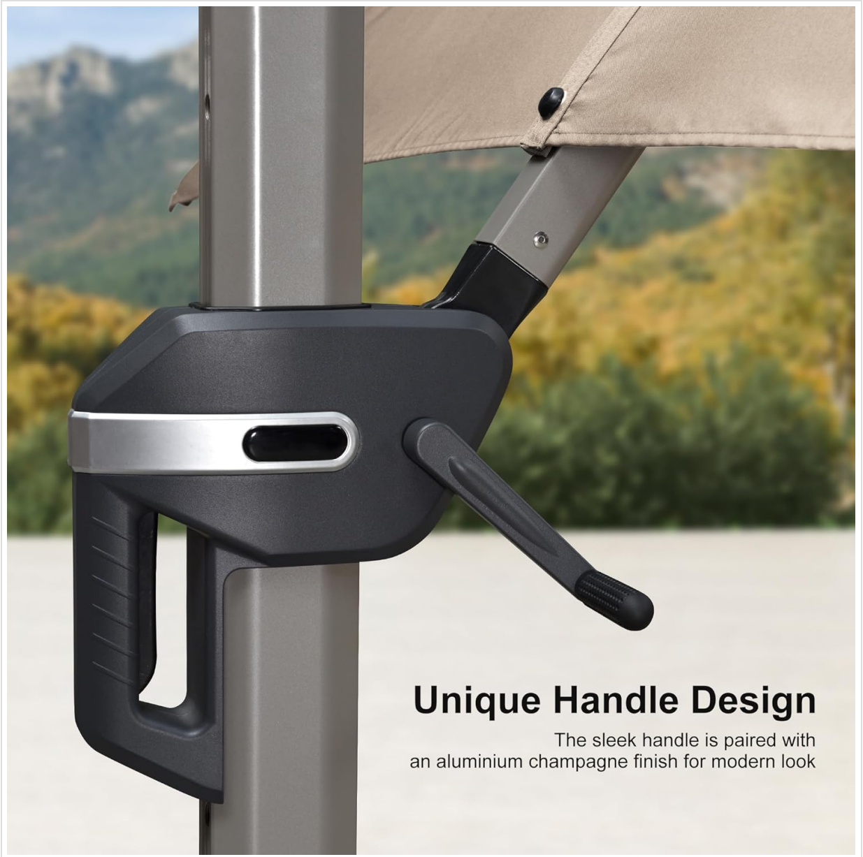
Figure 4.1: The sleek handle design with an aluminum champagne finish for modern look and easy operation.