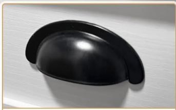
Antique Black Accents