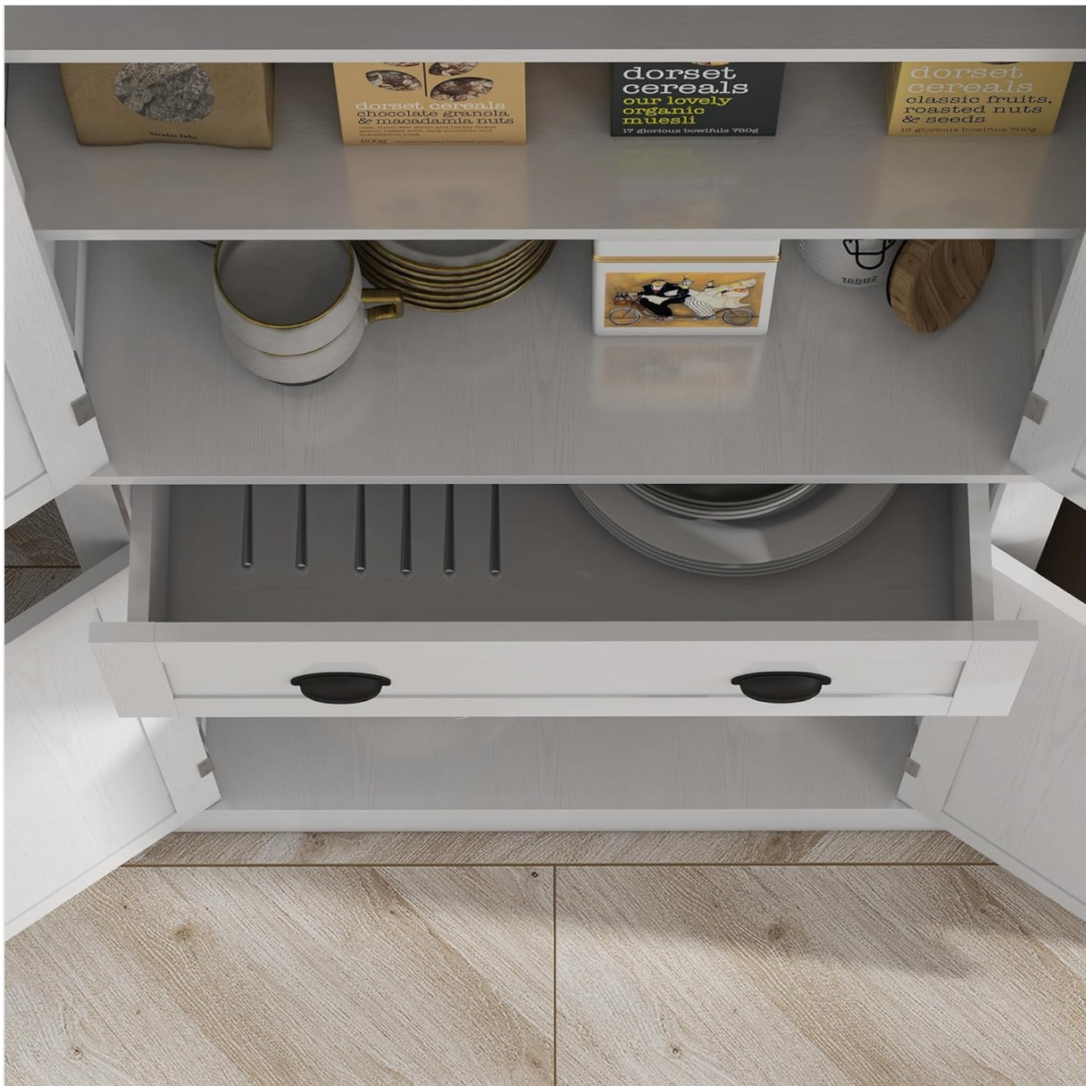
Figure 4: Details of hardware components including hinges, drawer slides, and handles.