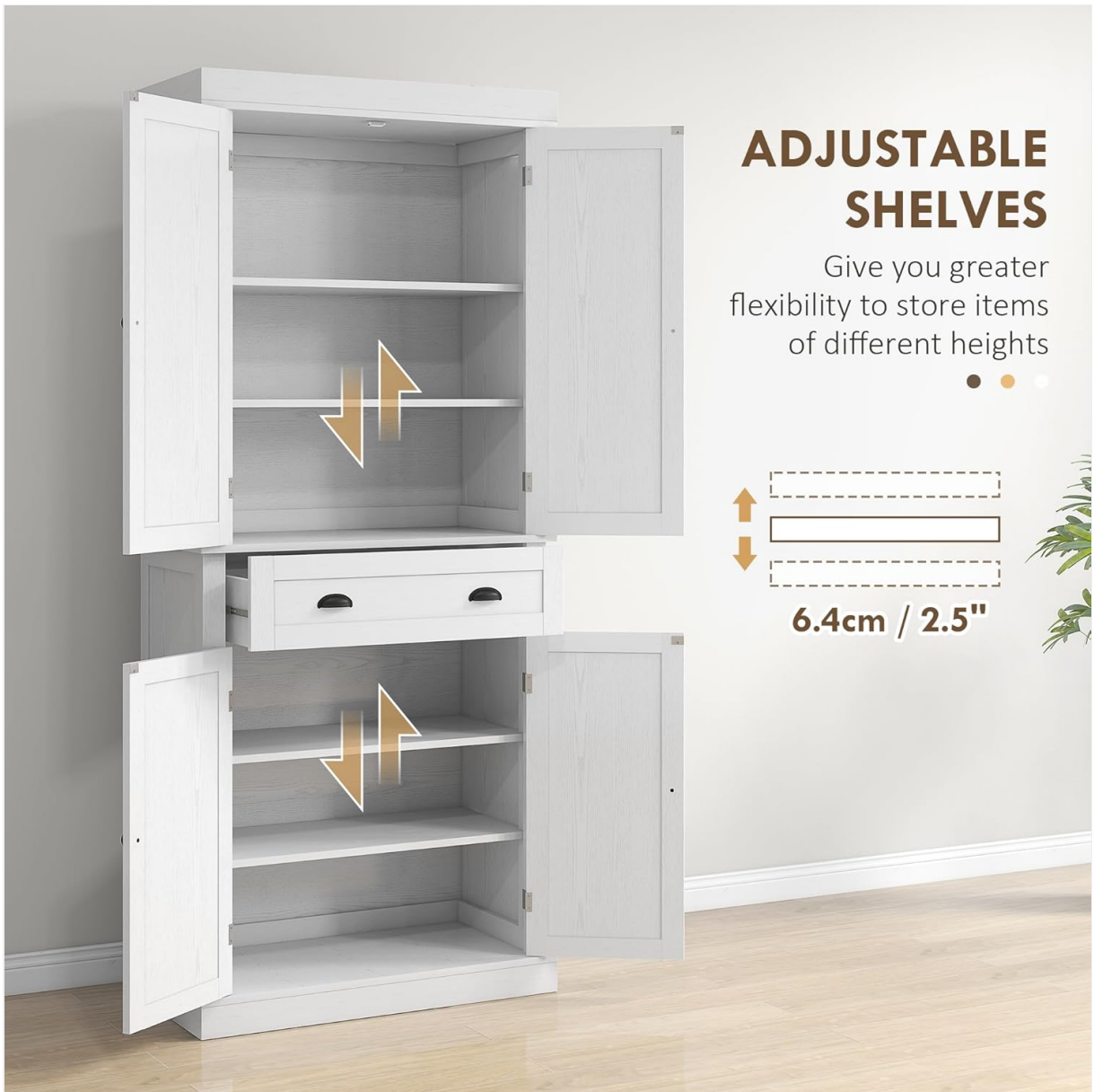
Figure 5: Adjustable shelf mechanism for customized storage.