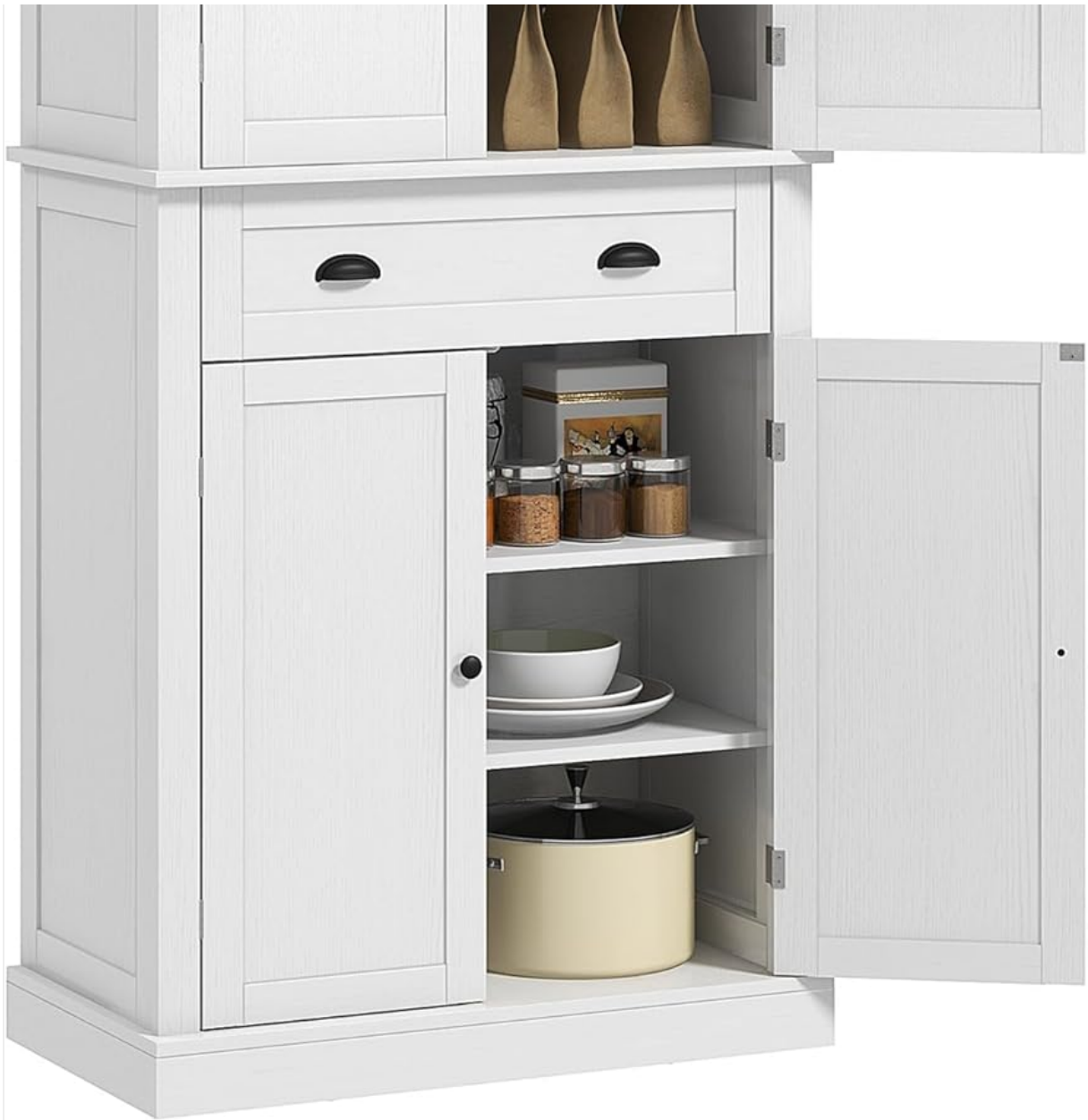
Figure 1: HOMCOM 72.5" Kitchen Pantry Cabinet (White Wood Grain)