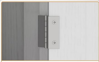
Quality Metal Hinges