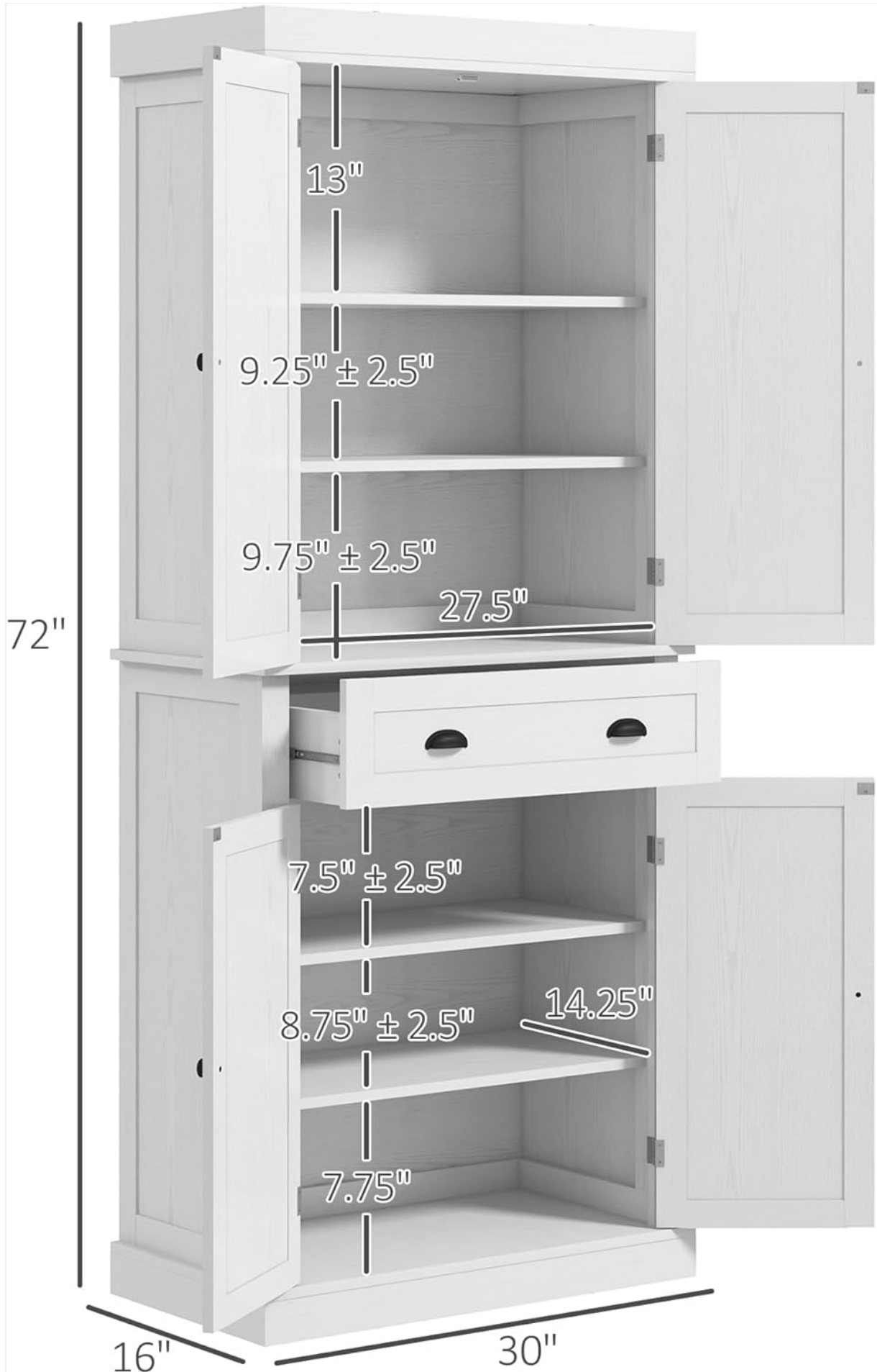
Figure 3: Cabinet dimensions and internal shelf measurements.

5. Wall Attachment: Once assembled, secure the cabinet to the wall using the provided anti-tip kit as shown in Figure 2.