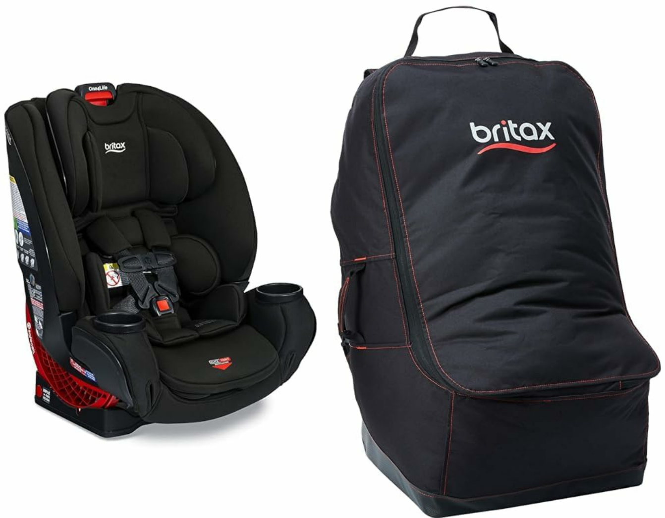
Image 1.1: The Britax One4Life ClickTight All-in-One Car Seat in Eclipse Black, shown alongside its dedicated travel bag. The car seat features a robust design with integrated cup holders, while the travel bag is black with red accents and the Britax logo, designed for easy transport.