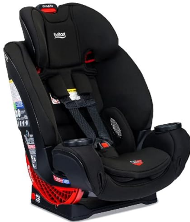
Preschool 22-65 lbs