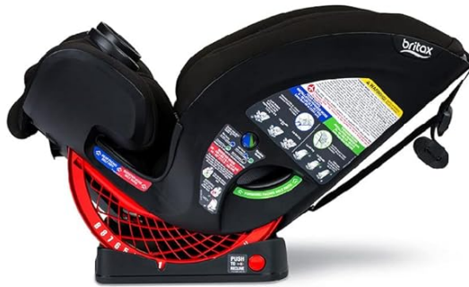
Infant 5-20 lbs