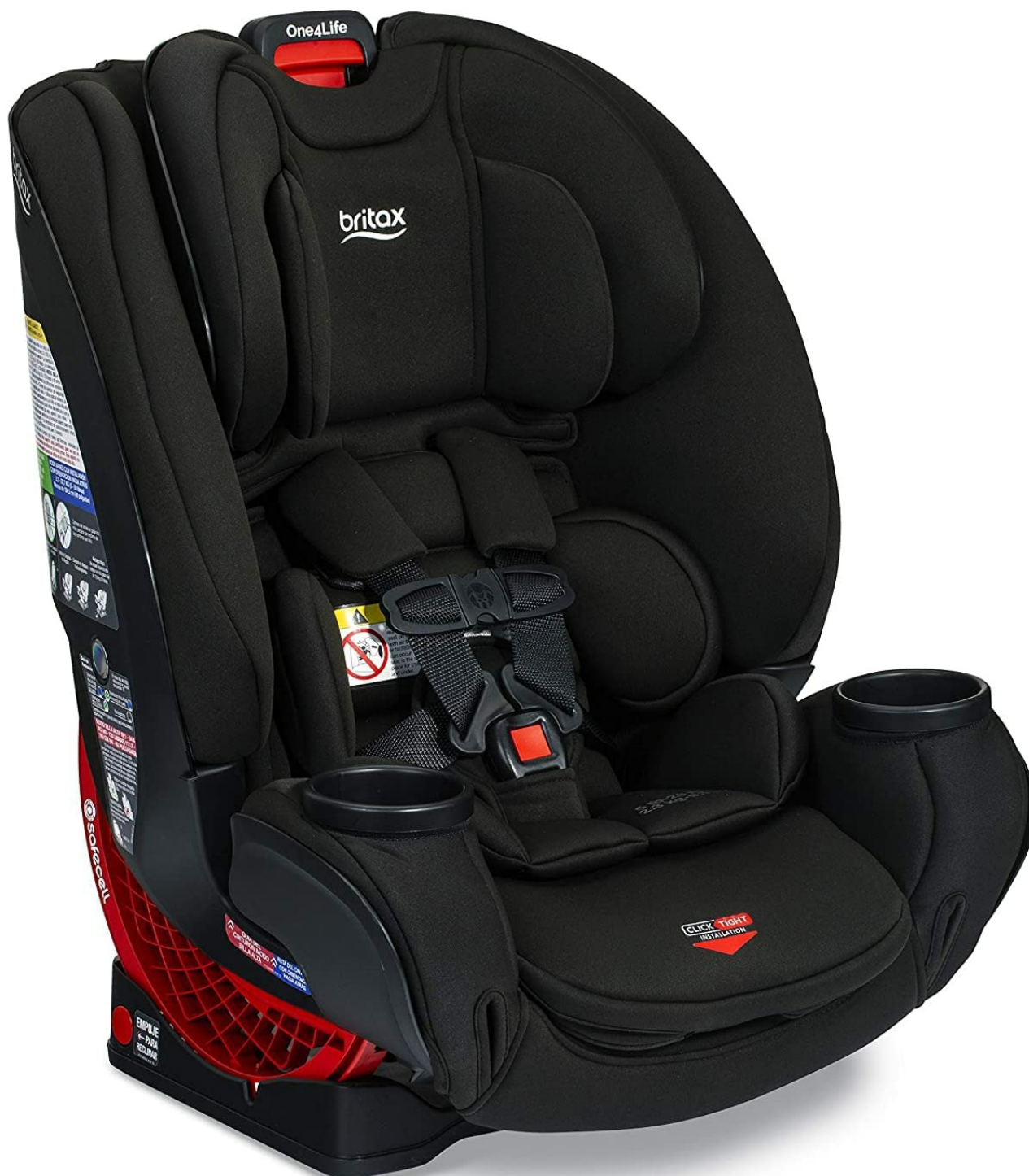
Image 3.1: A detailed view of the Britax One4Life ClickTight All-in-One Car Seat in Eclipse Black, highlighting its padded seating, adjustable headrest, 5-point harness, and integrated cup holders.