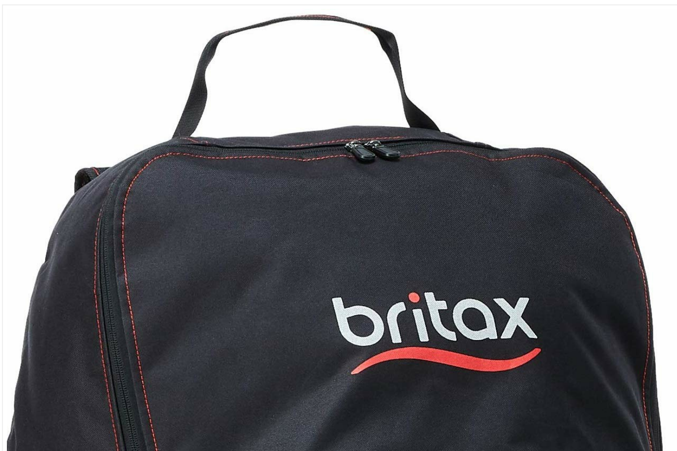
Image 4.3: Top-down view of the Britax Car Seat Travel Bag, showing the wide double zipper opening and the top carry handle, designed for easy access and portability.