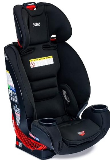
Big Kid 40-120 lbs