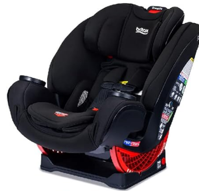
Toddler 20-50 lbs