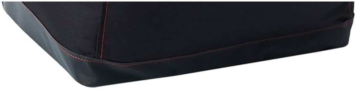
Image 3.2: The Britax Car Seat Travel Bag, shown in black with red stitching and the Britax logo, featuring a durable design with multiple carry options.