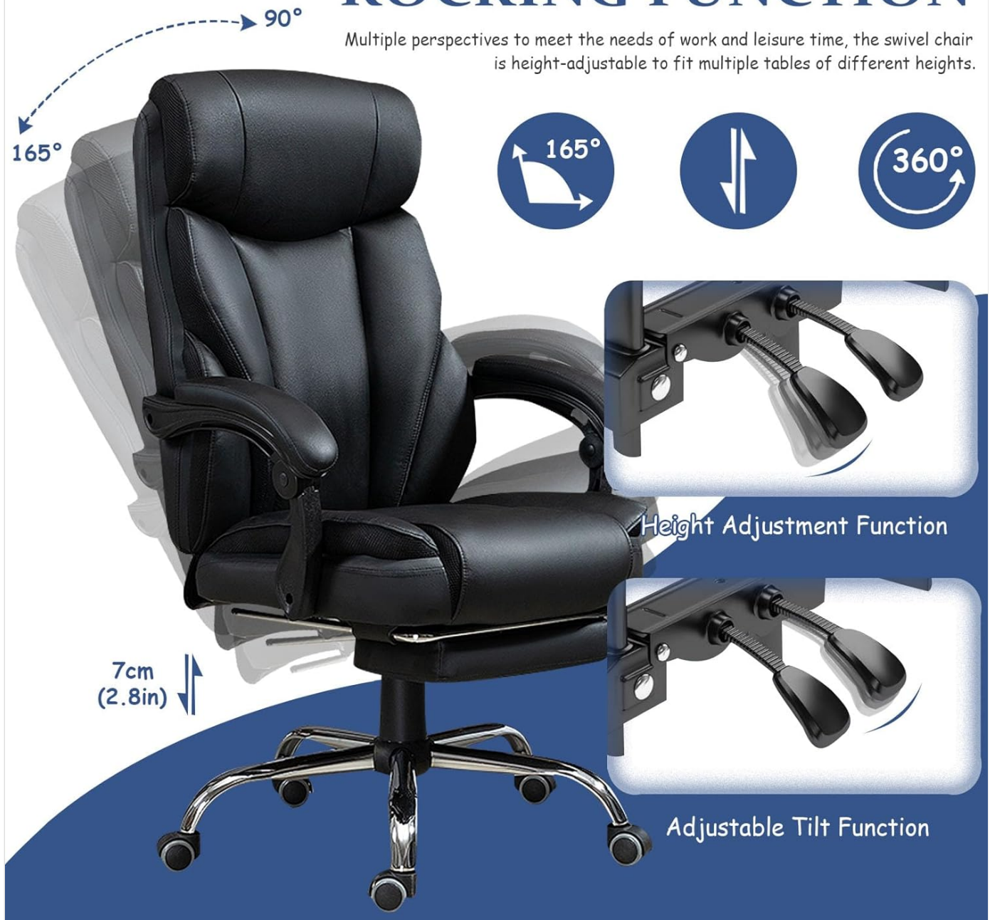
Image: Visual guide demonstrating the chair's rocking capability between 90° and 165°, along with close-ups of the height adjustment and tilt control levers.

Multiple perspectives to meet the needs of work and leisure time, the swivel chair is height-adjustable to fit multiple tables of different heights.