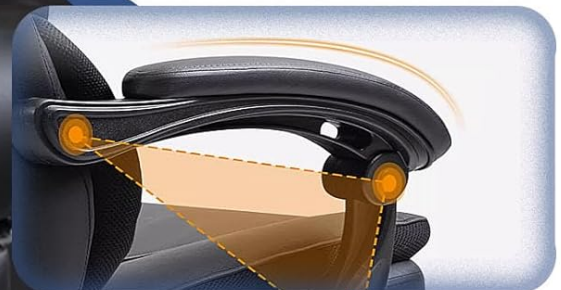
Ergonomic Curved Armrest Design

Image: Detailed view of the chair's materials, including the wear-resistant PU leather fabric, high-density sponge padding in the cushion, and the ergonomic design of the curved armrests.