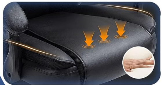
High Density Sponge Padded Cushion