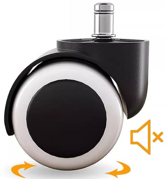
Image: Close-up view of the chair's sturdy steel base and anti-slip silent casters, highlighting the robust construction for stability and smooth movement.

Easy to move, smoothly glide while protecting the floor from scratches.