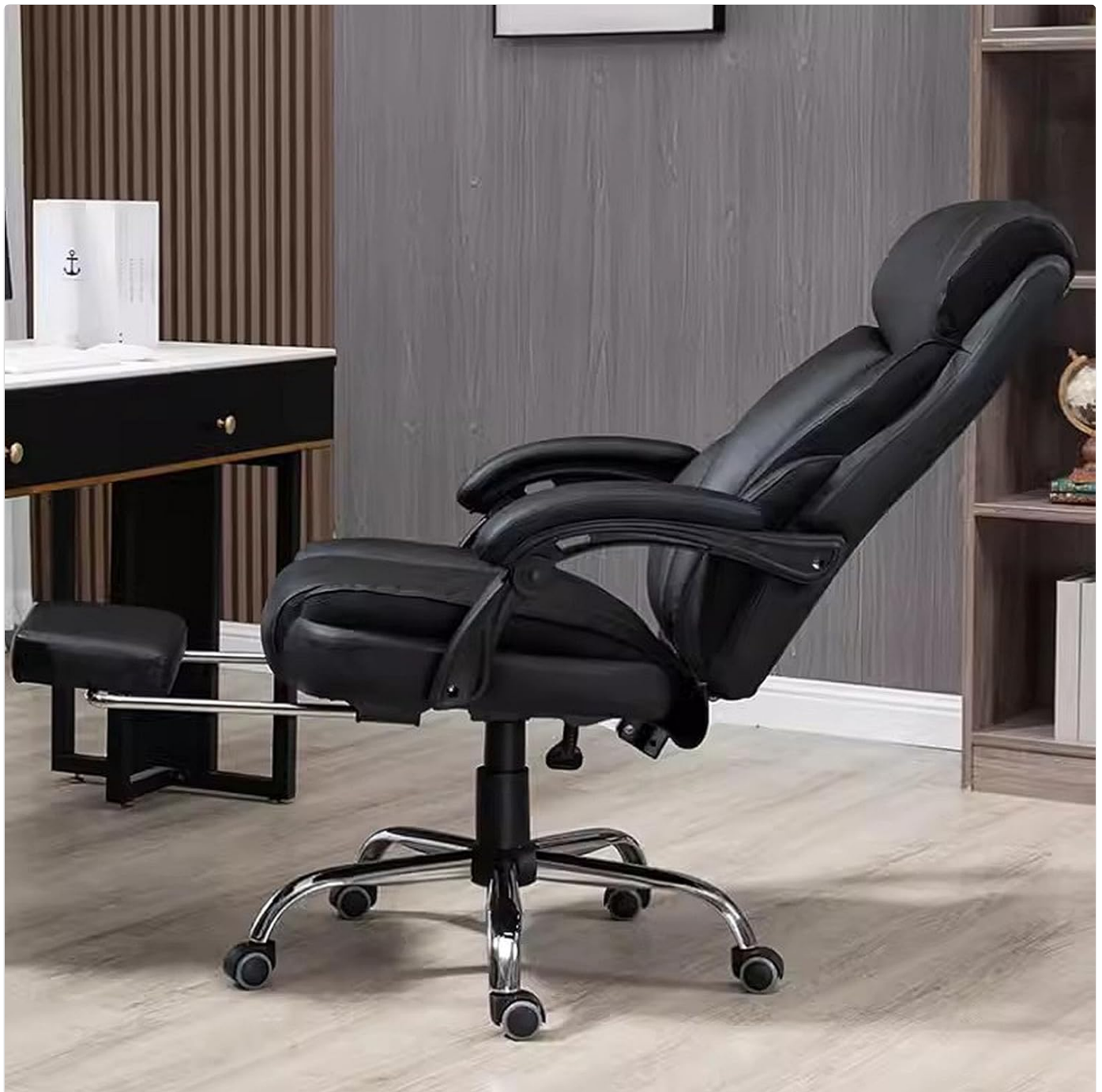
Image: The Ergonomic Office Chair shown in a fully reclined position with the retractable footrest extended, illustrating its relaxation capabilities.