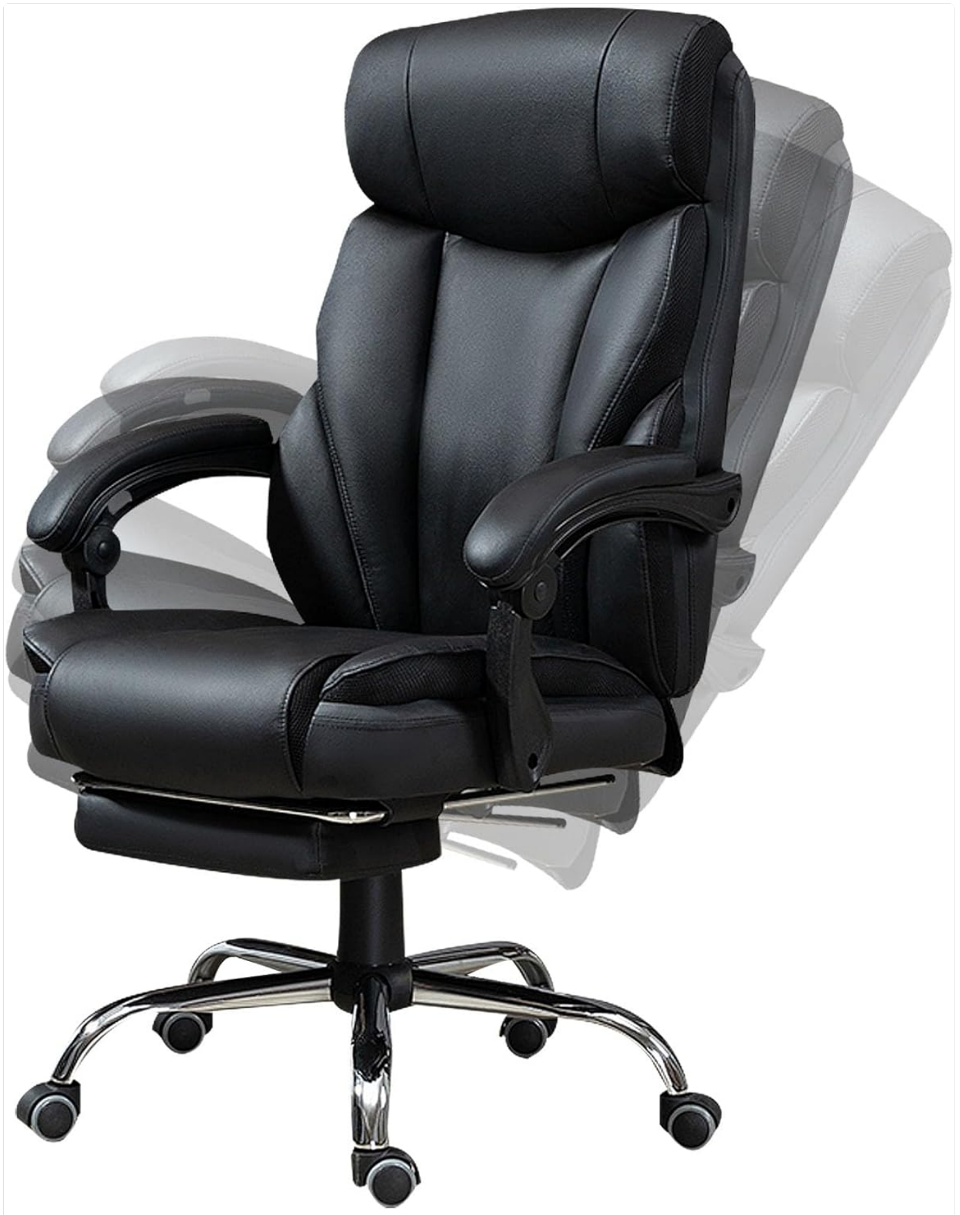
Image: The Ergonomic Office Chair in its standard upright position, with a subtle visual indication of its tilt capability.