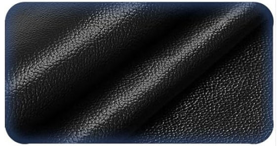
Wear-Resistant PU Leather Fabric

The swivel chair is made of PU leather fabric, wear-resistant retractable footrest can release pressure on your legs.