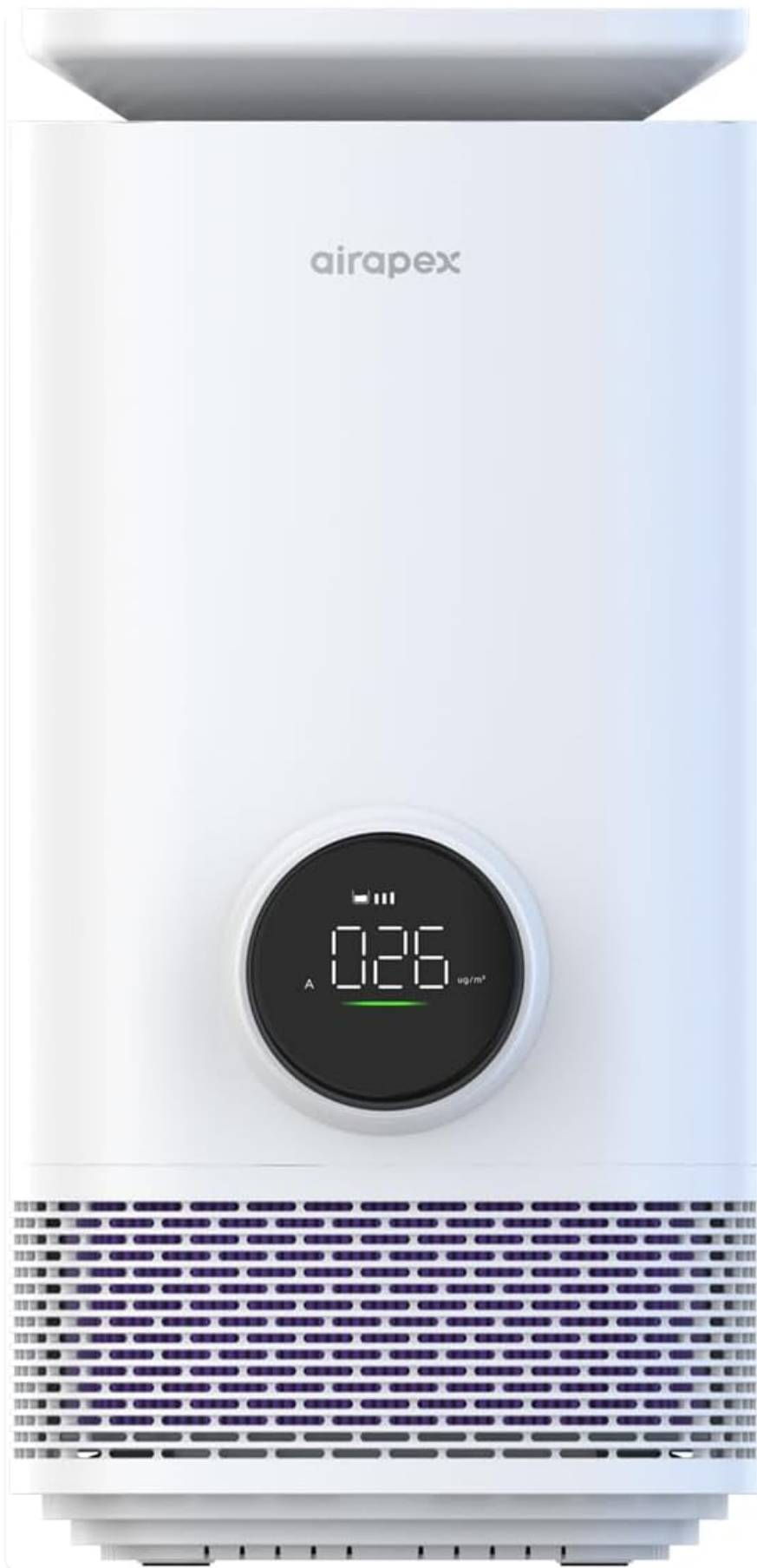
The AIRAPEX T7pro Air Purifier and Evaporative Humidifier Combo, a sleek white unit with a digital display.