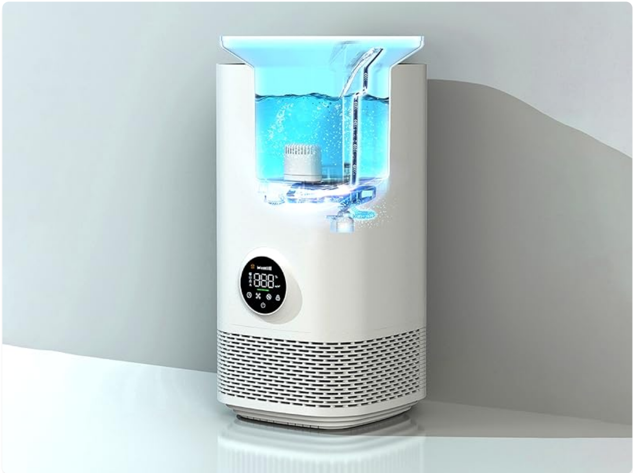
Image showing water being poured into the top opening of the air purifier's water tank.