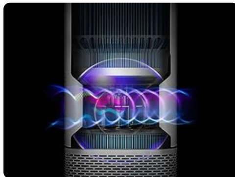
Diagram illustrating the Activated Carbon Filter, True HEPA 13 Filter, and Preliminary Filter layers.