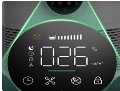
Close-up of the digital control panel and display, showing various indicators and controls.