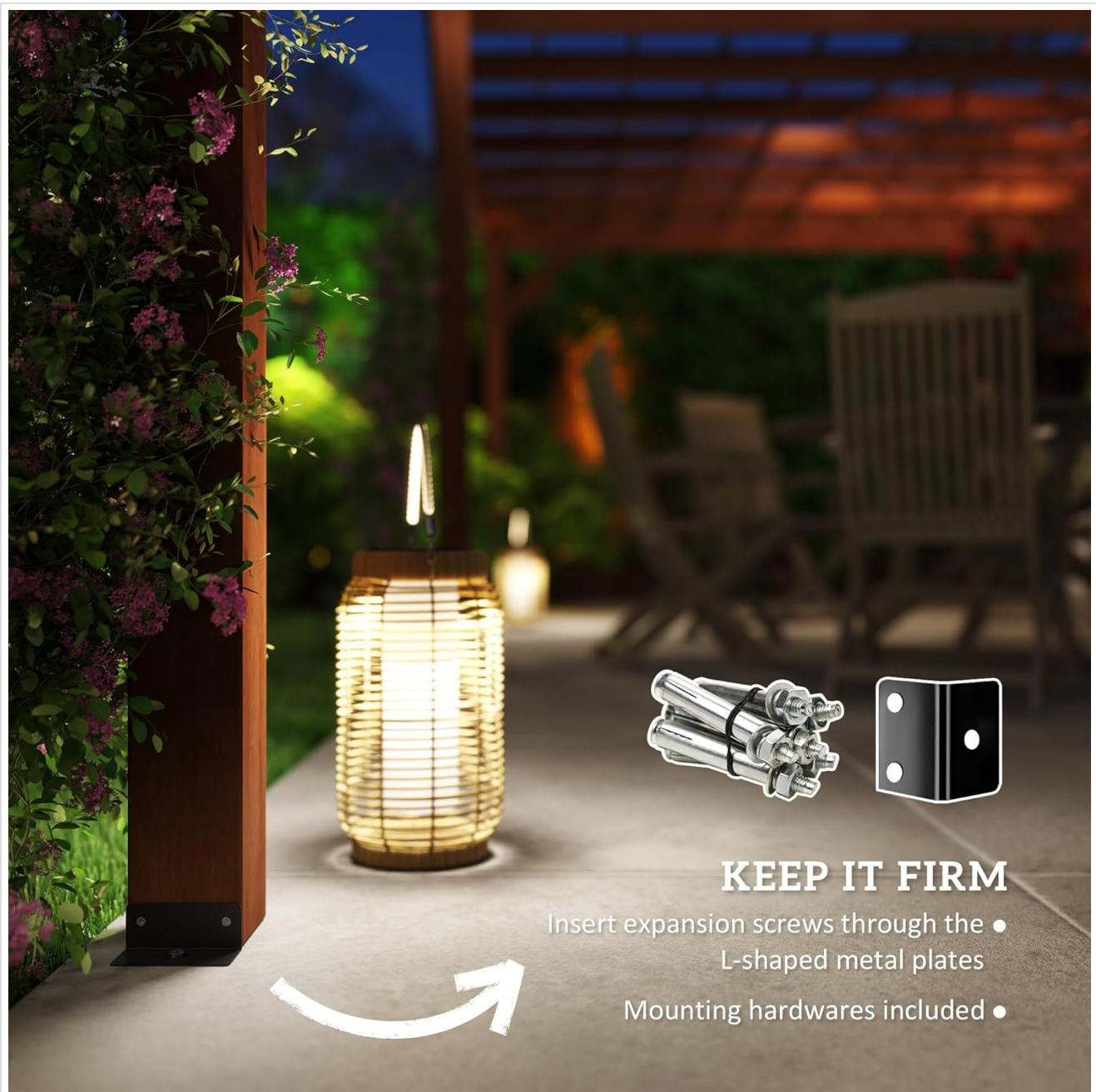
Image: Illustration of the expansion screws and L-shaped metal plates used to firmly anchor the pergola to the ground, ensuring stability.