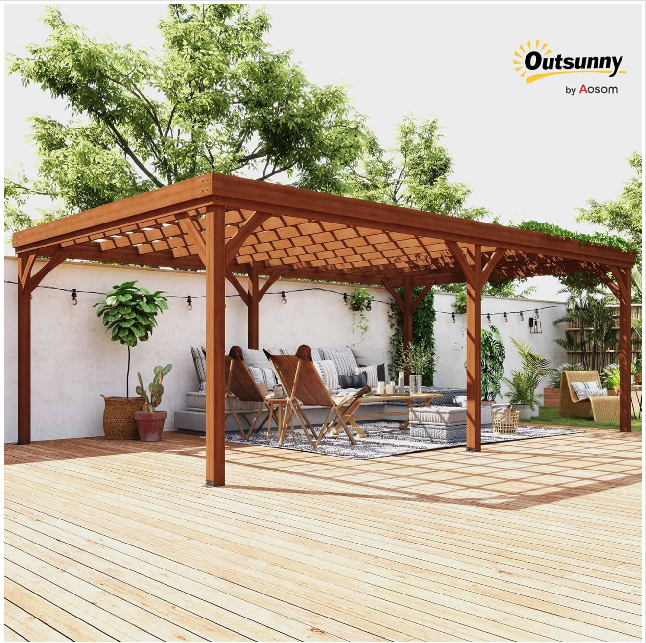
Image: The pergola creating a shaded and inviting outdoor living space with comfortable patio furniture.