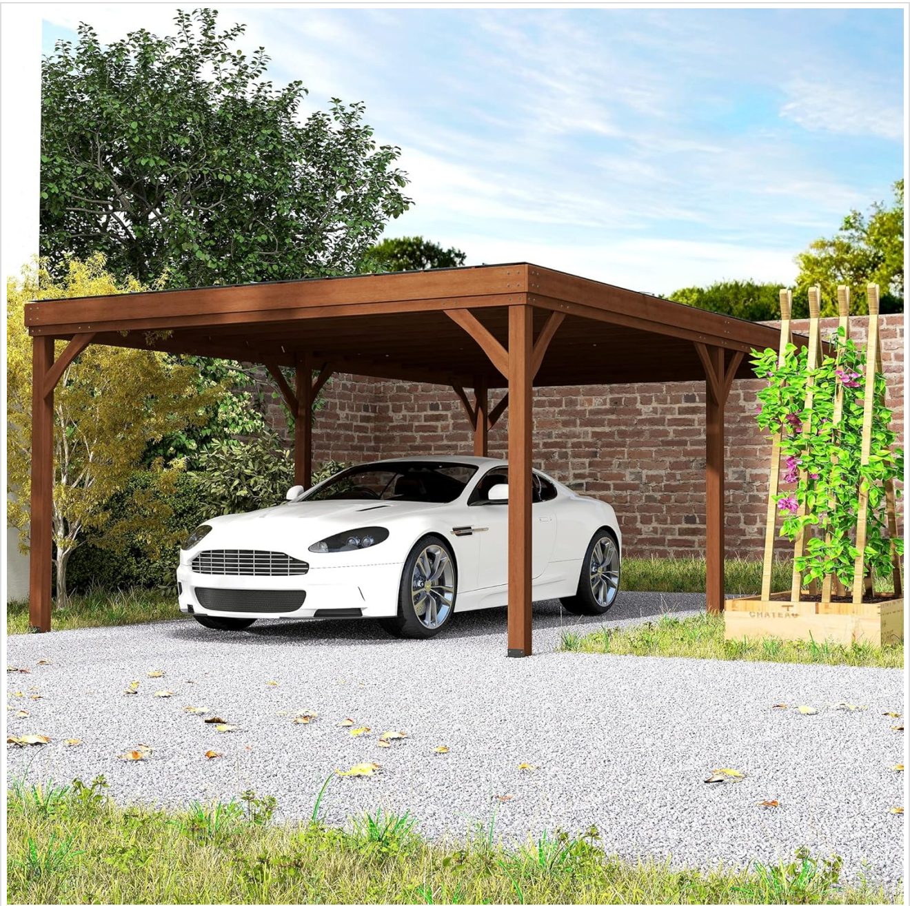
Image: The pergola effectively used as a stylish and functional shelter for a vehicle.