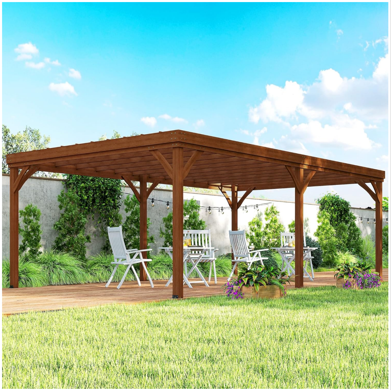
Image: The Outsunny 12' x 20' Outdoor Pergola, showcasing its large size and integration into a patio area with seating.