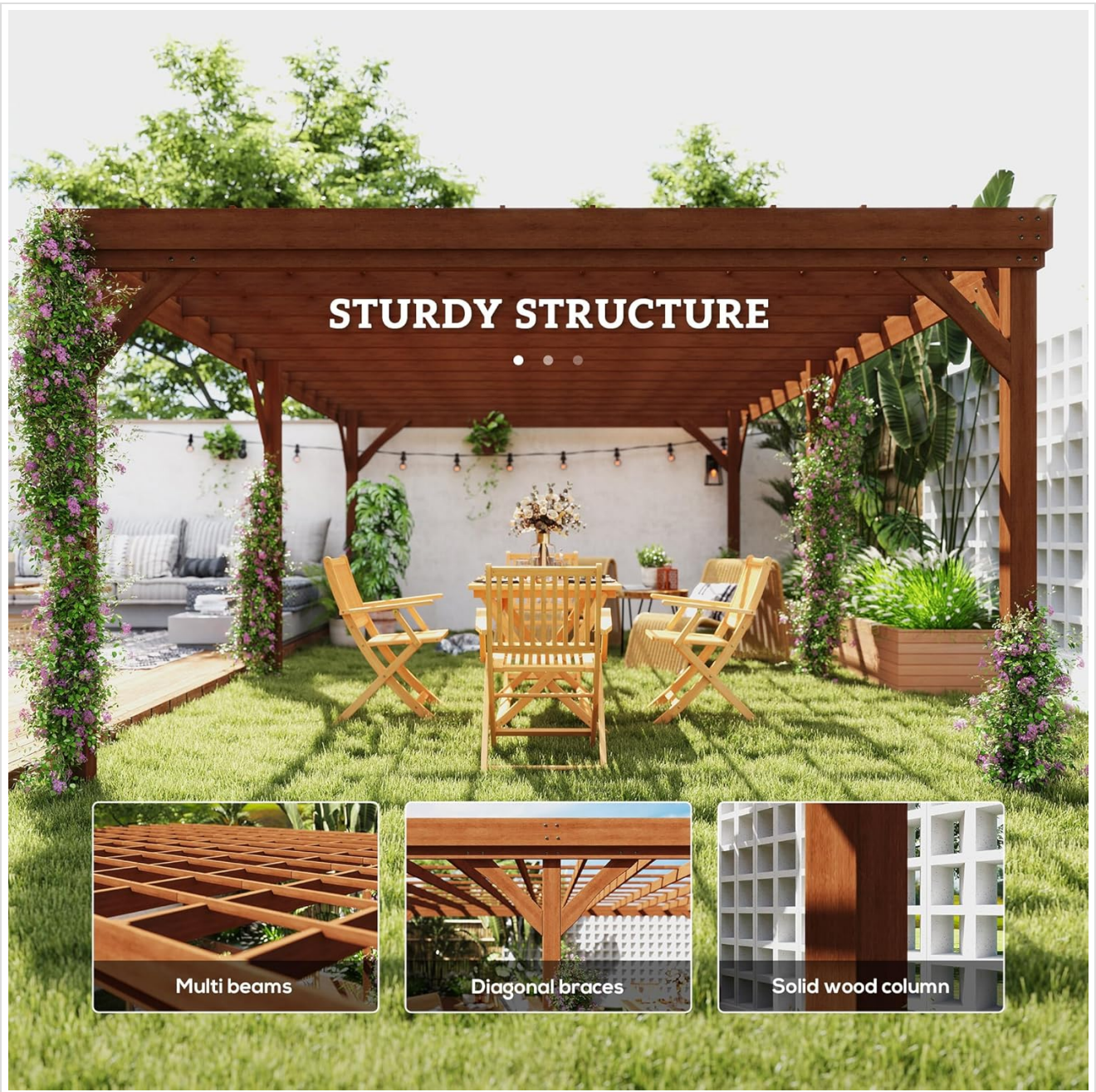
Image: Close-up view highlighting the sturdy construction elements of the pergola, including multi-beams, diagonal braces, and solid wood columns.