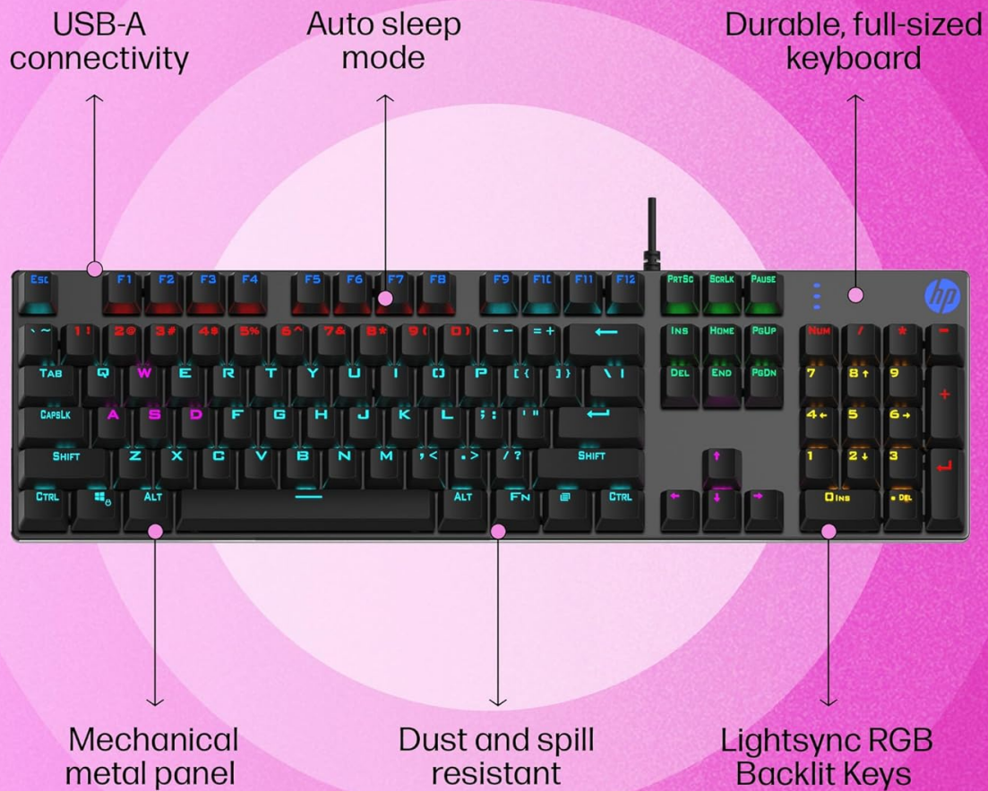
Figure 12: Overview of key features including USB connectivity, auto sleep mode, mechanical metal panel, dust and spill resistance, and Lightsync RGB Backlit Keys