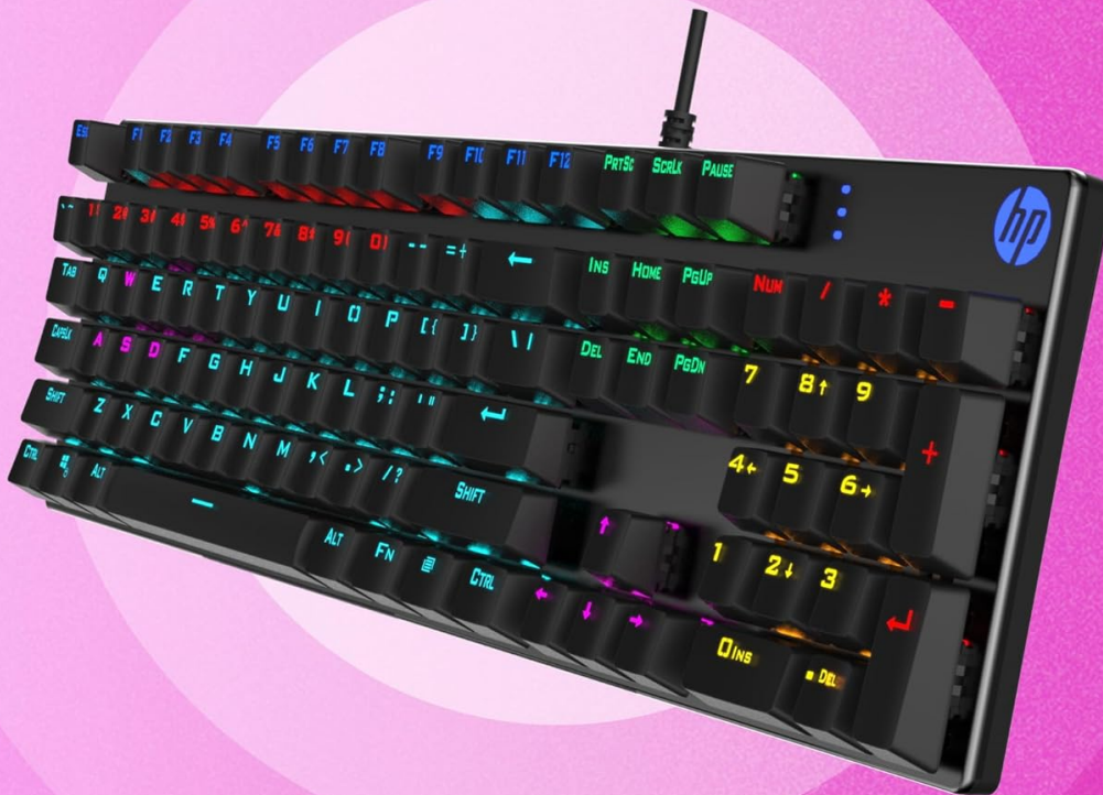
Figure 3: USB plug-and-play setup for the HP GK400F keyboard

Get to typing quicker with USB plug-and-play setup.