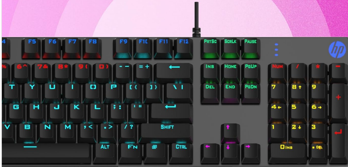
Figure 5: RGB Backlit Keys and Auto Sleep Mode functionality