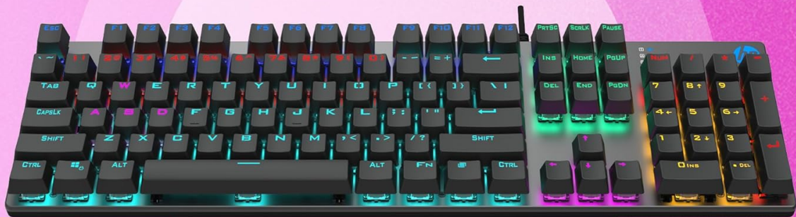
Figure 7: Keyboard compatibility with Windows 10/11

Boost your efficiency on multiple devices with Windows 10/11 compatibility.