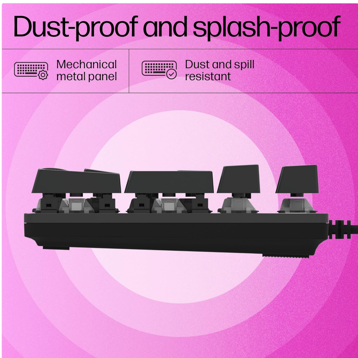
Figure 9: Dust-proof and splash-proof design of the keyboard