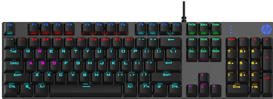
Figure 1: HP GK400F Mechanical Gaming Keyboard

Keys to victory. Keys to comfortable gaming.