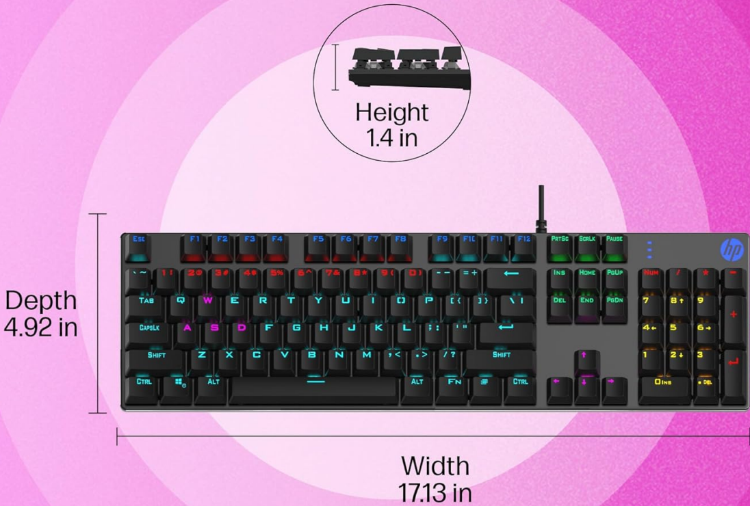
Figure 11: Keyboard dimensions for reference