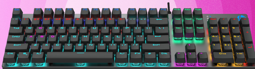
Figure 2: HP GK400F Mechanical Gaming Keyboard highlighting RGB lighting