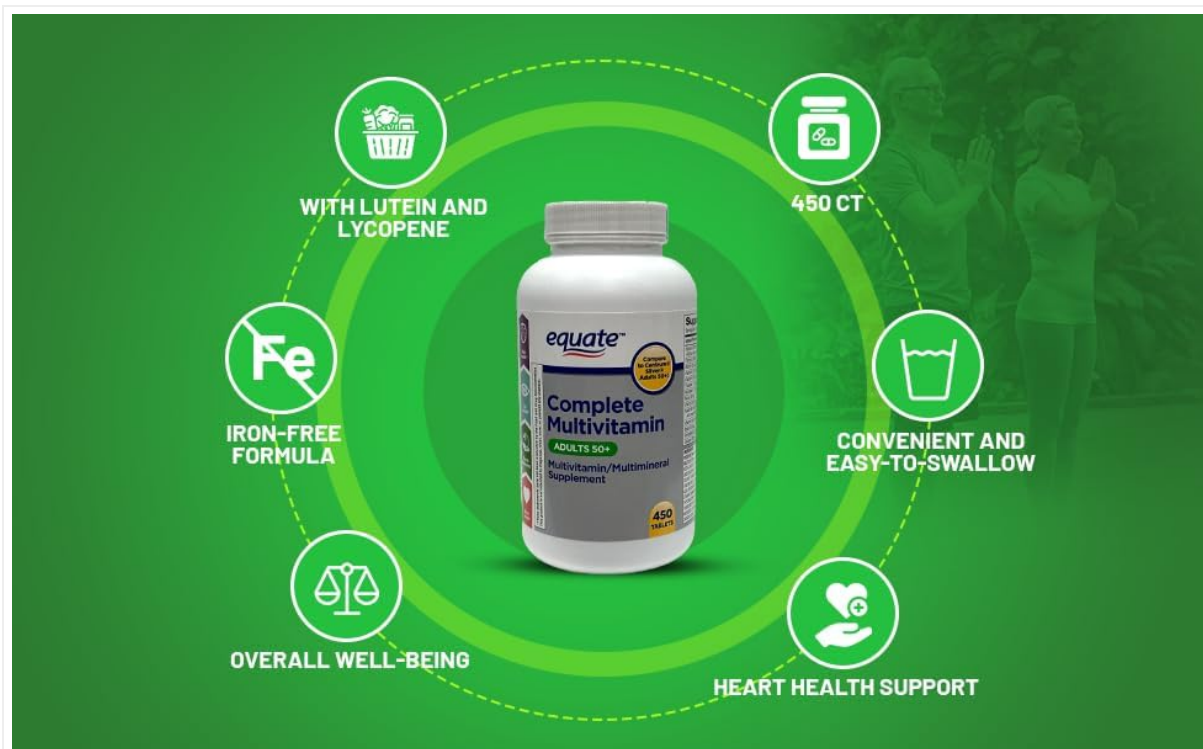
Image: A visual emphasizing the pursuit of optimal health, featuring the multivitamin product.