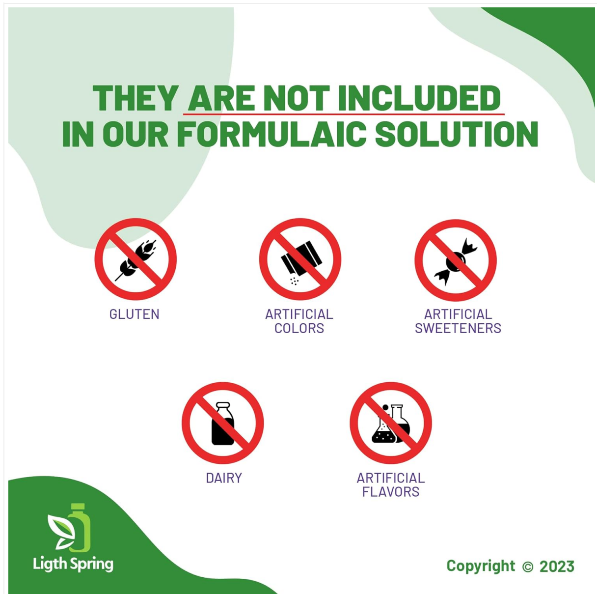
Image: Visual confirmation of ingredients not included in the supplement's formulation.