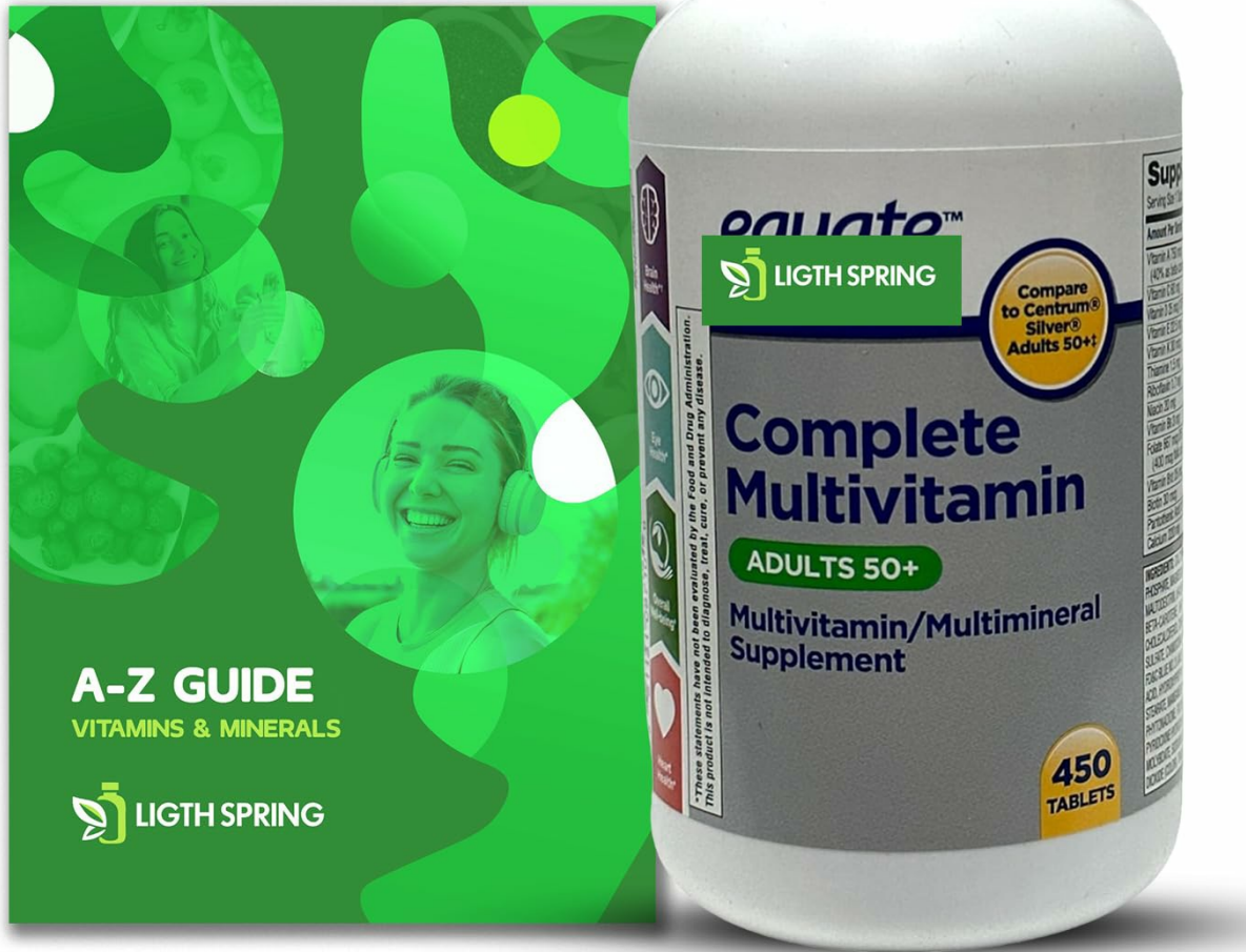
Image: Equate Adults 50+ Complete Multivitamin bottle alongside a supplementary A-Z Vitamins & Minerals guide.