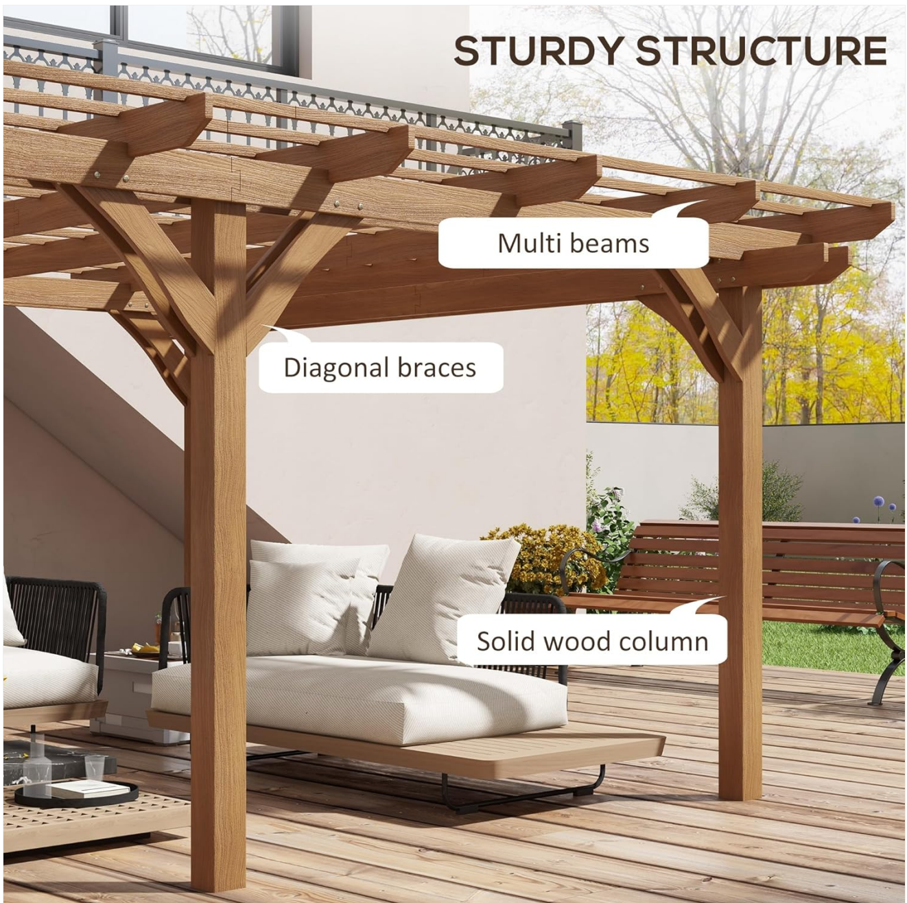
Image: Detail of the sturdy structure with multi beams and diagonal braces.

Your browser does not support the video tag.