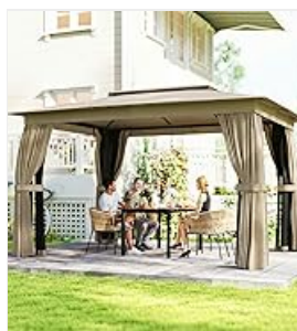
Image: Three-level beams designed for climbing plants.