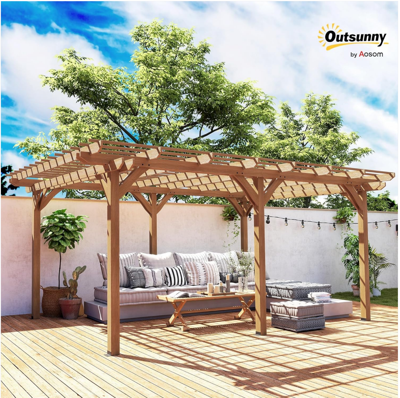
Image: The pergola creating a comfortable outdoor living area.