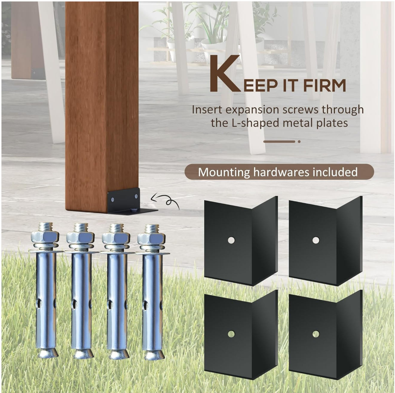
Image: Securely mount posts using L-plates and expansion screws.