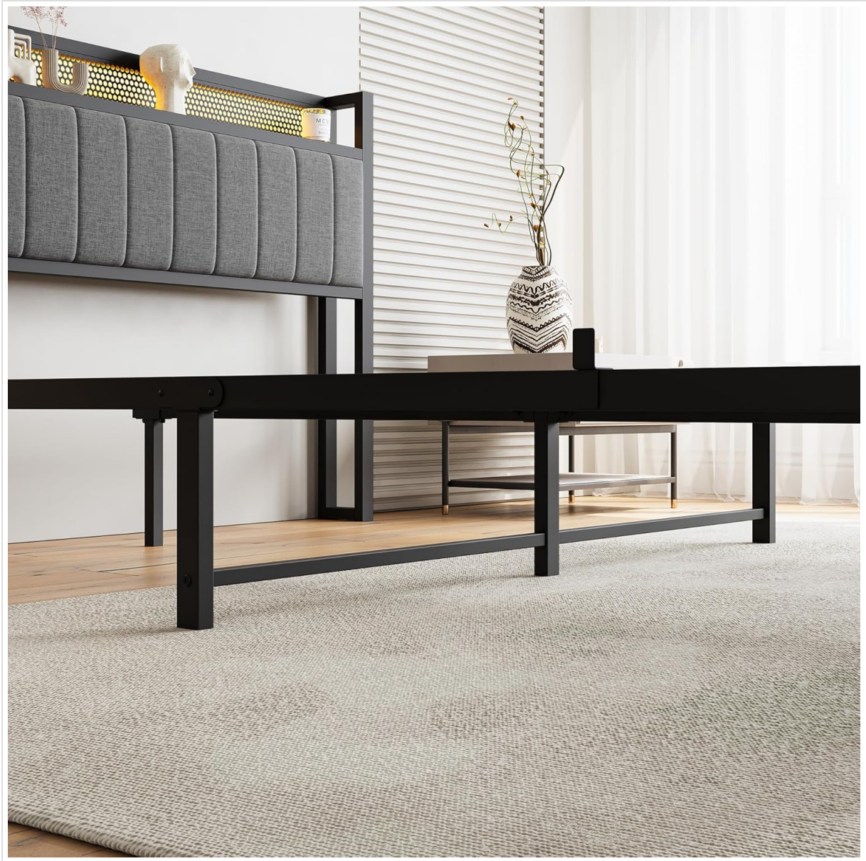
Figure 5: The generous under-bed clearance provides ample storage space and facilitates easy cleaning.