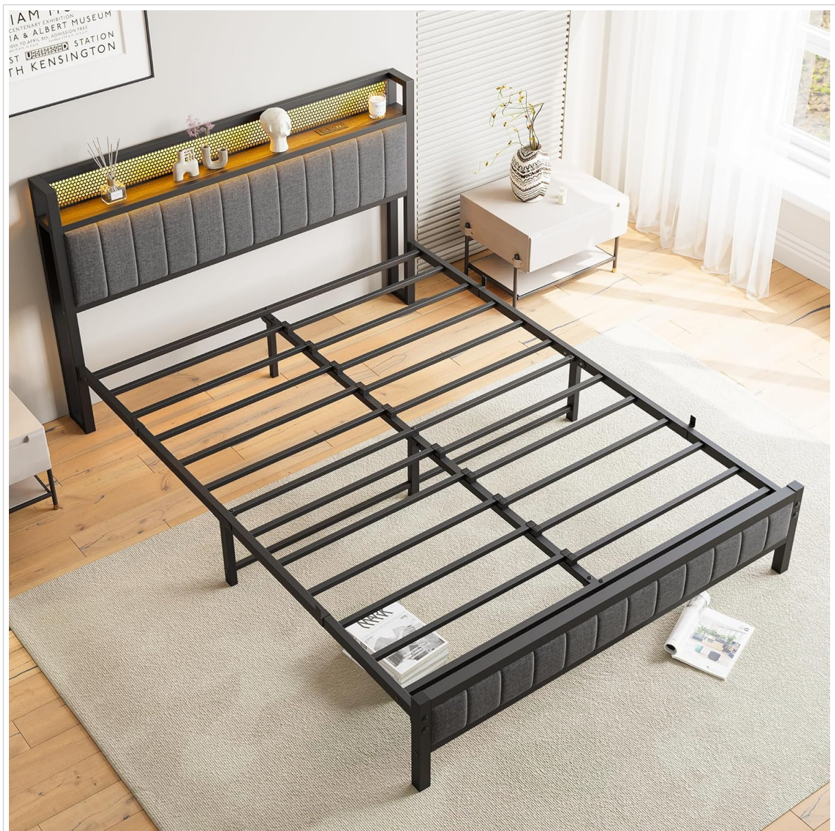
Figure 1: The sturdy metal frame structure, ready for mattress placement.