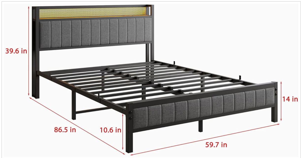
Figure 2: Detailed dimensions of the BOFENG Queen Bed Frame, including headboard height and under-bed clearance.