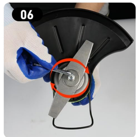
Install Nut and Use the Wrench to Tighten the Nut Clockwise

Image: Visual guide demonstrating the six steps for assembling the weed wacker, from removing the nut to installing the blade and