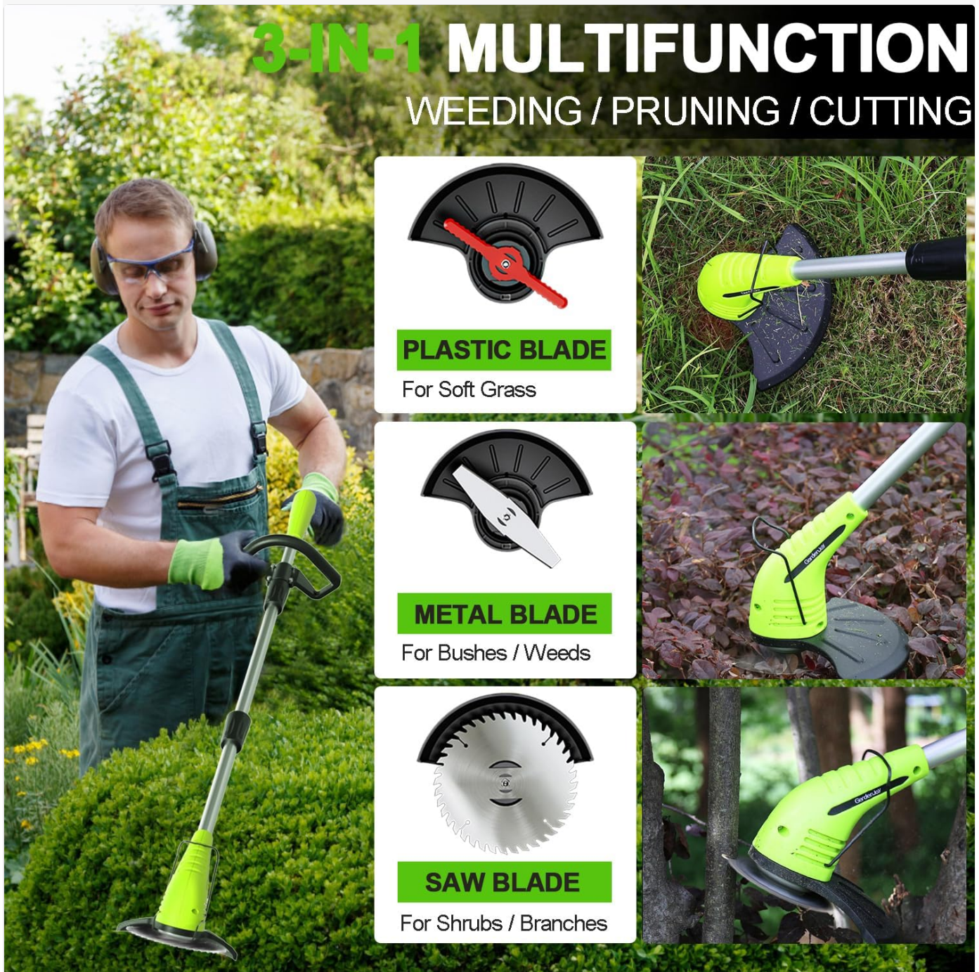
Image: Visual representation of the three types of blades included: plastic blade for soft grass, metal blade for bushes/weeds, and saw blade for shrubs/branches.