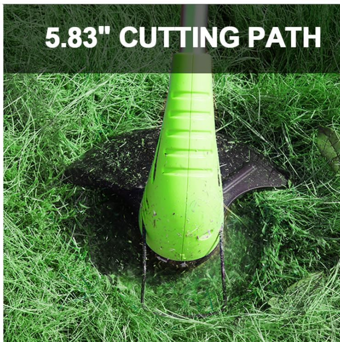
Image: Close-up views highlighting the protection bar, safety switch, adjustable handle, and the 5.83-inch cutting path of the trimmer.