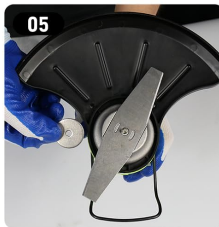
Install the Blade and Round Small Iron Piece