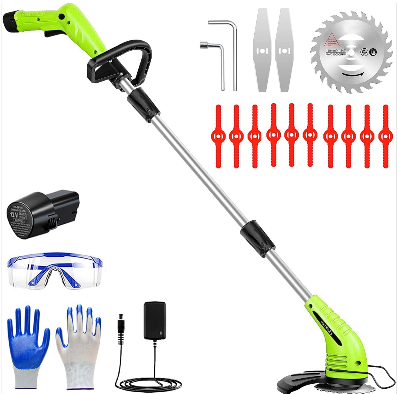
Image: The GardenJoy 12V Cordless Grass Trimmer, showing the main unit, battery, charger, safety glasses, gloves, and various cutting blades (plastic, metal, circular saw).