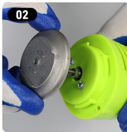
Remove the Metal Base