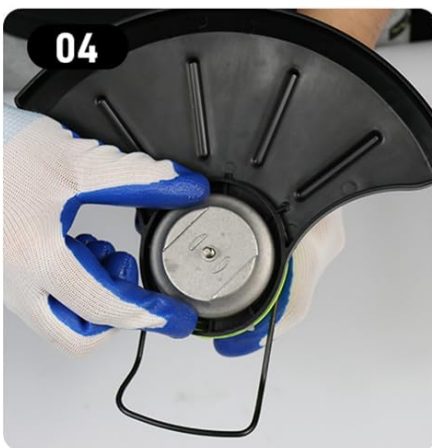
Install the Metal Base