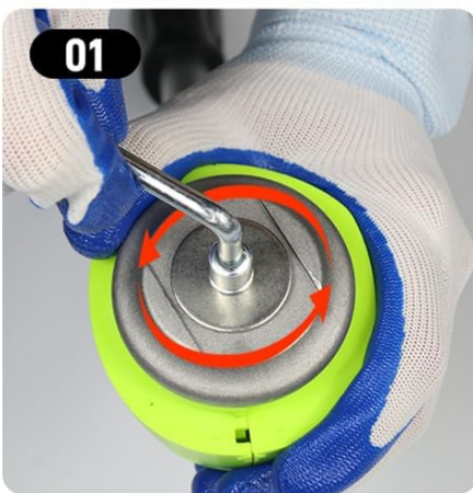
Use the Wrench to Remove Nut and Blade Counterclockwise