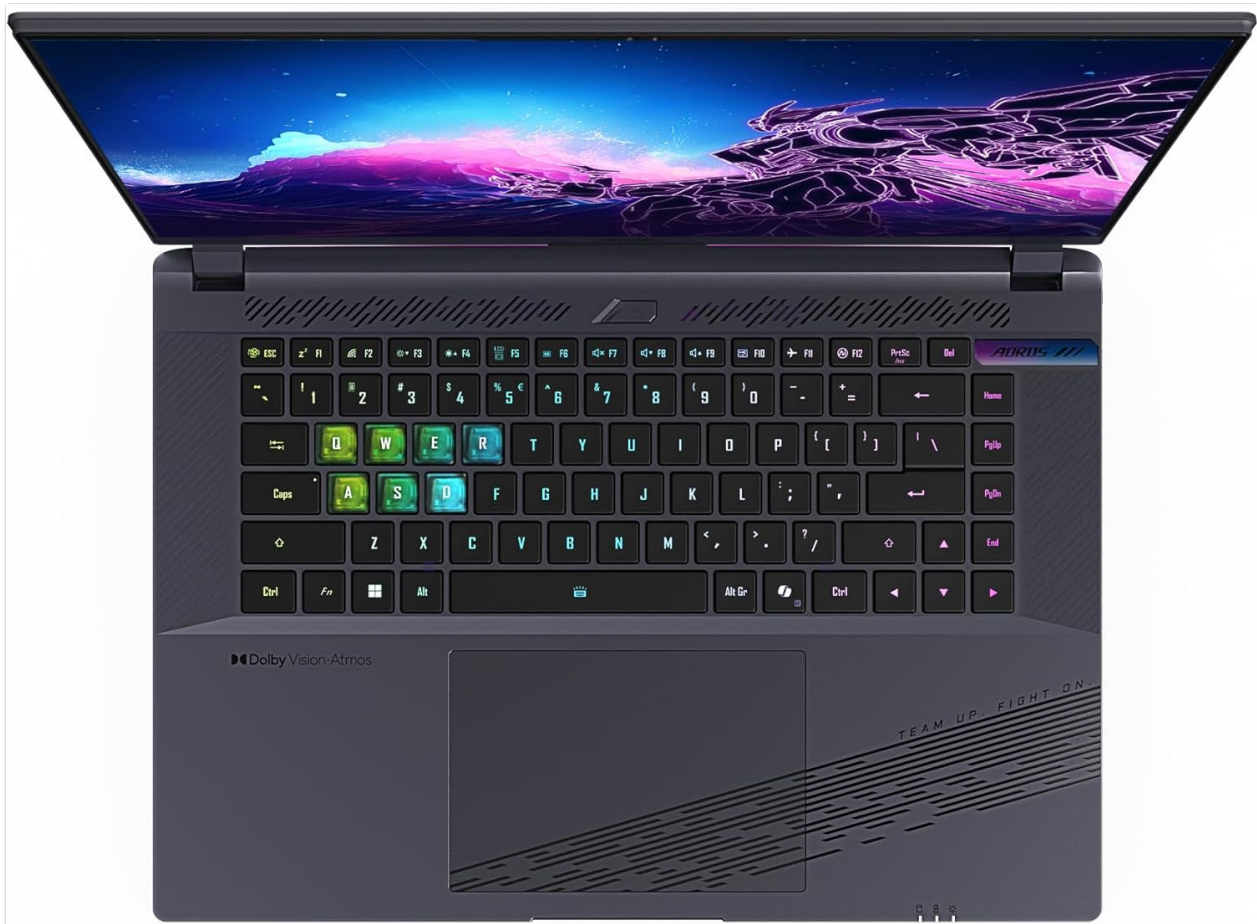
Figure 2.2: Top-down view of the laptop, showcasing the keyboard with per-key RGB backlighting and the touchpad.