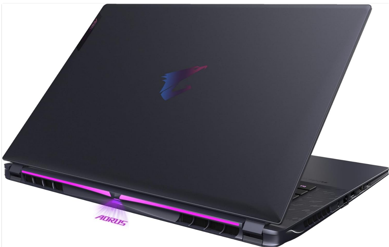
Figure 2.3: Rear view of the laptop, showing the exhaust vents and customizable RGB lighting strip.