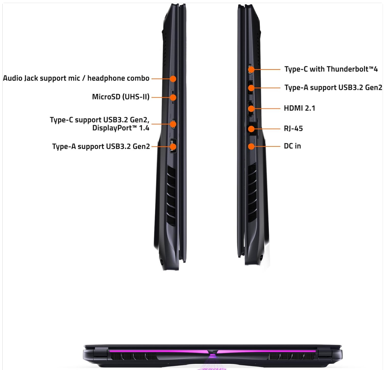
Figure 2.1: Side view of the laptop highlighting various ports and connectors.