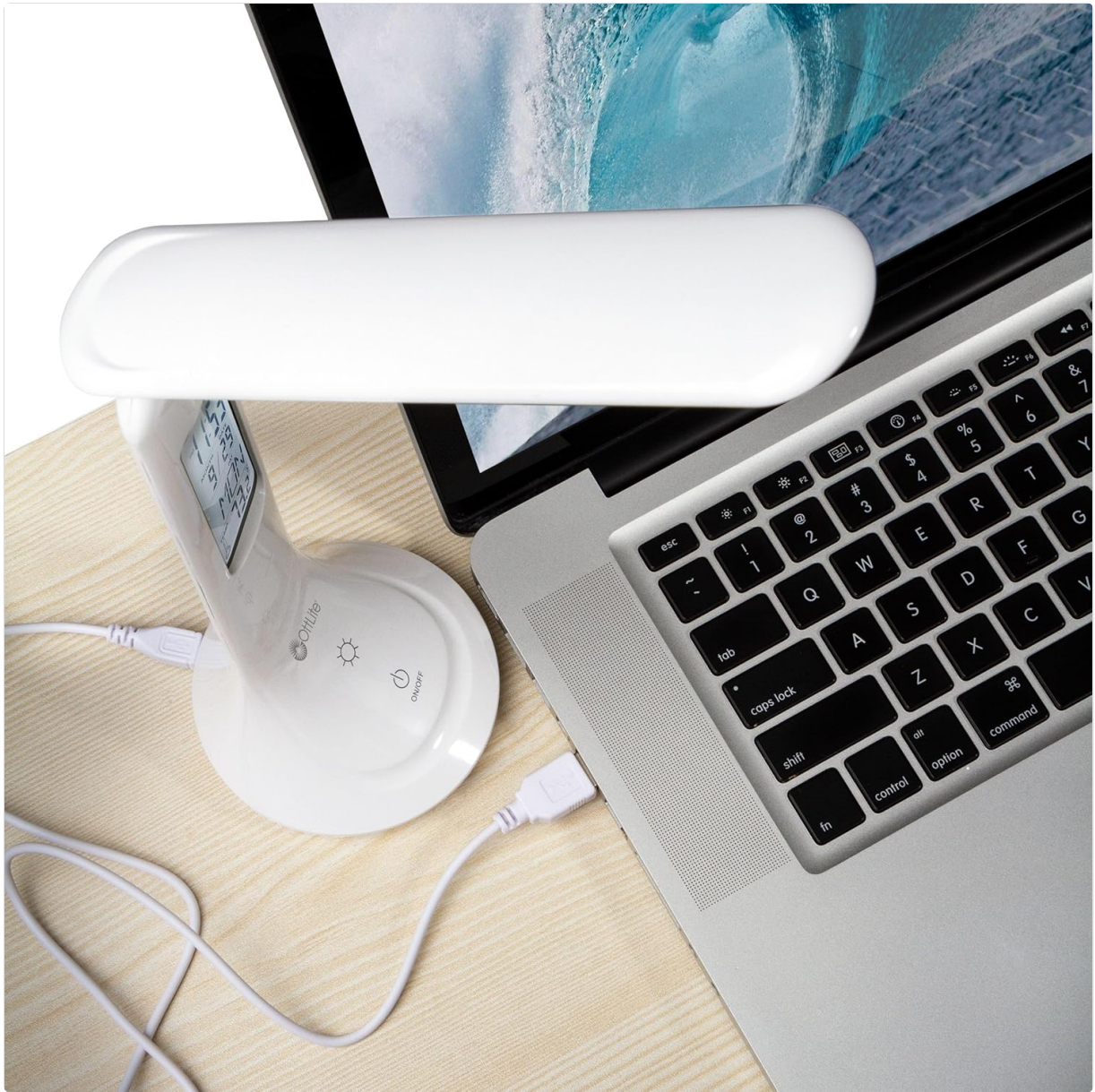
The digital display provides useful information at a glance.