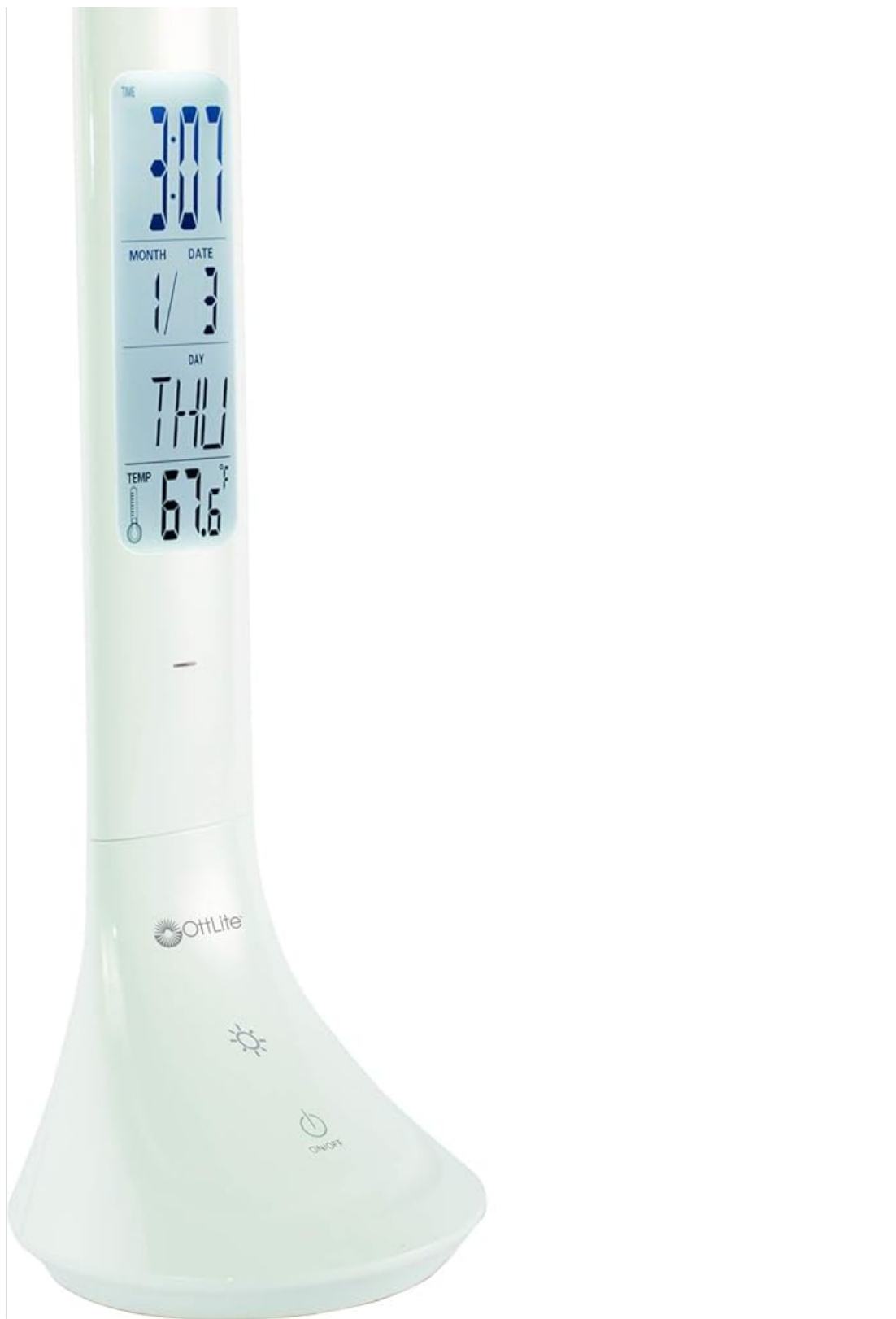
Overview of the lamp's main features and controls.