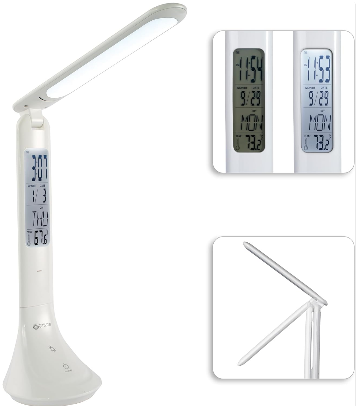
The OttLite ClearSun LED Travel Task Lamp, showcasing its compact design and digital display.