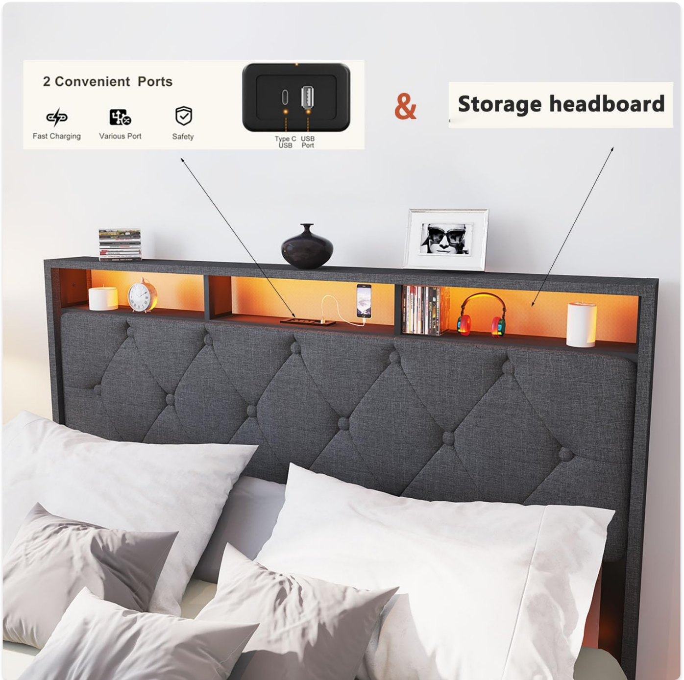
Figure 3: Headboard with integrated charging station and storage.