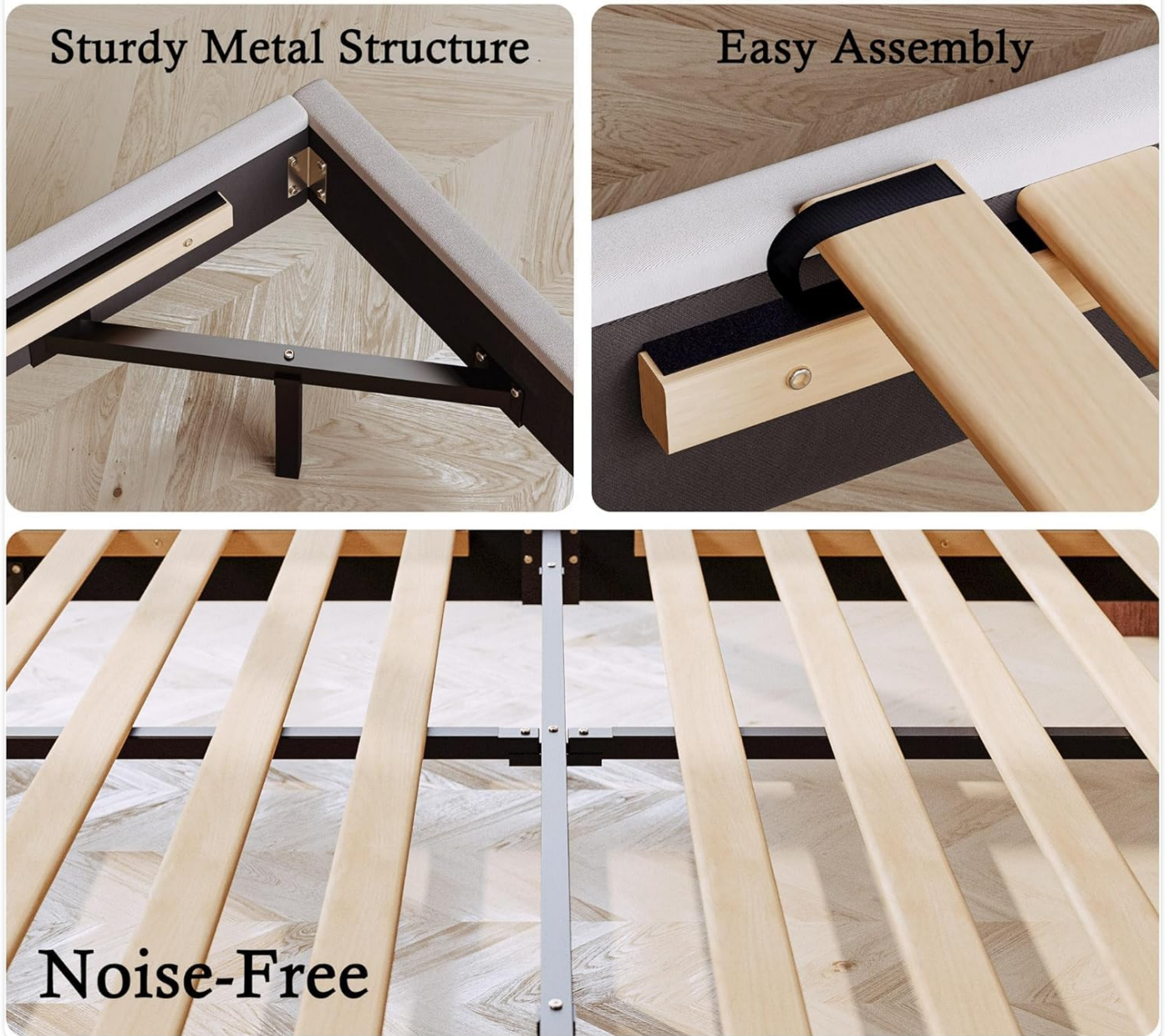
Figure 5: Detailed view of the bed frame's construction features.