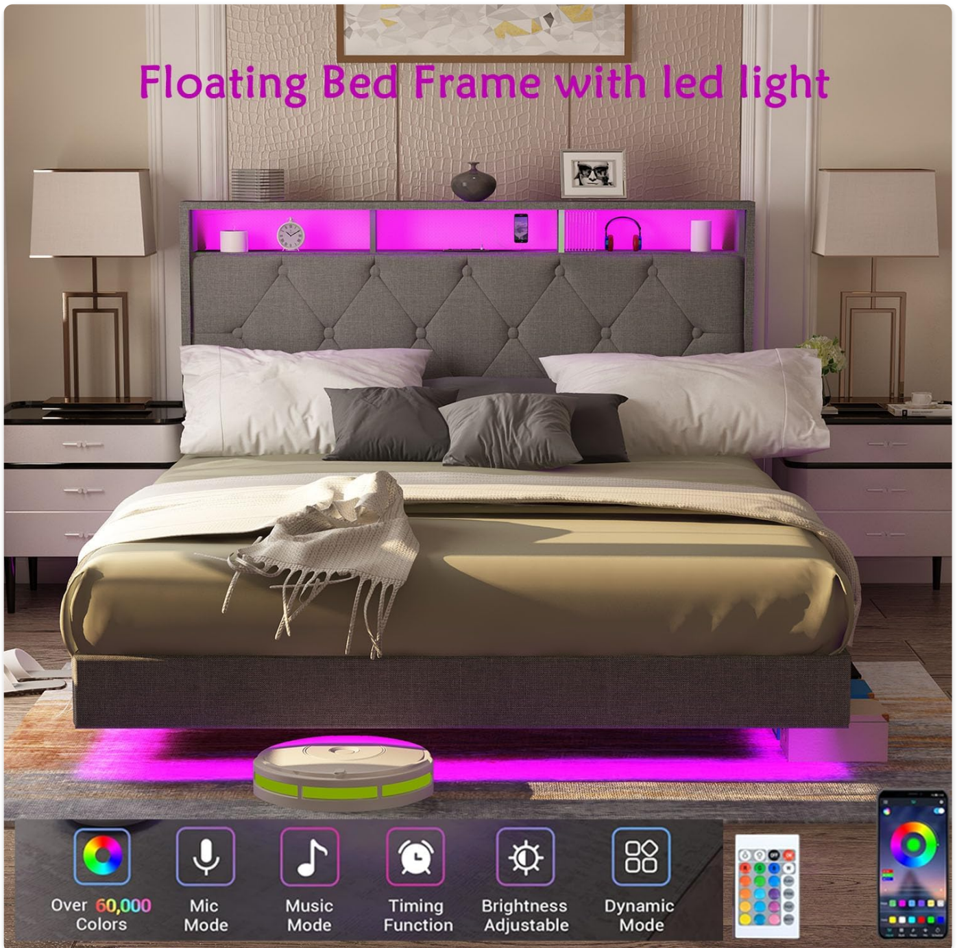
Figure 2: Integrated LED lighting on headboard and under-bed.