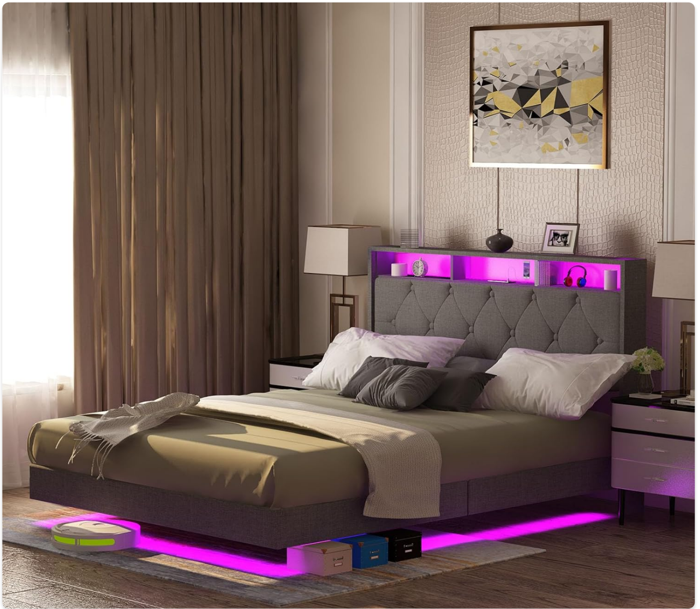
Figure 1: Muluflower Floating Bed Frame, King Size, Grey Linen.