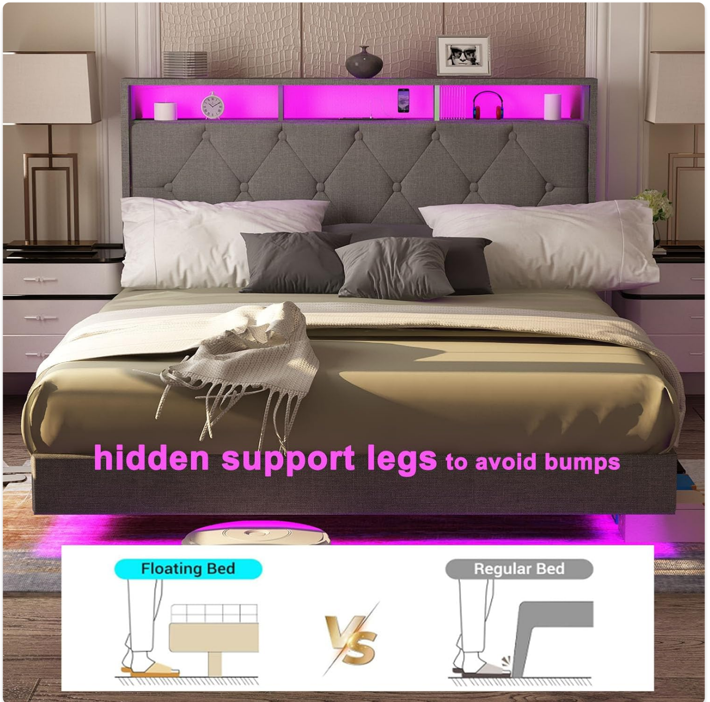
Figure 4: Illustration of the floating bed design with hidden support legs.