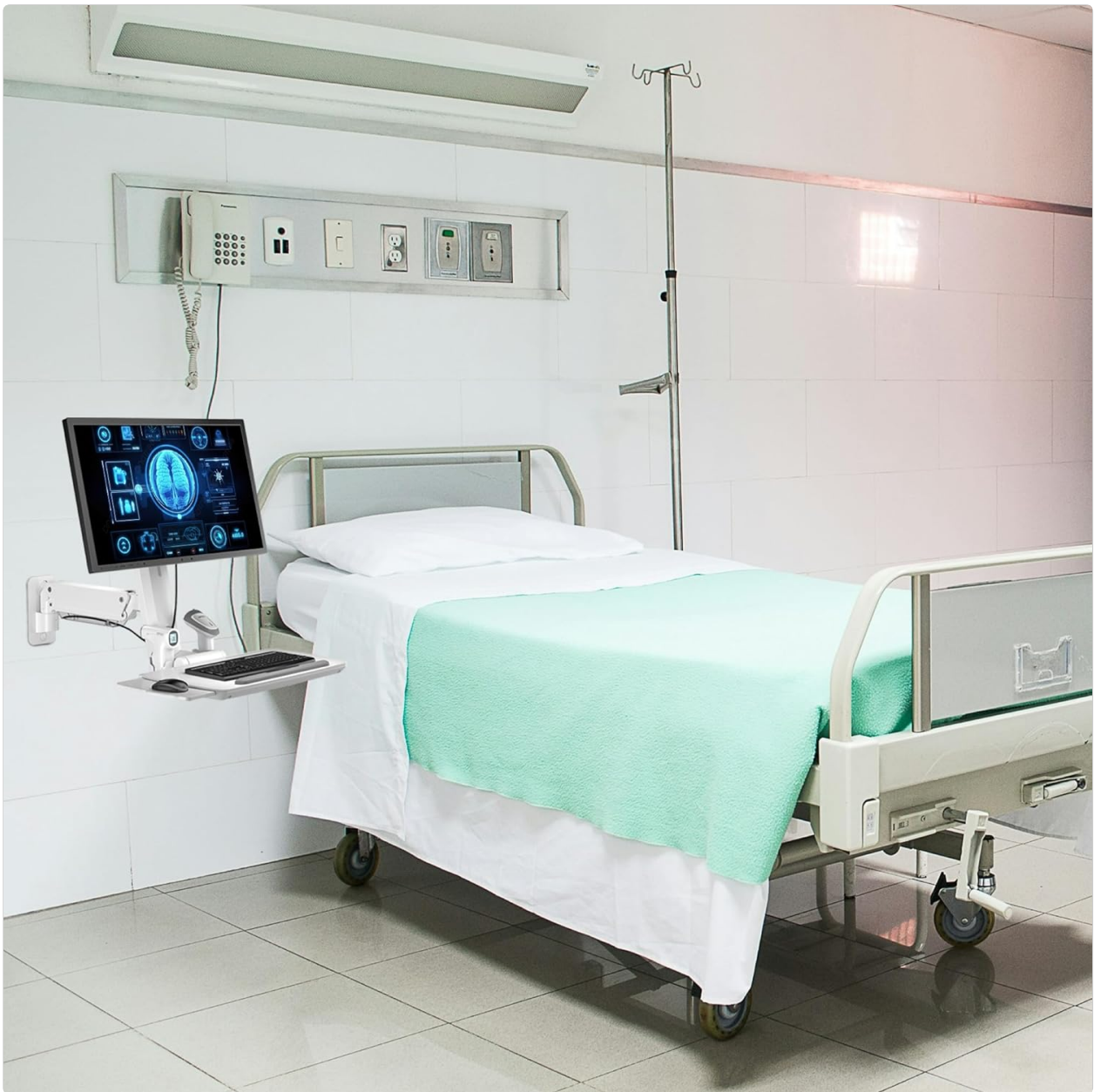
Image: The Mount Plus MED02 workstation mounted on a wall in a hospital room, providing a compact and accessible computer setup next to a patient bed.

Key features include a large integrated sliding mouse pad for ample movement, a foldable keyboard tray for adjustable height and comfortable typing, and a gas spring monitor arm that allows for easy height adjustment, rotation, tilt, and swivel. Constructed from medical-grade materials, the workstation is designed for hygiene and durability, resisting stains and scratches. Convenient scanner access is provided on both sides to enhance serviceability and efficiency.