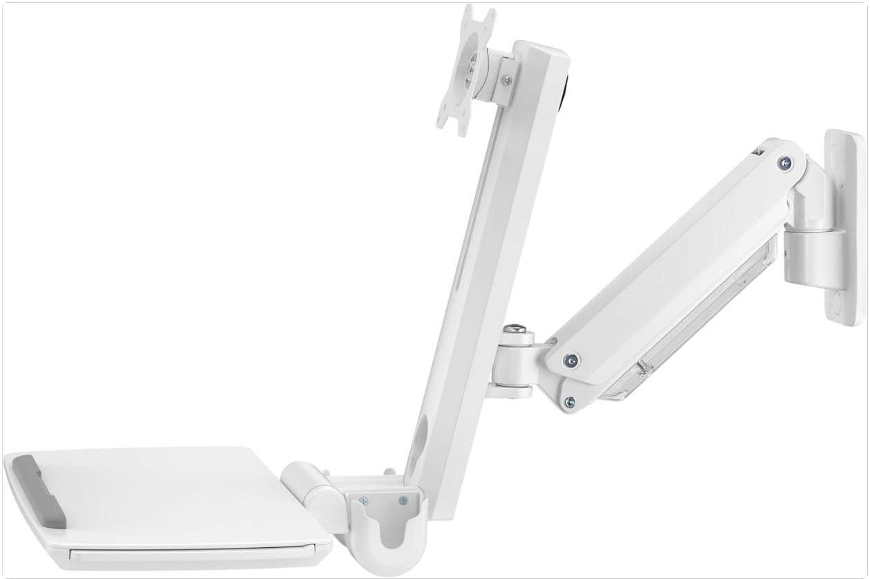
Image: The workstation shown fully extended, demonstrating the monitor, keyboard tray, and mouse pad in an active use configuration.