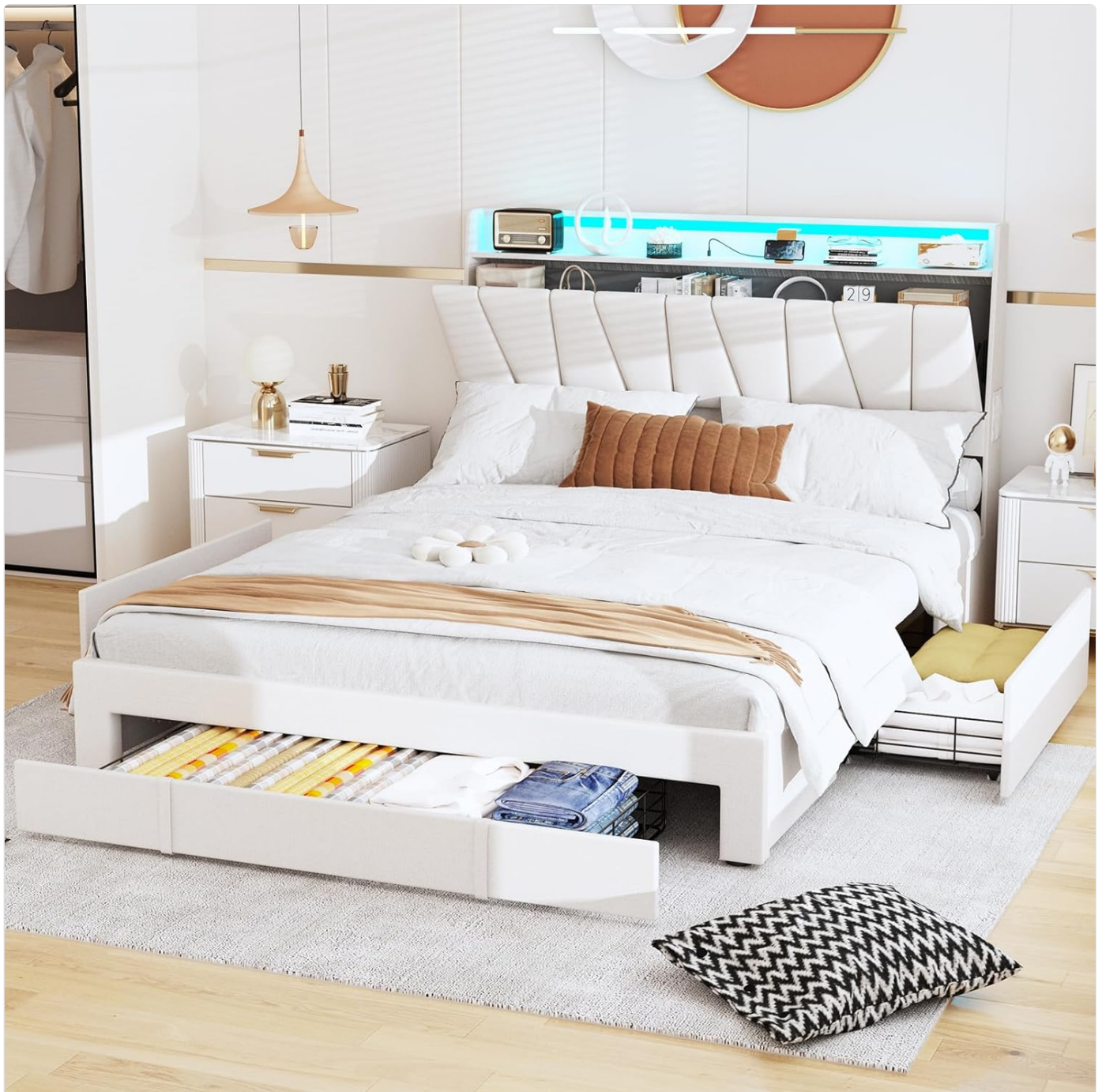
Figure 4: Fully Assembled Bed Frame. This image presents the complete Fameill Queen Size Bed Frame, highlighting its elegant design, functional storage headboard with LED lighting, and the integrated drawers.