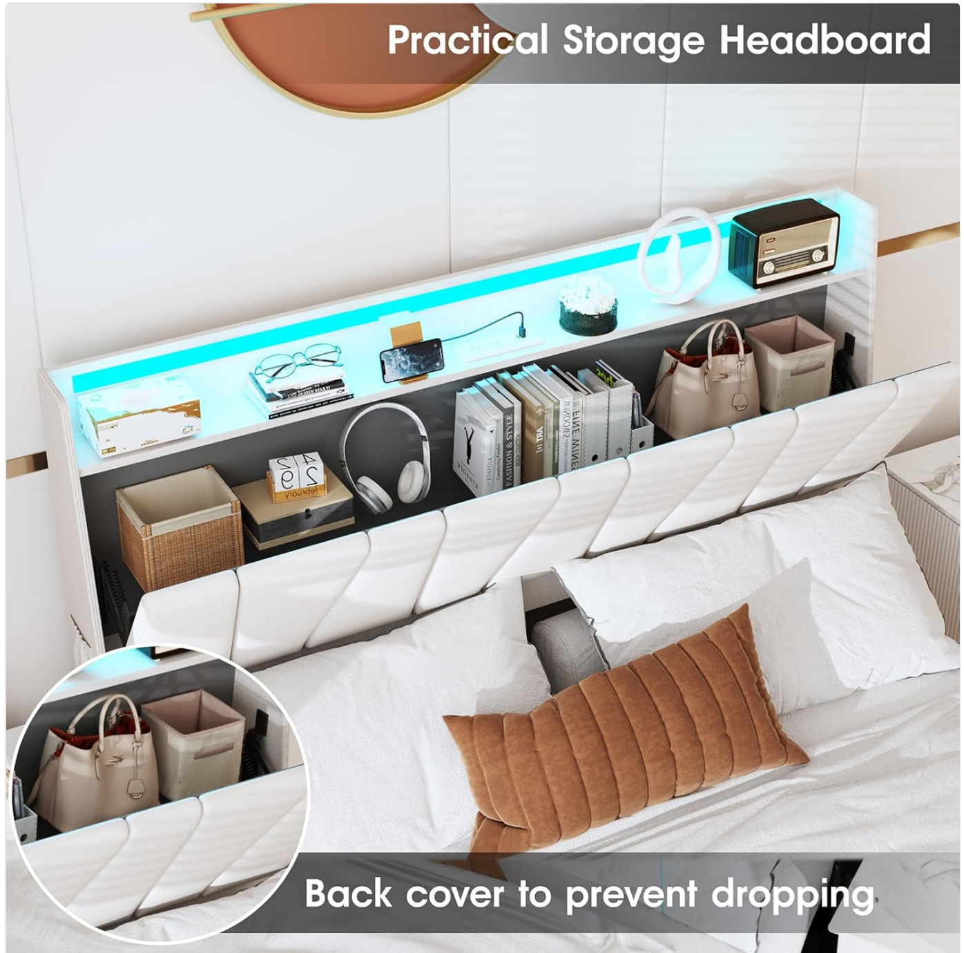
Figure 2: Practical Storage Headboard. This image details the headboard's practical storage features, including open shelves for display and a hidden compartment accessible by lifting the upholstered front panel. It also shows the back cover designed to prevent items from dropping.

Once the headboard frame is stable, attach the upholstered panels. Use screws A, B, C, D, N, and M as indicated in the instructions. These panels form the aesthetic and functional front of the headboard, including the access to the hidden storage.