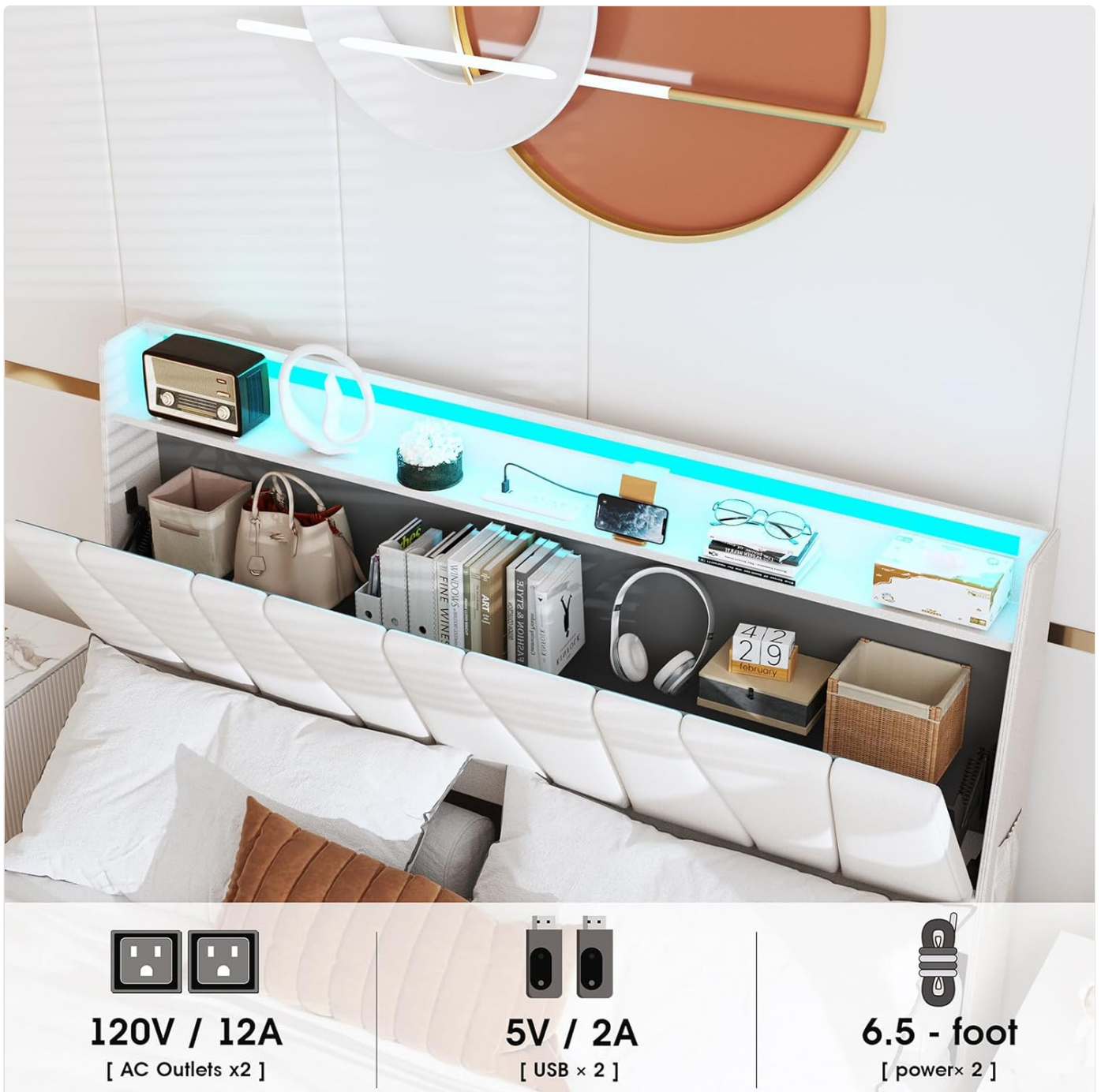
Figure 6: Headboard Charging Station. This image provides a detailed view of the integrated charging station on the headboard, featuring two standard AC outlets, two USB ports (including a Type-C port), and the length of the power cord.