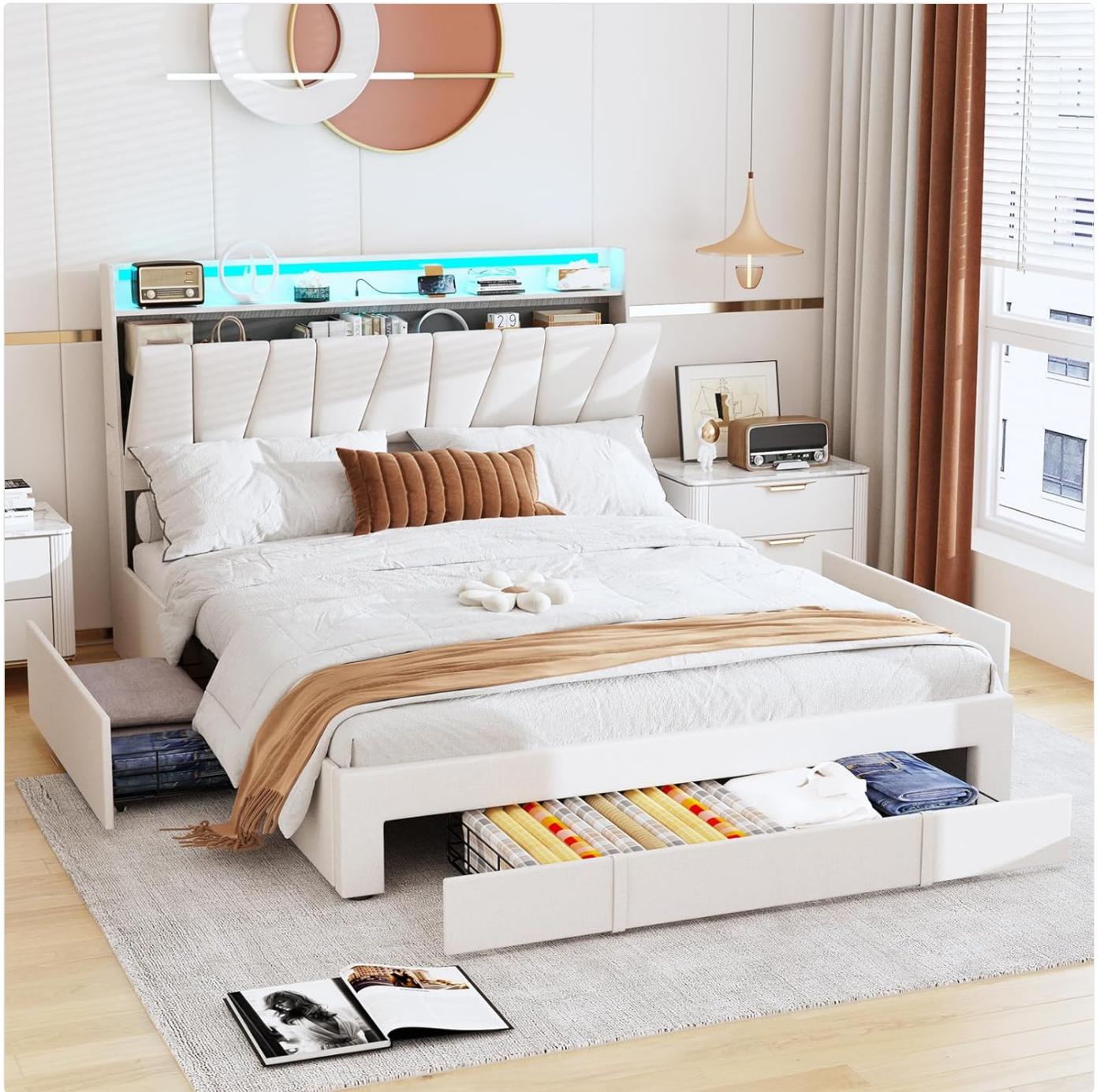
Figure 3: Three Room-Saving Storage Drawers. This image showcases the bed's three spacious storage drawers, two of which are pulled out to demonstrate their capacity for storing various items like bedding and clothing. The drawers are designed to slide easily on wheels.

and O. Ensure the wheels are securely fastened for smooth operation.