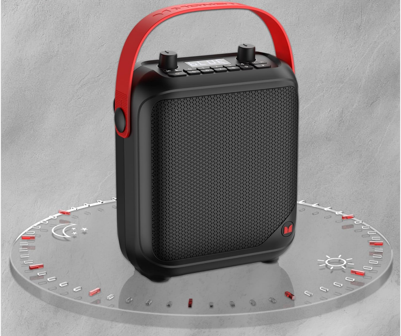
Image: Visual representation of the speaker's 12-hour battery life.

The Monster MFS 1 speaker is equipped with a high-capacity lithium-ion battery, providing up to 12 hours of continuous playback on a single charge. To charge, connect the speaker to a USB power source using the provided USB-C cable. The charging time may vary depending on the power source.