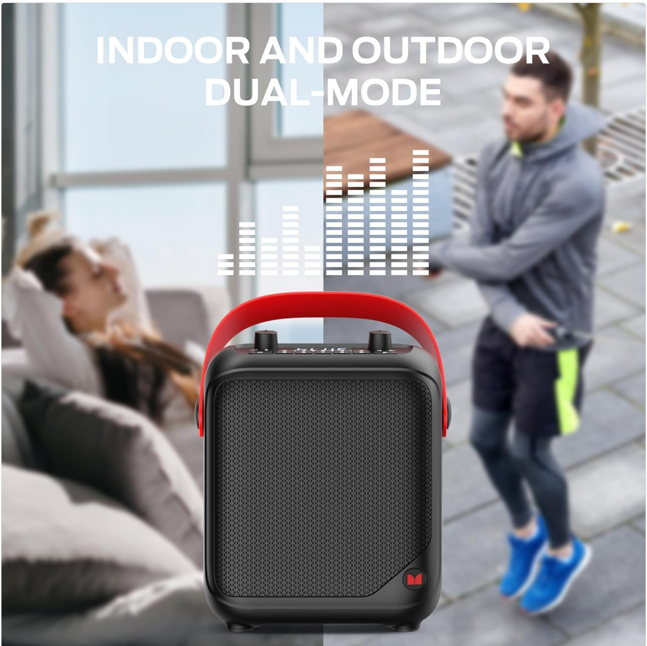
Image: Speaker shown with detachable handle and shoulder strap for portability.

The speaker features a removable silicone handle and an adjustable shoulder strap for convenient carrying. Attach the strap to the designated loops on the speaker for hands-free transport.