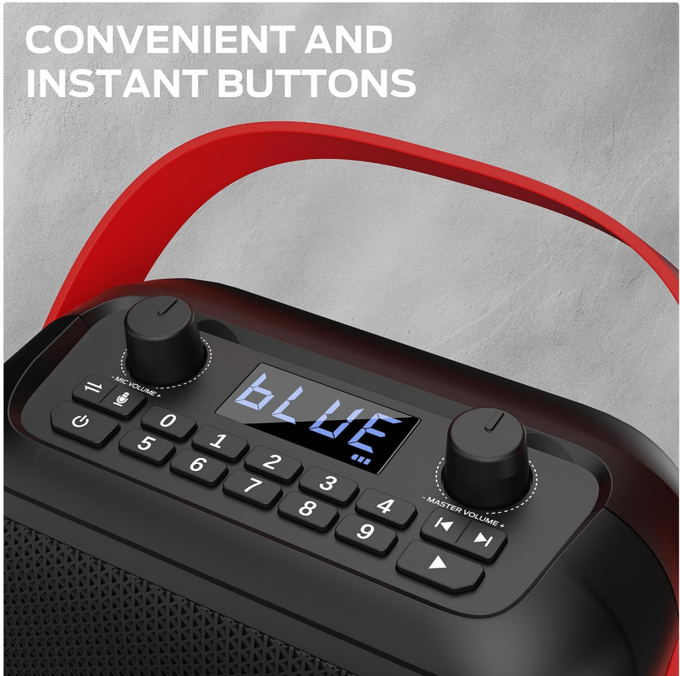
Image: Top panel with power button, mode selection, track controls, and volume knobs.

Familiarize yourself with the speaker's components and controls.