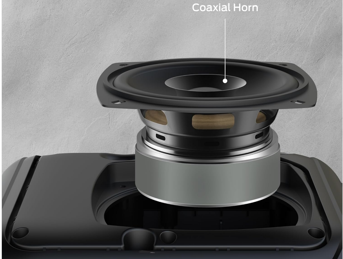
Image: Internal view highlighting the coaxial horn for clear sound.