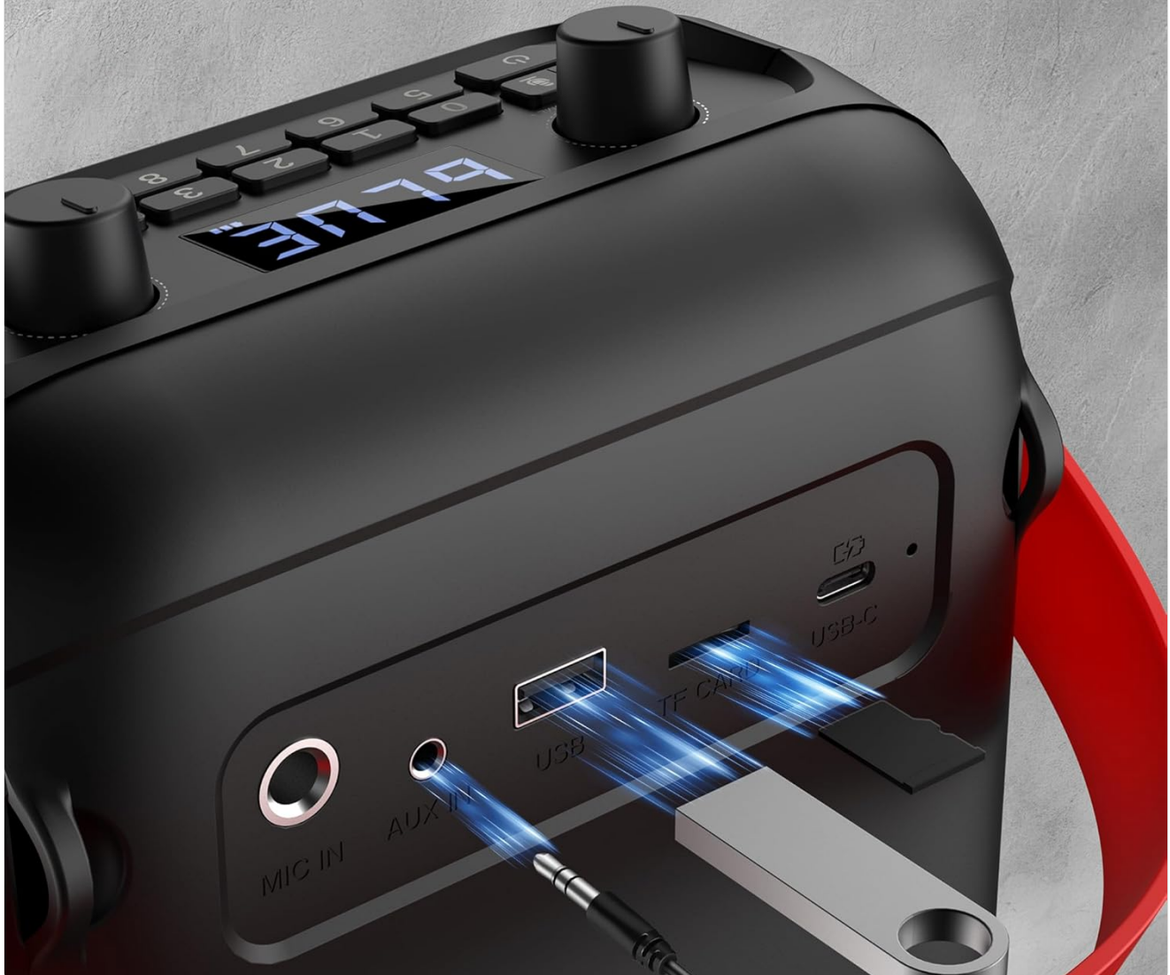
Image: Side panel with Mic In, AUX In, USB, TF Card, and USB-C charging ports.

The side panel provides multiple connectivity options including a microphone input, AUX input, USB port for flash drives, TF card slot for memory cards, and a USB-C port for charging.