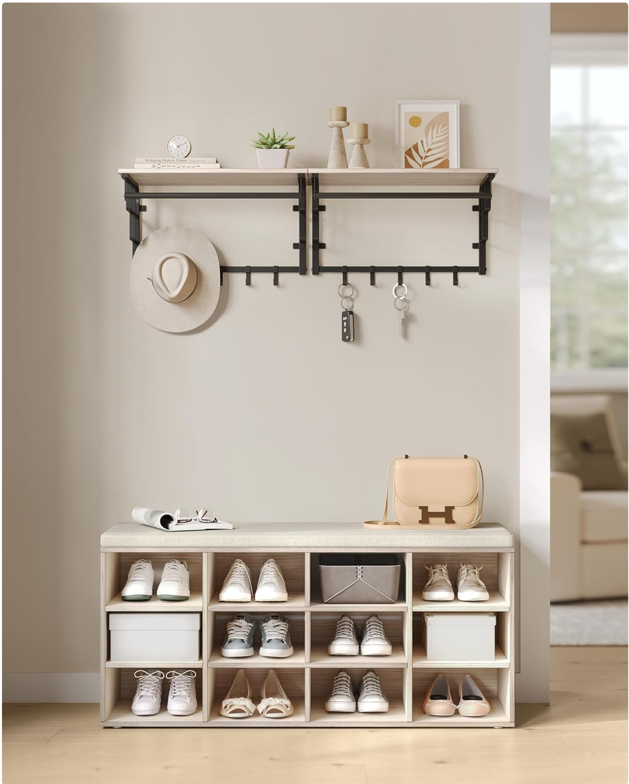
Image: The shoe bench integrated into a hallway, demonstrating its use alongside a coat rack for a complete entryway organization solution.