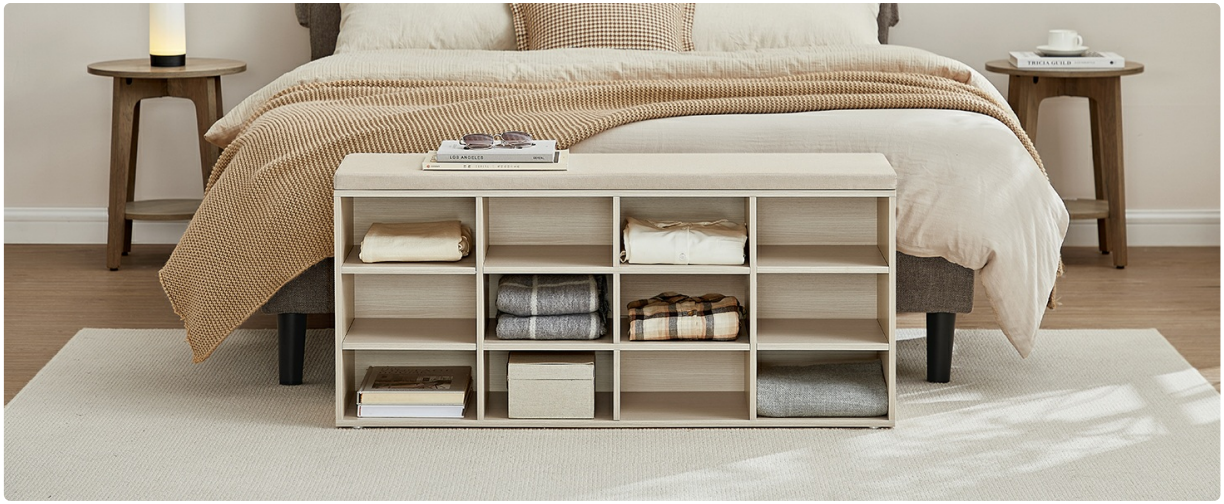
Image: An alternative use case showing the shoe bench placed at the foot of a bed, serving as storage for blankets, books, and other bedroom items.