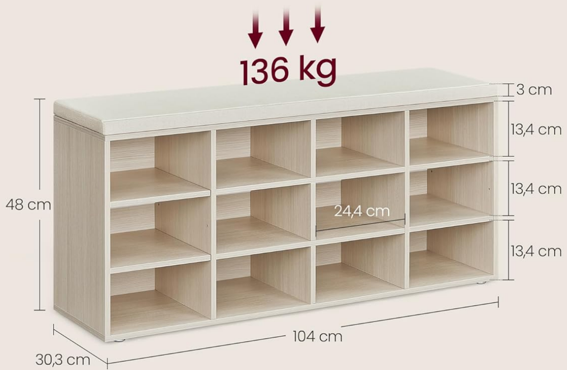
Image: A detailed diagram providing all key dimensions of the shoe bench, including overall length, depth, height, and the internal measurements of the compartments, along with the maximum weight capacity of 136 kg.