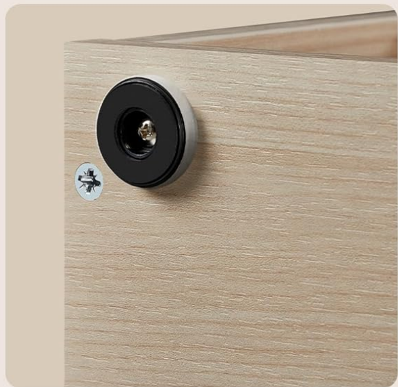
Image: A close-up illustrating the 1.2 cm thick panels for structural integrity and a protective foot pad designed to prevent floor damage.