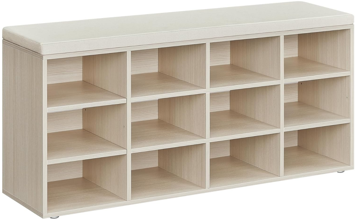
Image: The fully assembled VASAGLE shoe bench, showcasing its 12 compartments and comfortable beige cushion top. Dimensions are approximately 104 cm wide, 30.3 cm deep, and 48 cm high.