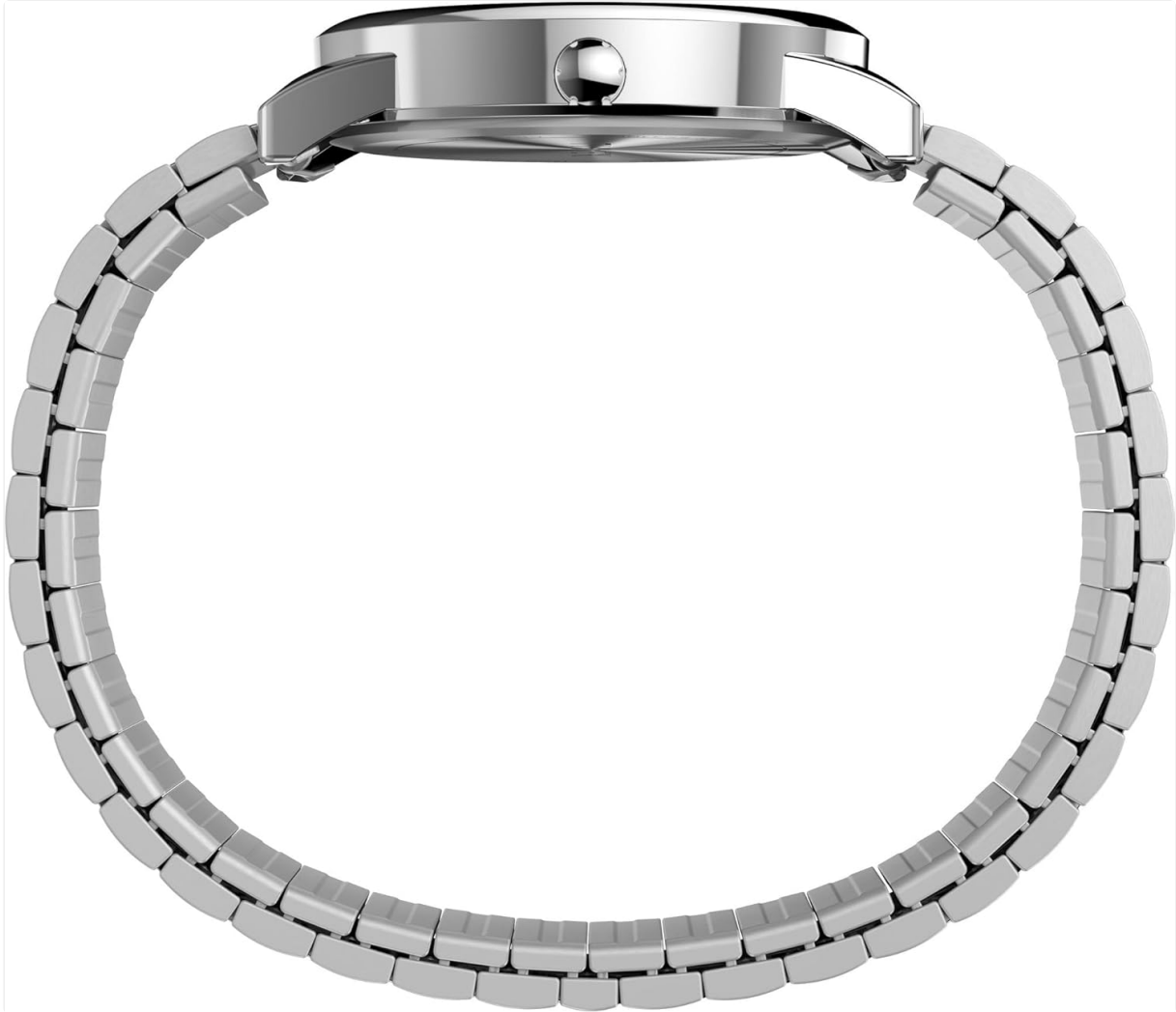
Side view of the watch, highlighting the crown for time adjustment and the design of the expansion band.

The watch features an expansion band designed for comfort. If adjustment is needed, it typically involves removing or adding links. This procedure often requires specialized tools and is best performed by a qualified jeweler or watch technician to avoid damage.