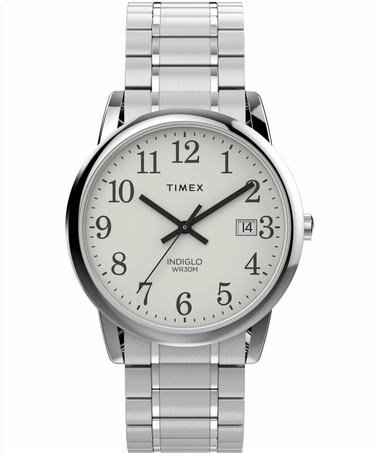
Front view of the Timex Men's Easy Reader 35mm watch, featuring a white dial, clear numerals, and a silver-tone expansion band.