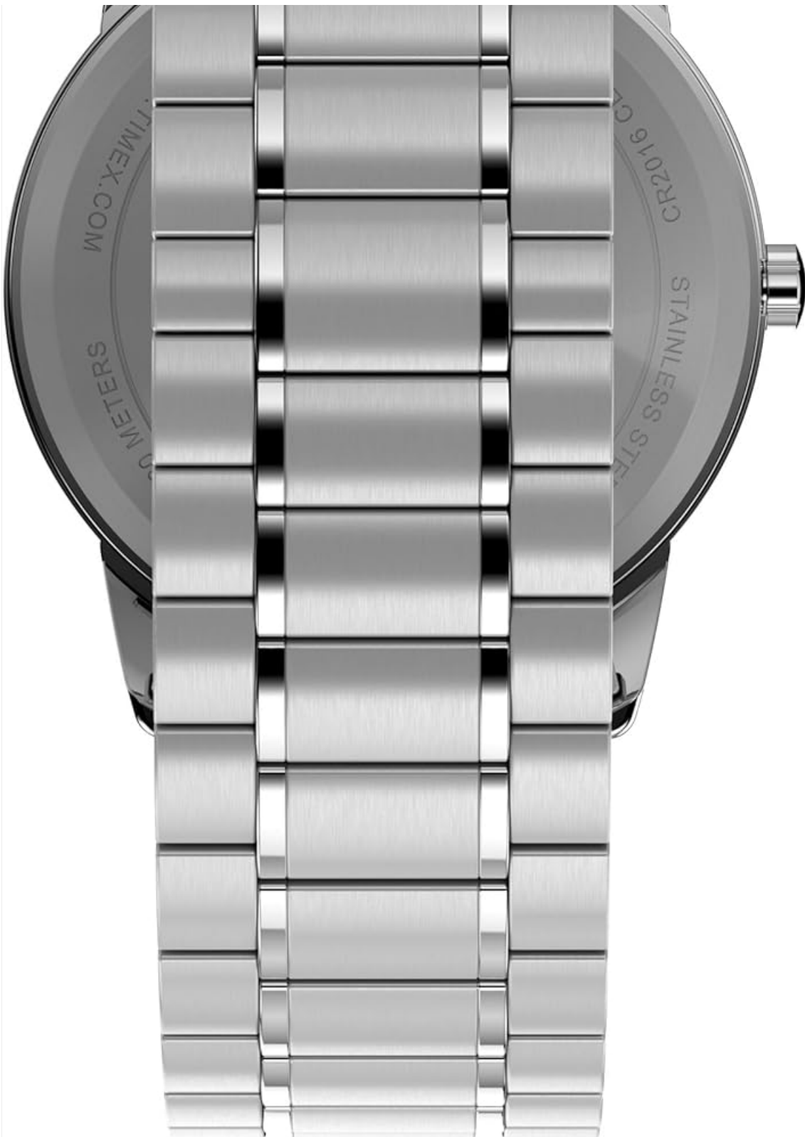
The watch's stainless steel back, indicating its water resistance rating.