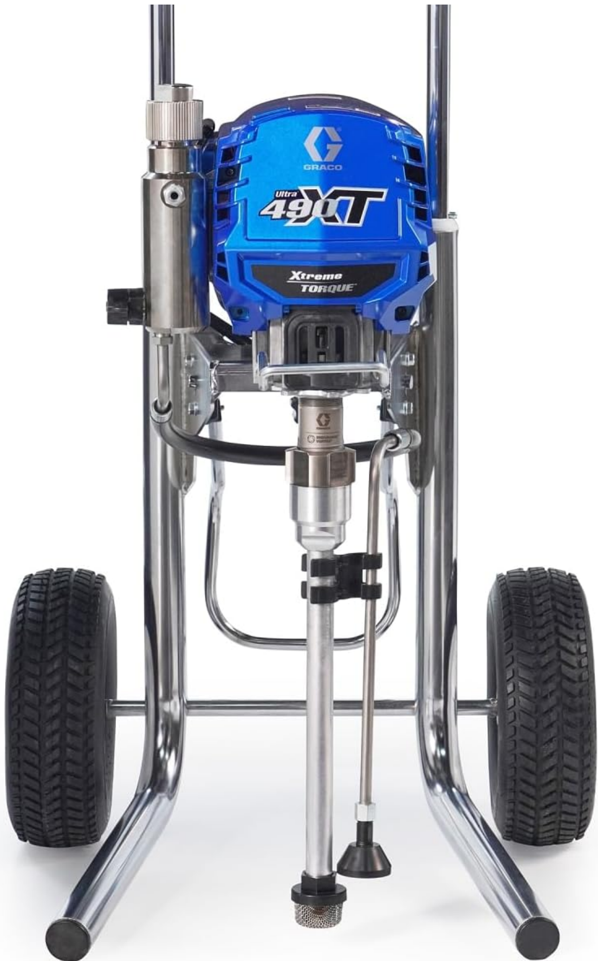
Figure 2: Front view of the Graco Ultra XT 490 Hi-Boy sprayer, illustrating the main unit and cart assembly.