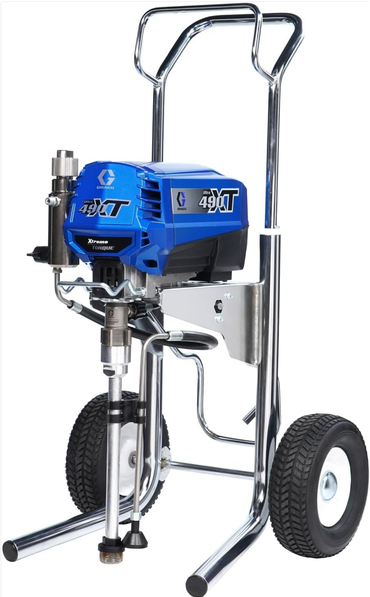
Figure 3: Side view of the Graco Ultra XT 490 Hi-Boy sprayer, highlighting the motor and pump assembly.