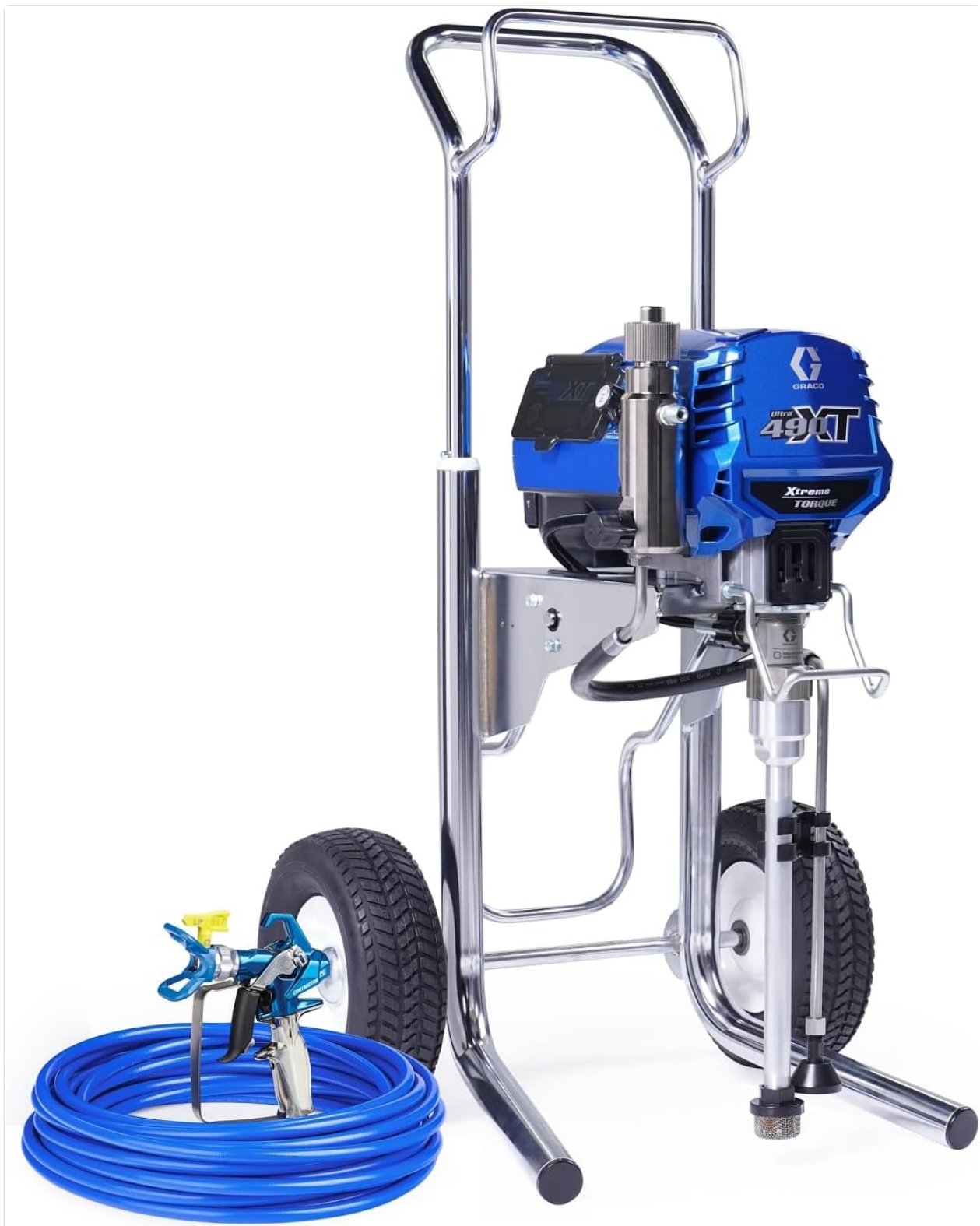
Figure 1: Graco Ultra XT 490 Hi-Boy Electric Airless Sprayer, showing the main unit, hose, and Contractor PC Gun.