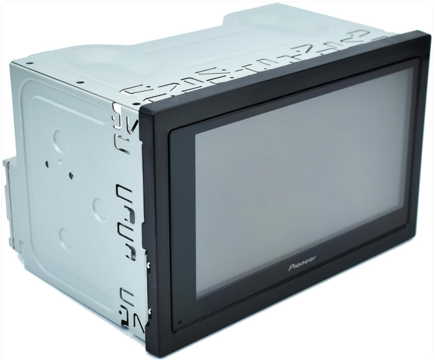
Figure 4: Shortened chassis design for flexible installation.