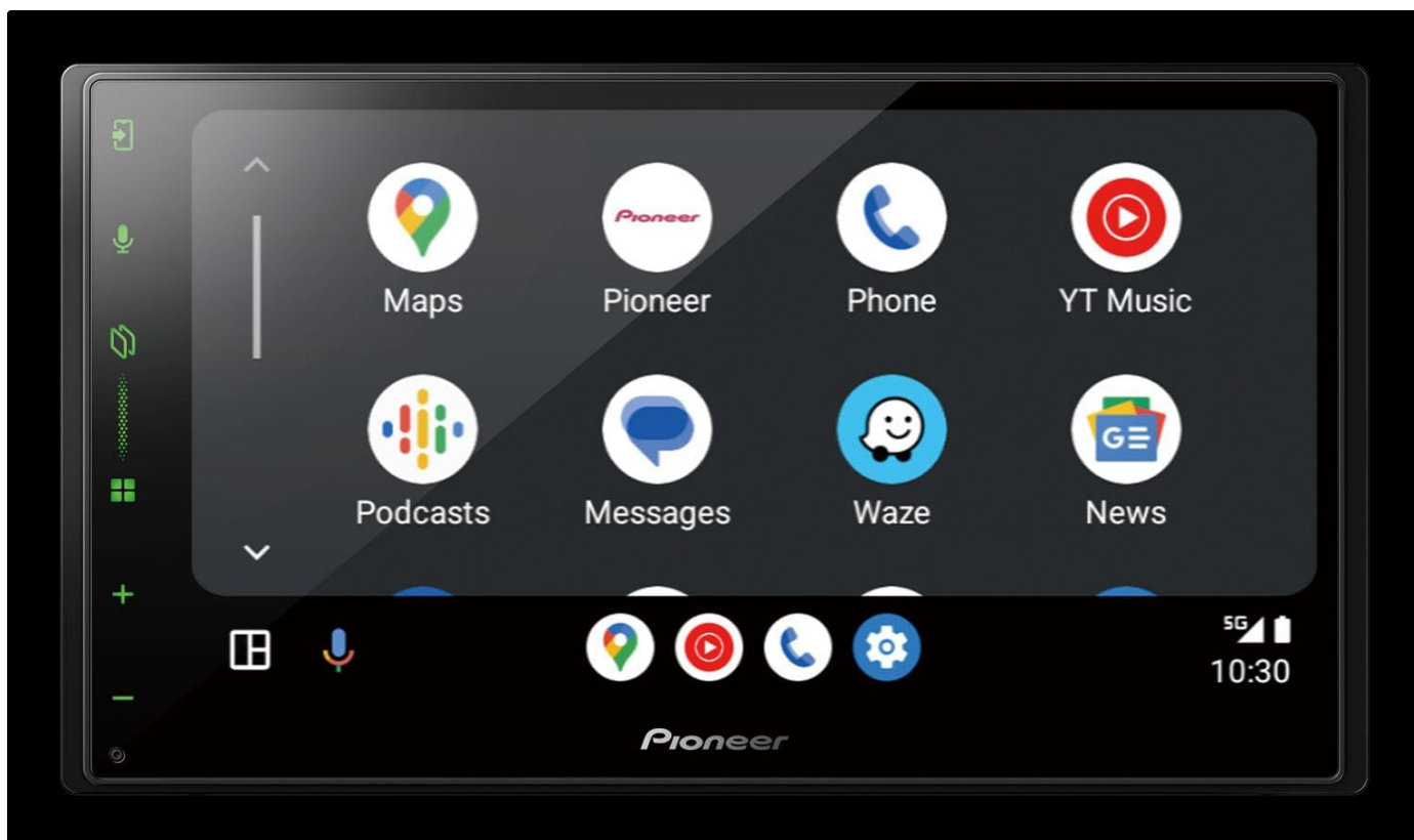
Figure 5: Android Auto interface on the SPH-DA77DAB.