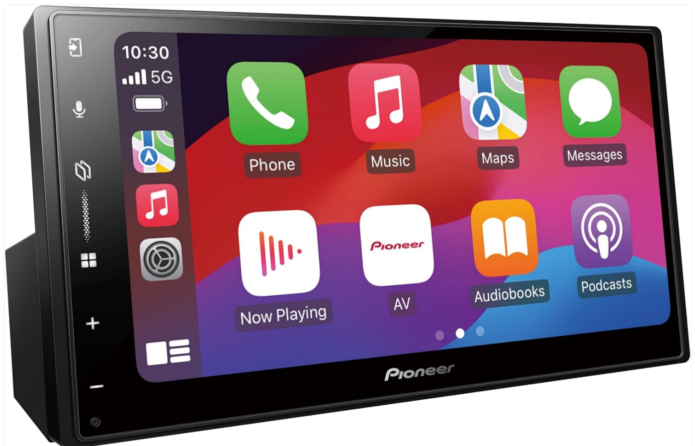
Figure 1: Front view of the Pioneer SPH-DA77DAB Media Centre displaying the Apple CarPlay interface.

Thank you for choosing the Pioneer SPH-DA77DAB 2DIN Media Centre. This unit is designed to enhance your in-car entertainment and connectivity experience with its capacitive 6.8-inch touchscreen, Wi-Fi, Bluetooth, Apple CarPlay, Android Auto, and DAB+ digital radio capabilities. This manual provides essential information for the proper installation, operation, and maintenance of your new media centre.