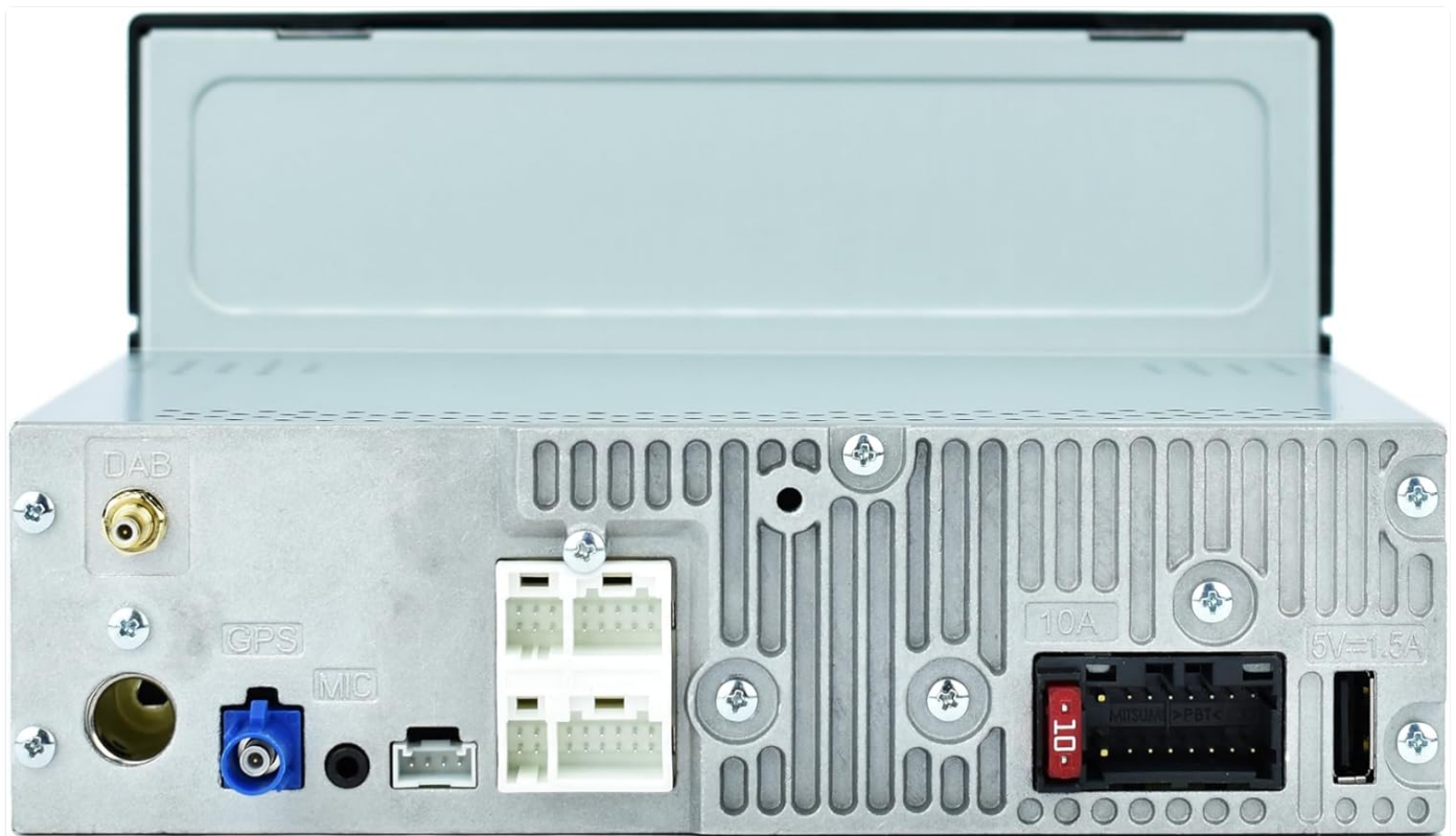
Figure 3: Rear connections of the SPH-DA77DAB unit.