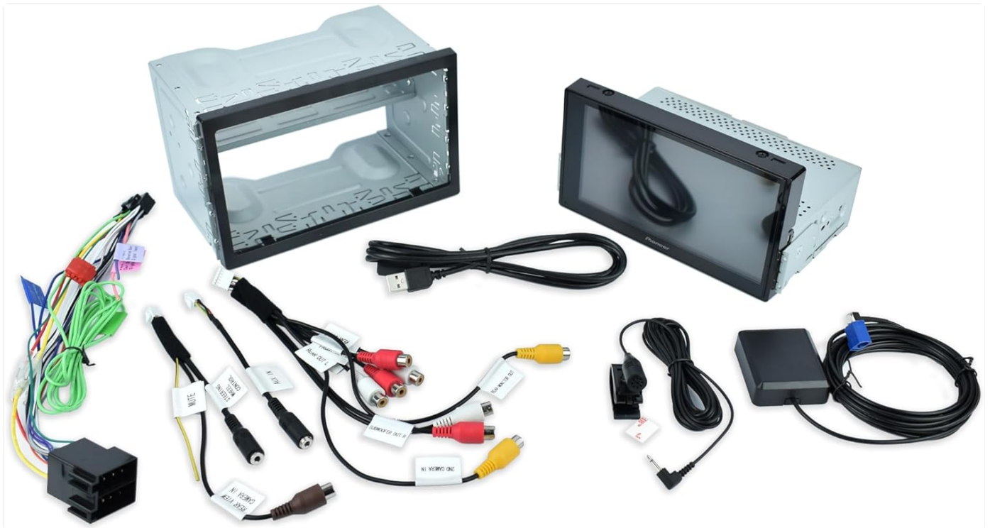
Figure 2: Overview of the Pioneer SPH-DA77DAB package contents.