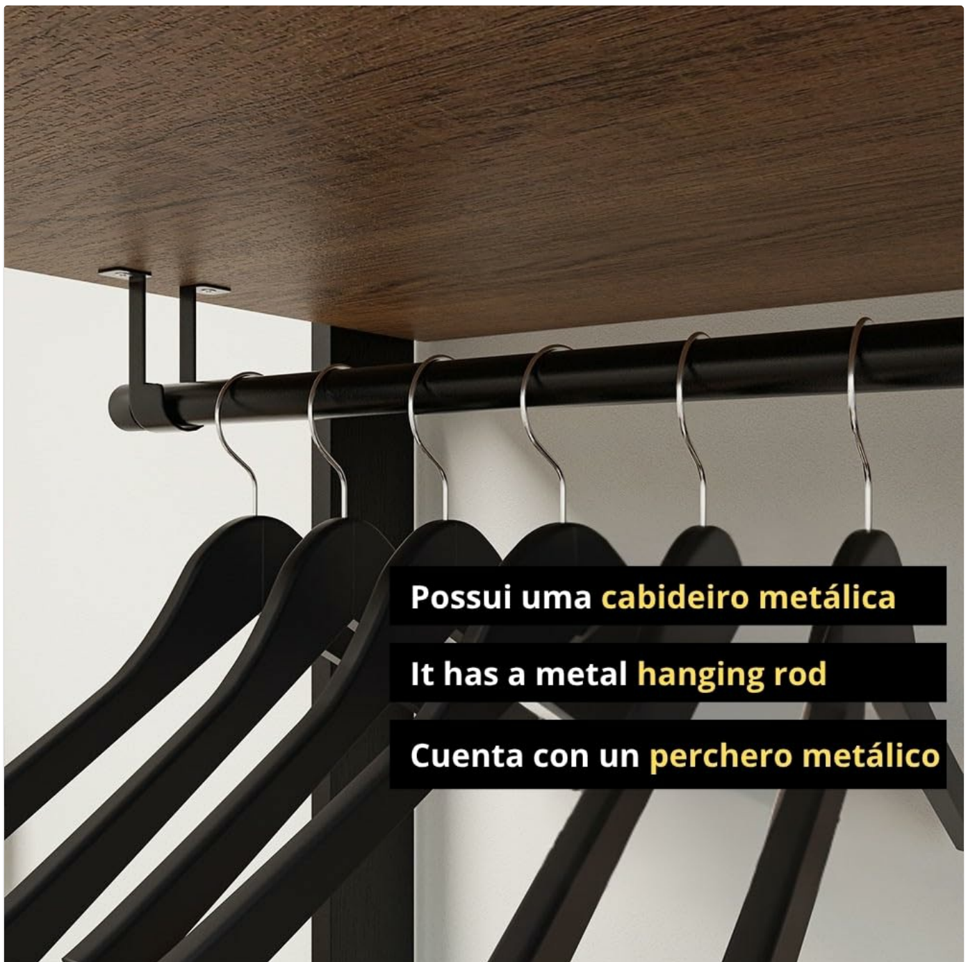
Image: Detail view of the sturdy metal hanging rod, designed to support various garments.