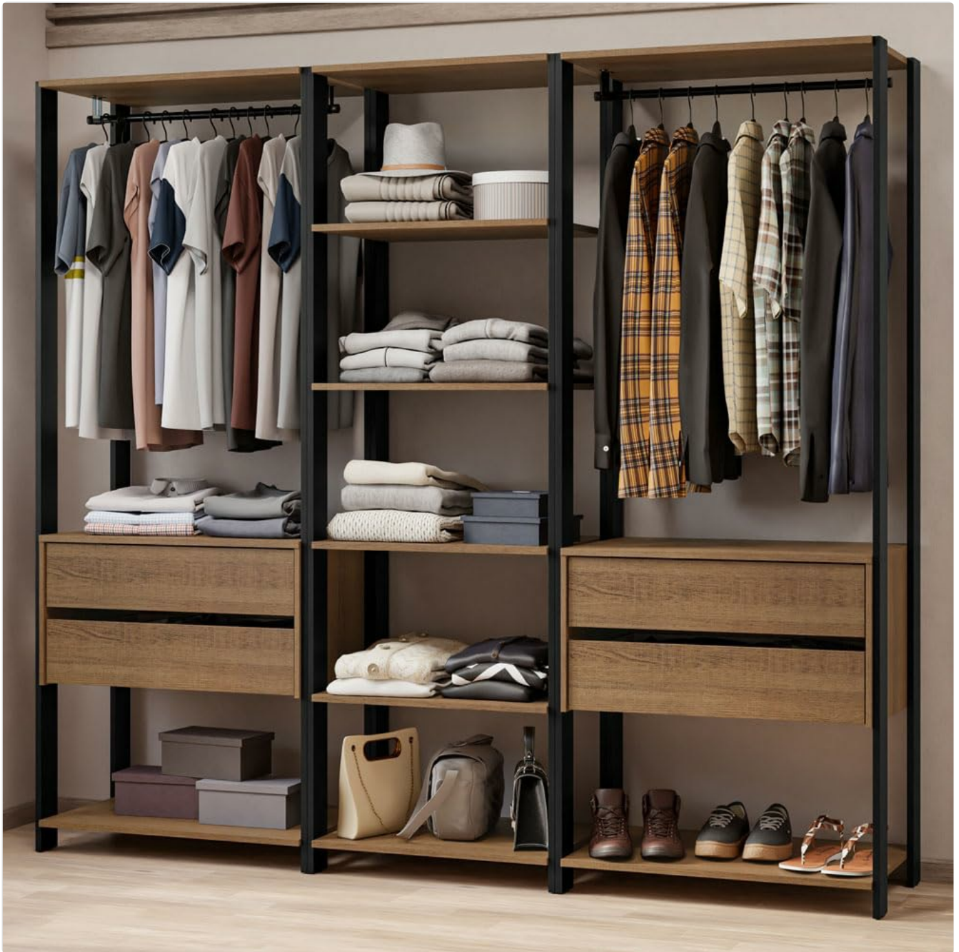
Image: The assembled wardrobe showcasing its ample storage capacity with clothes on hangers, folded items on shelves, and various accessories.