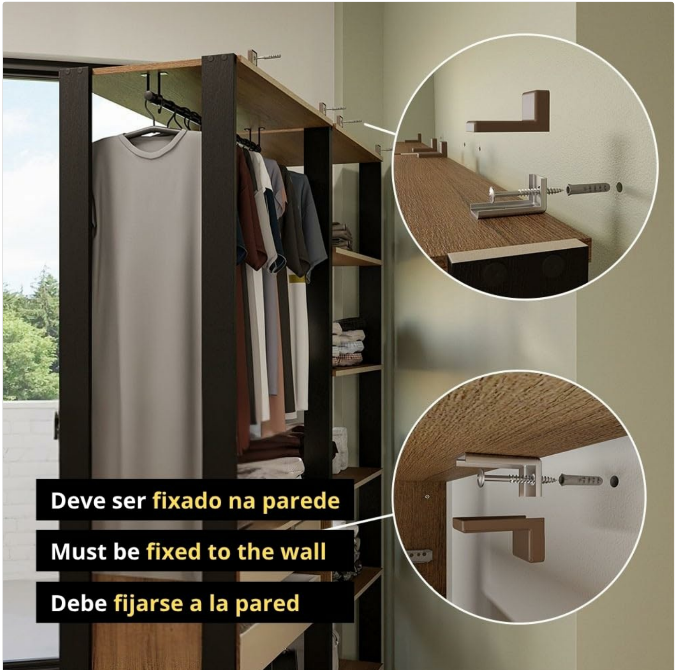
Image: Illustration demonstrating the recommended method for fixing the wardrobe to the wall using brackets and screws for increased stability and safety.