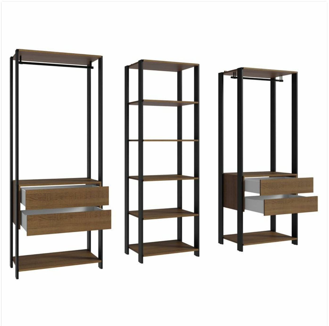
Image: The three independent pieces of the modular wardrobe, showing the hanging units with drawers and the central shelving unit.