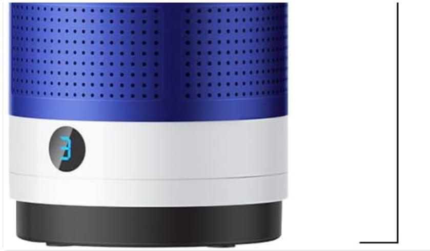
Figure 7: Product Dimensions