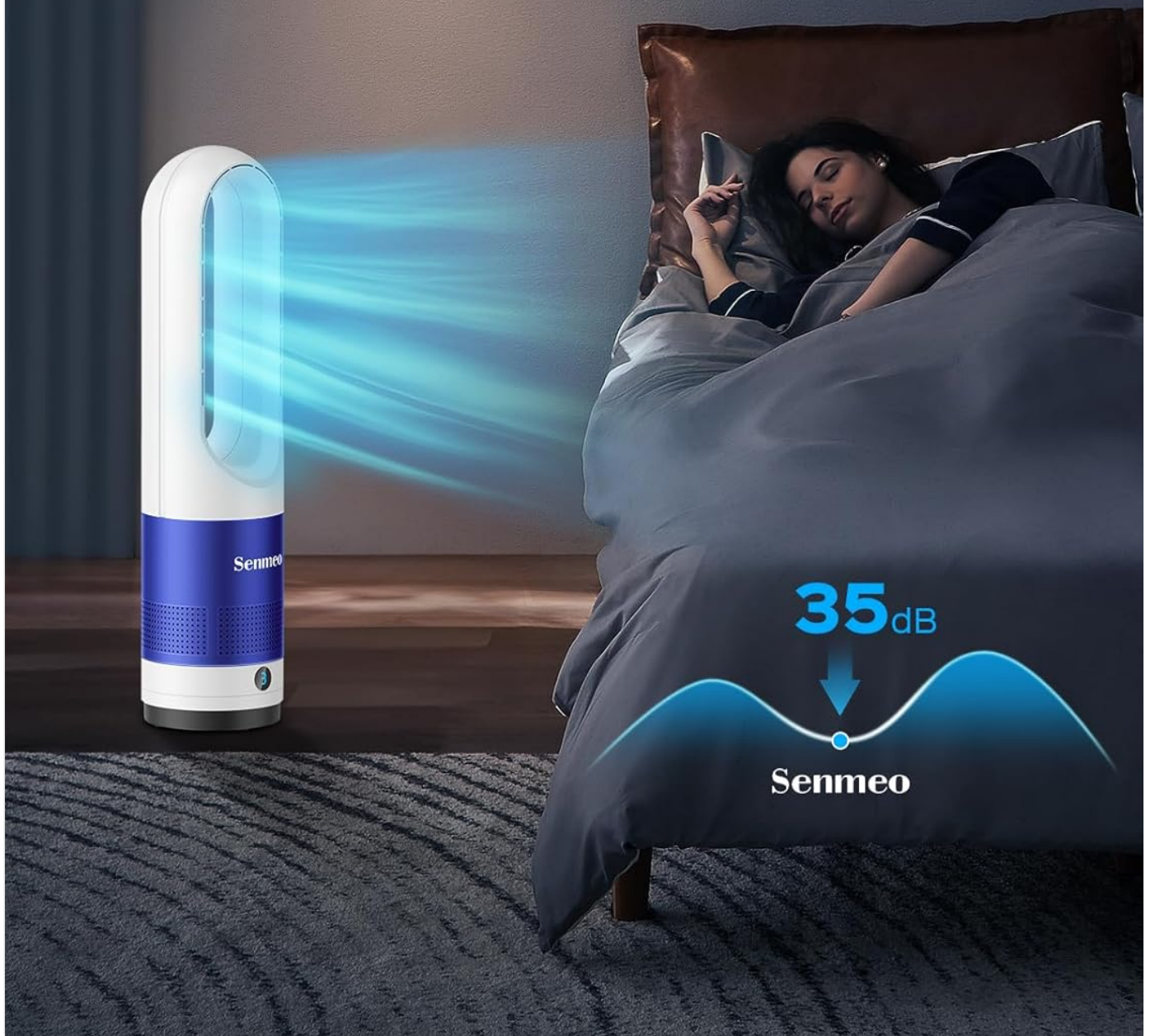
Figure 6: Quiet operation and LED auto-off for comfortable sleep.