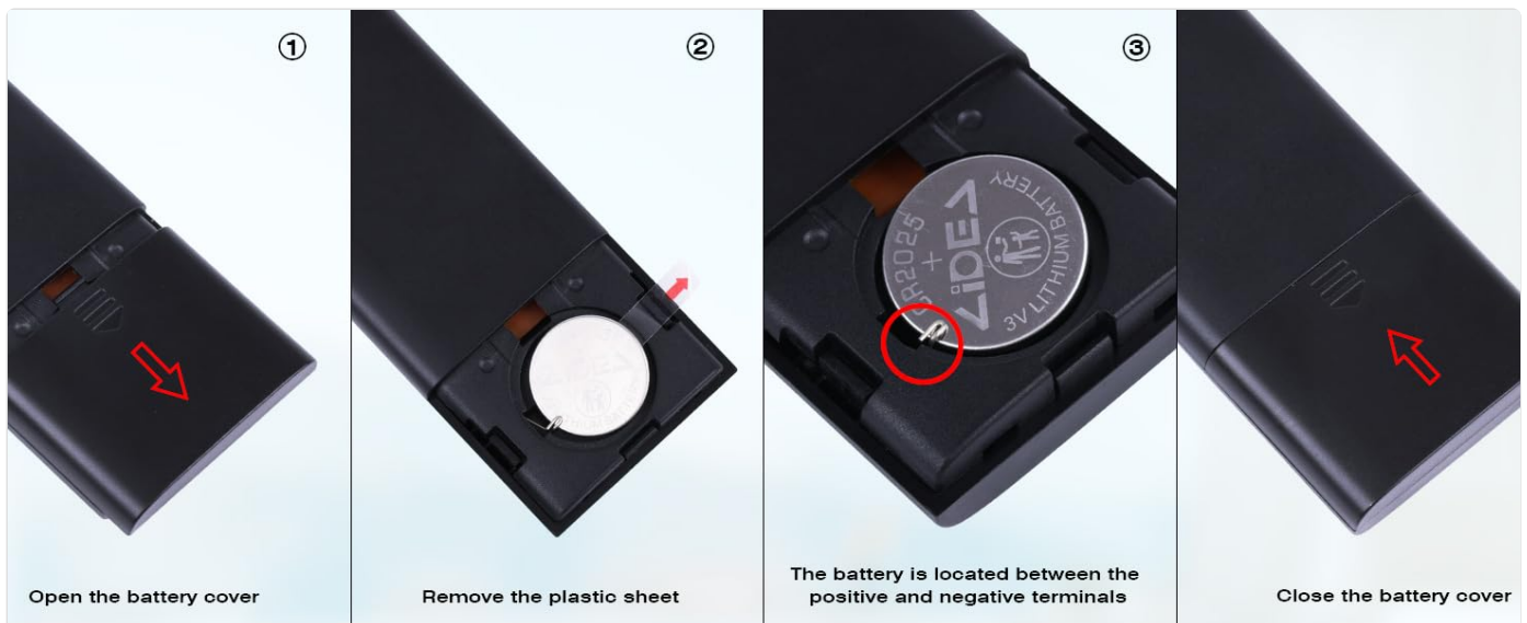
Figure 3: Remote Control Battery Installation Steps