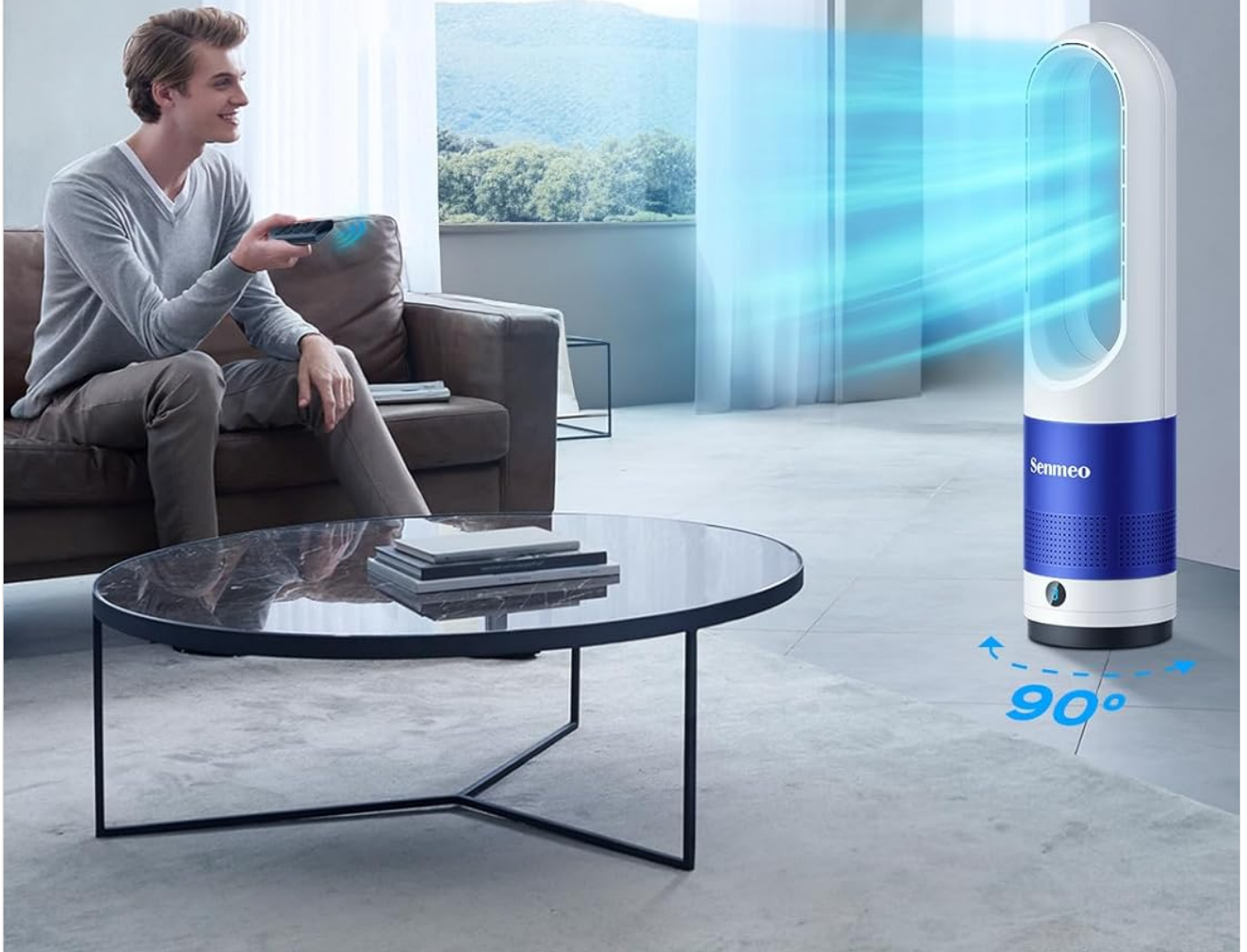
Figure 5: Wide-angle oscillation for extensive cooling.

Extensive cooling by 90° wide-angle Dual control by remote and display