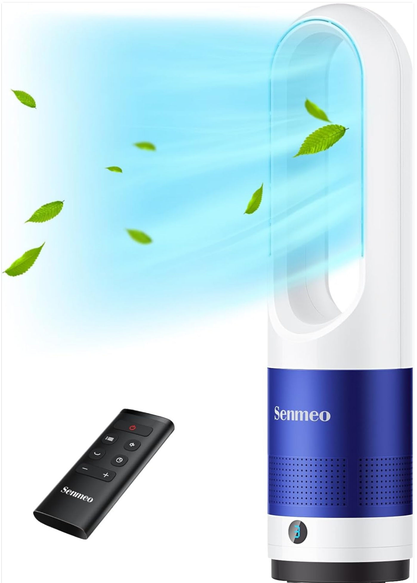
Figure 1: Senmeo Bladeless Tower Fan and Remote Control