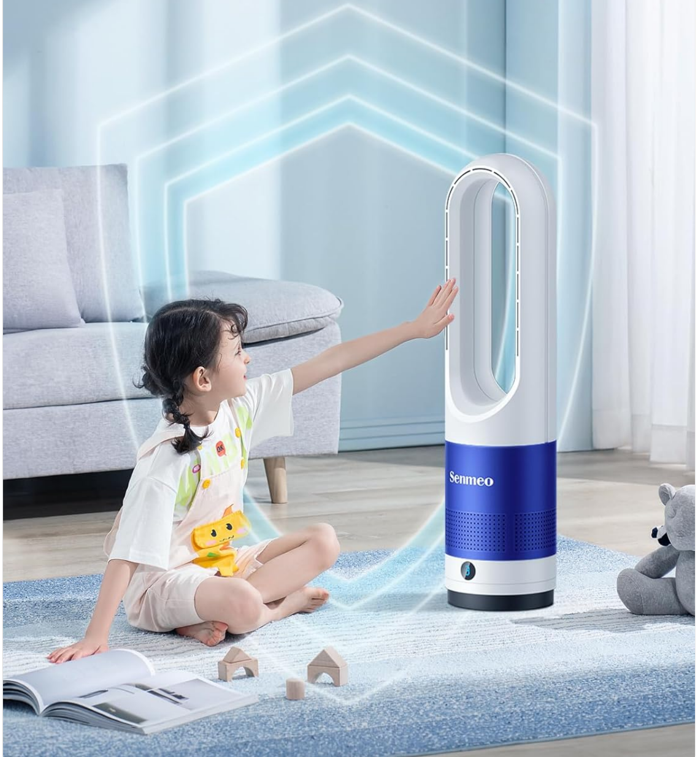
Figure 2: The bladeless design ensures safety, especially around children and pets.