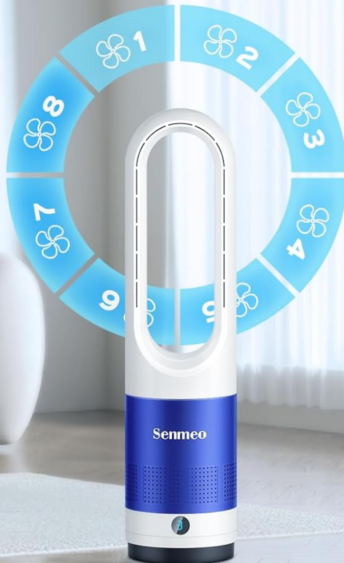
Figure 4: 8-Speed Customizable Airflow