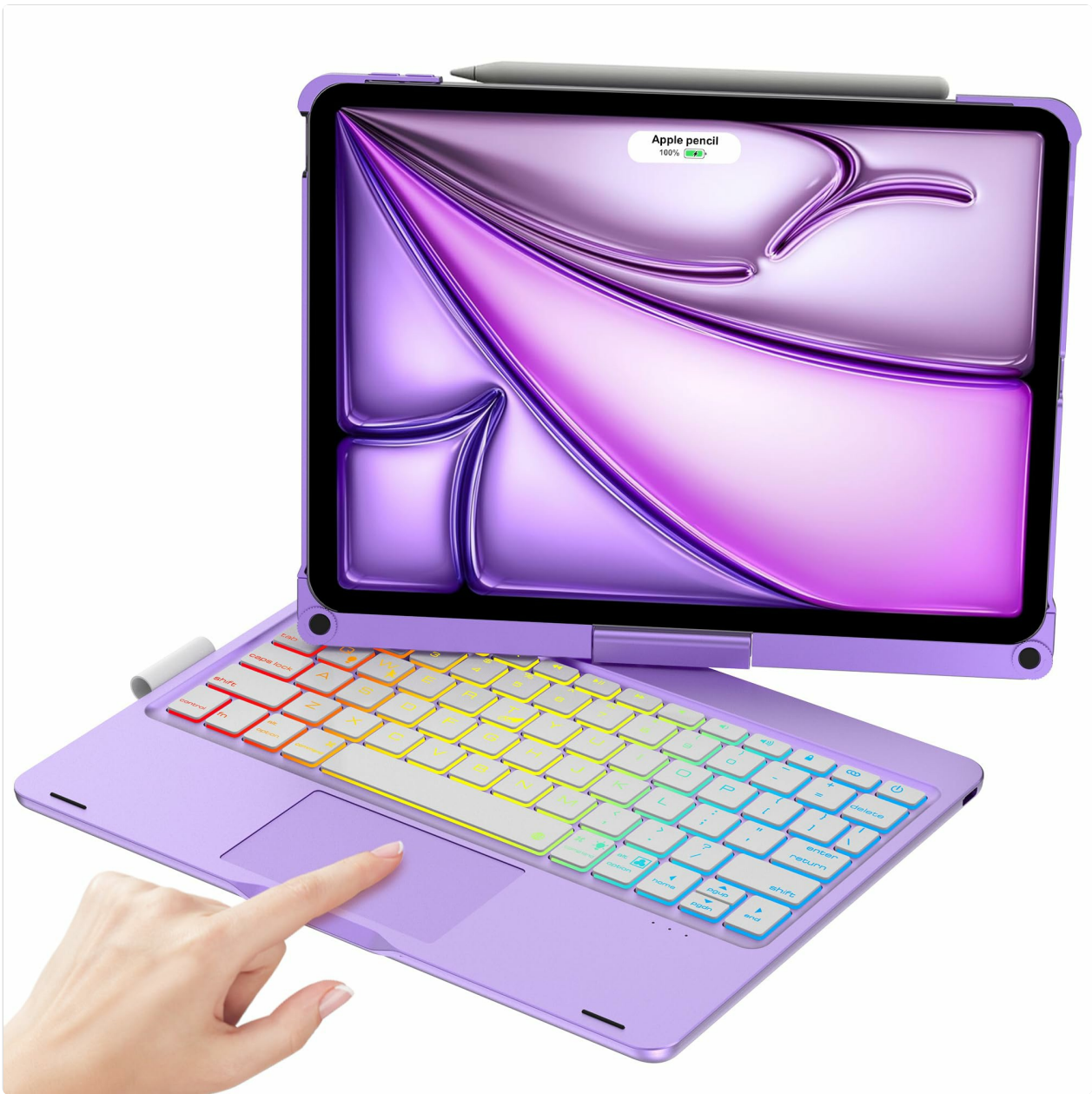
Image: The FOGARI Touch Keyboard Case shown in different configurations and uses, highlighting its adaptability for various tasks.