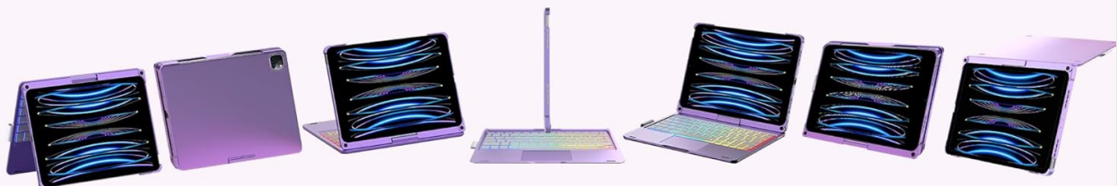
Image: The keyboard with its keys illuminated by a rainbow backlight, demonstrating the customizable lighting feature.