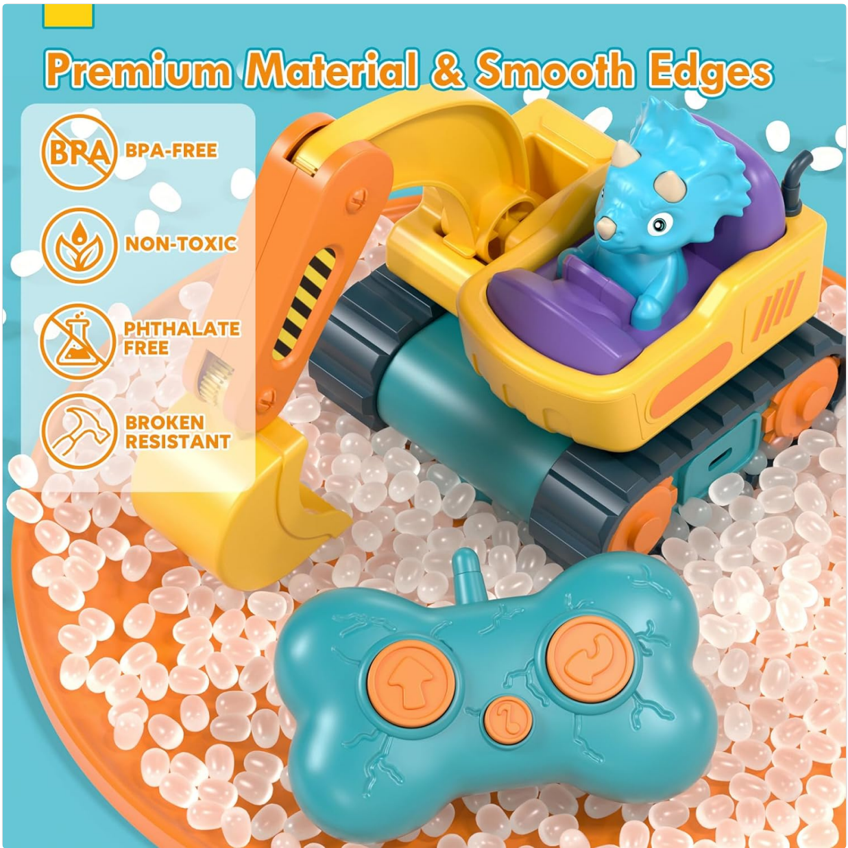
Image: Highlights the premium, safe, and durable materials used in the toy's construction.