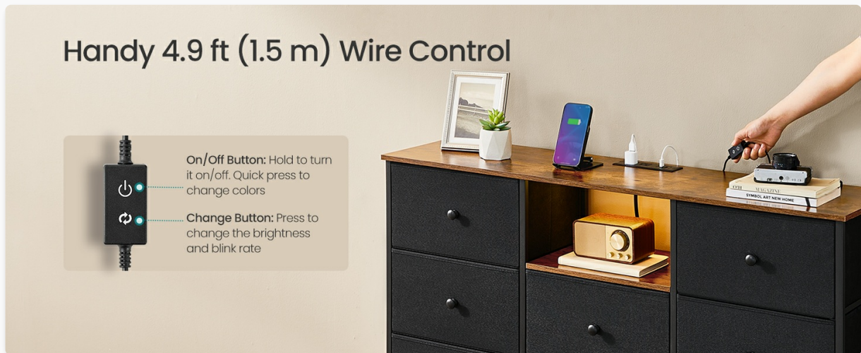
Figure 5.3: The handy 4.9 ft (1.5 m) wired control, showing the on/off button and the change button for colors, brightness, and blink rate.