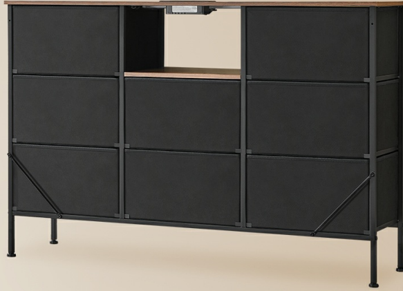
Figure 4.2: The dresser frame partially assembled, highlighting the ease of construction with minimal pieces.

With only 4 pieces and easy-to-follow instructions.