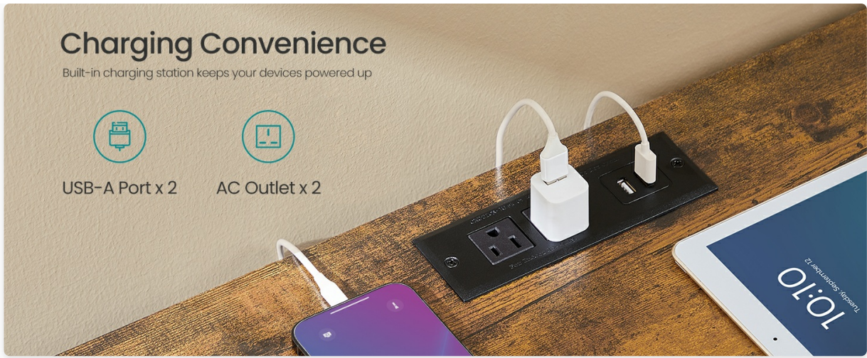
Figure 5.4: Detailed view of the charging station, showing the two USB-A ports and two AC outlets, with devices connected.