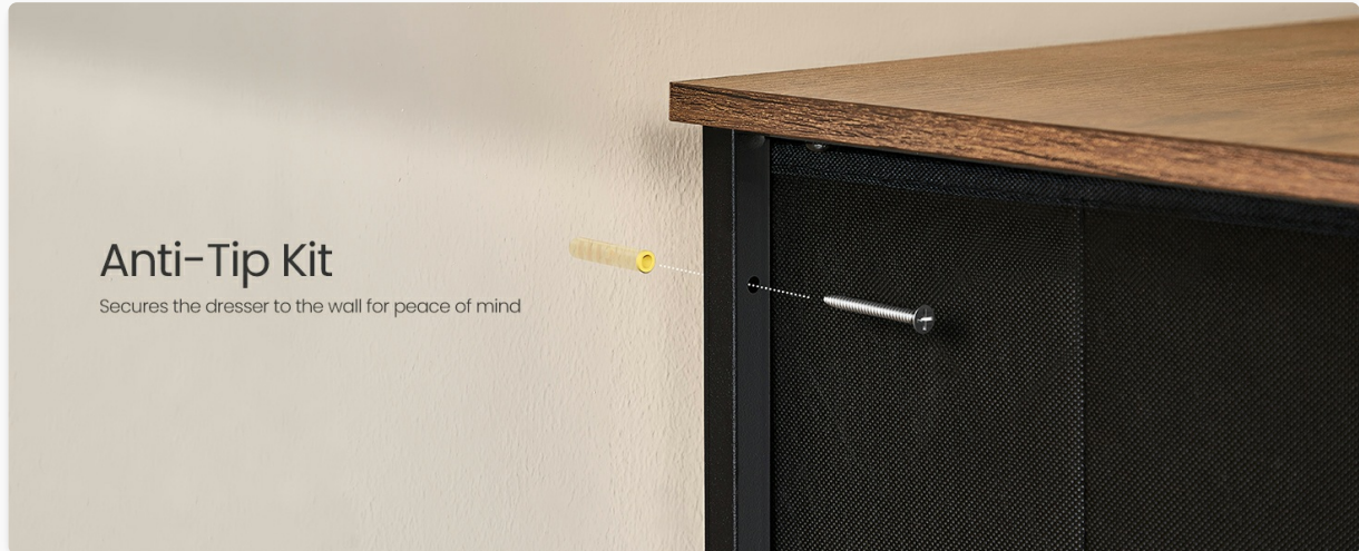
Figure 2.1: Diagram illustrating the installation of the anti-tip kit to secure the dresser to the wall.