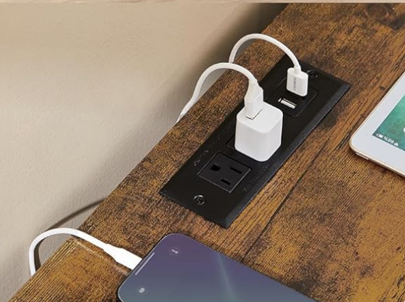
Figure 5.1: The dresser's LED lights in operation, showing the remote control for various settings and the charging station in use.