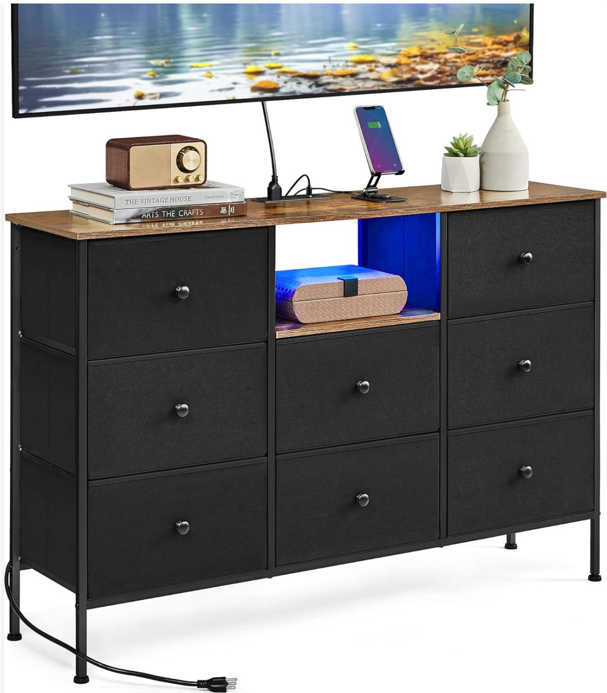
Figure 1.1: The SONGMICS Fabric Dresser in a room setting, showcasing its functionality as a TV stand with integrated charging and LED lighting.