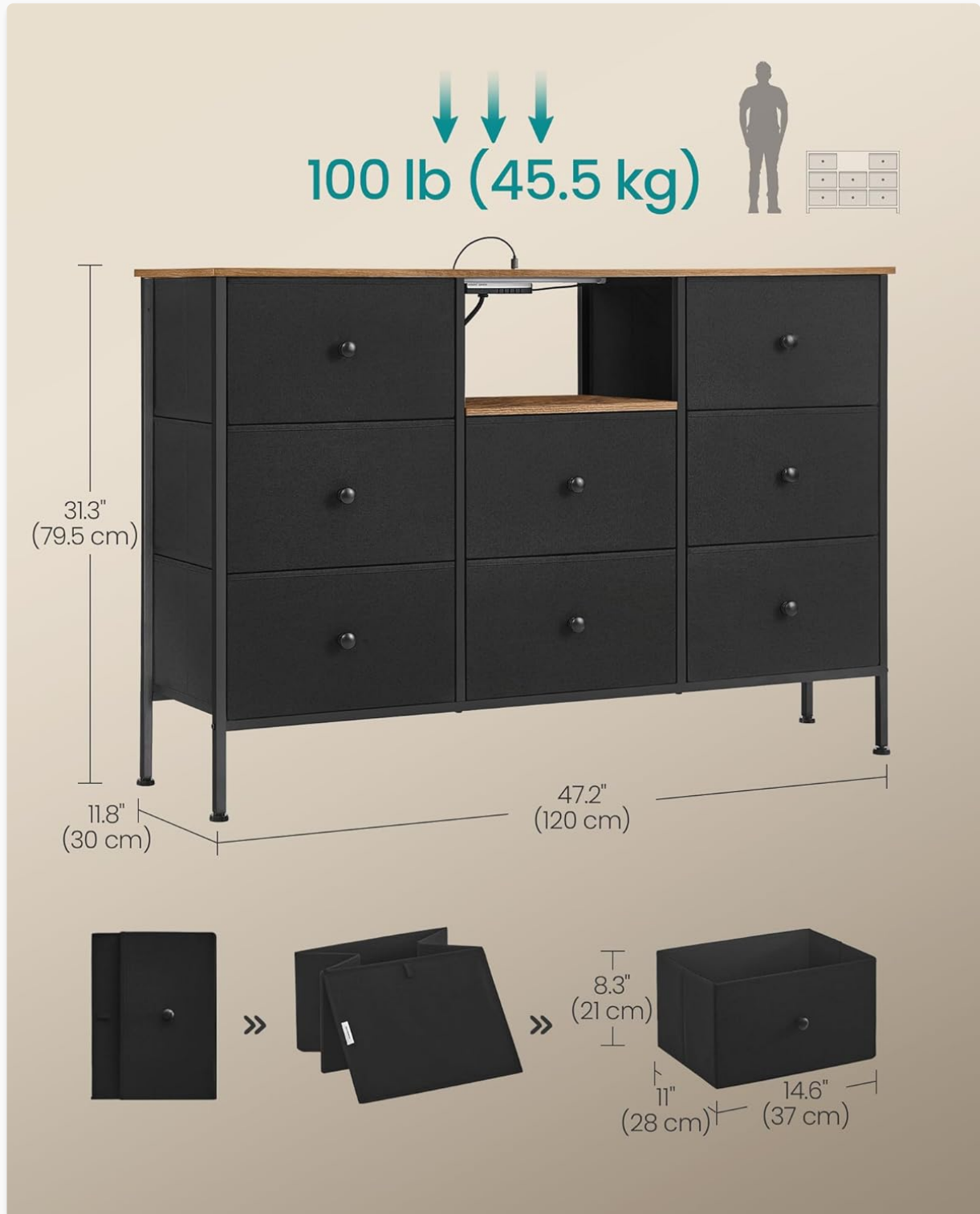
Figure 4.1: Visual guide showing the overall dimensions of the dresser and the simple steps for assembling the fabric drawers.