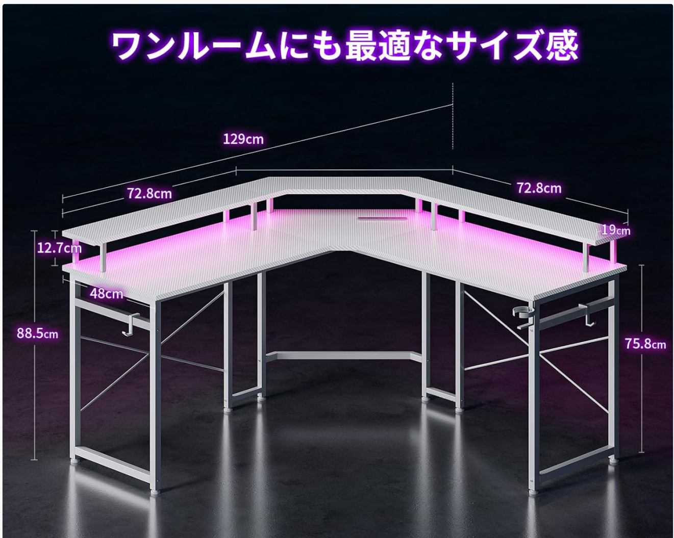
Figure 6: Detailed dimensions of the ODK L-Shaped Gaming Desk.