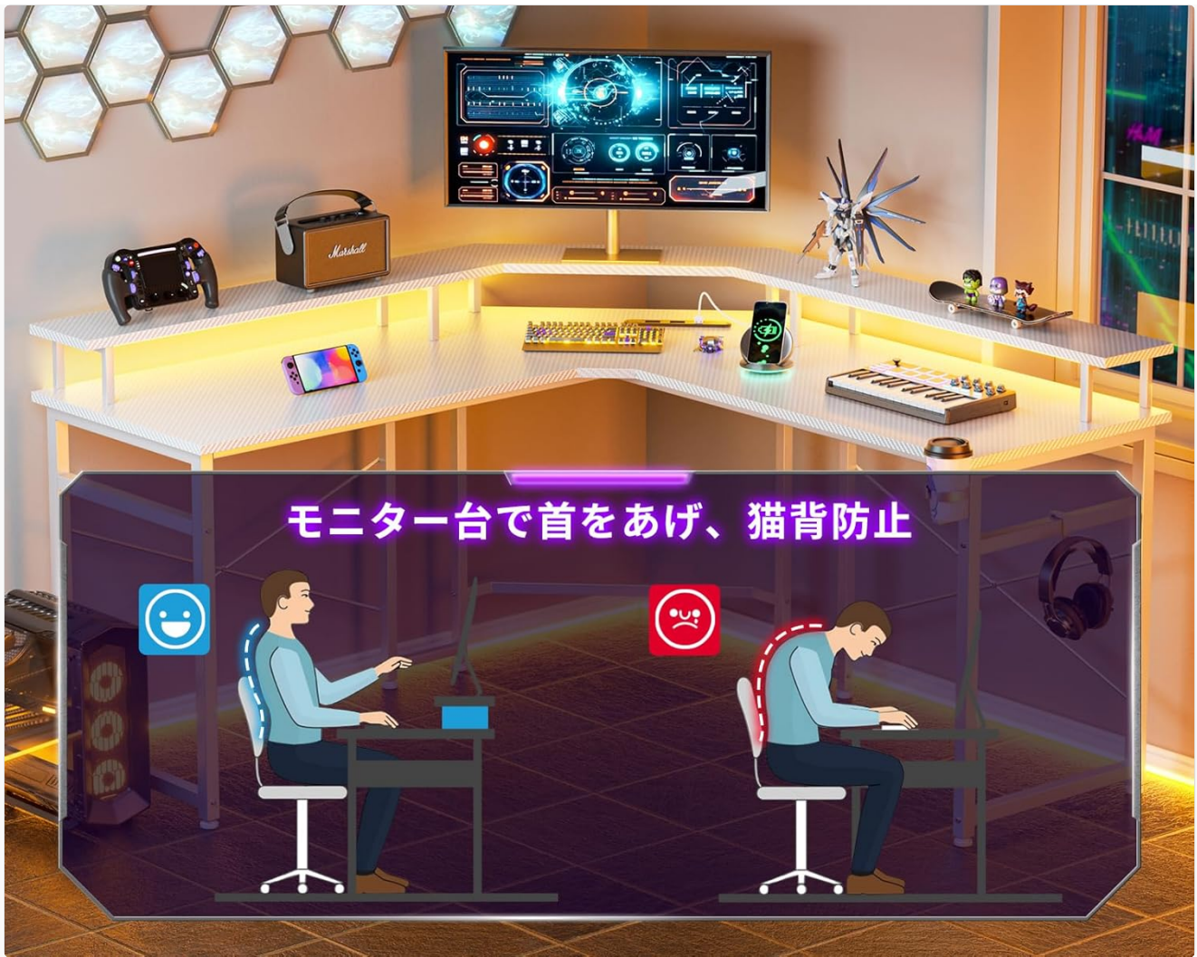
Figure 4: The monitor stand helps improve posture by elevating your screen to eye level.

The integrated monitor stand elevates your screen to an ergonomic height, helping to improve your posture and reduce strain on your neck and shoulders during extended use.