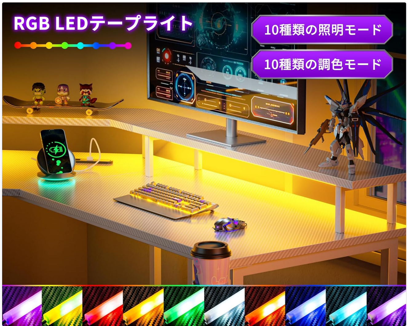
Figure 3: RGB LED lighting with various color options to enhance your environment.

The integrated RGB LED lighting allows you to customize your desk's ambiance. Use the included controller to: