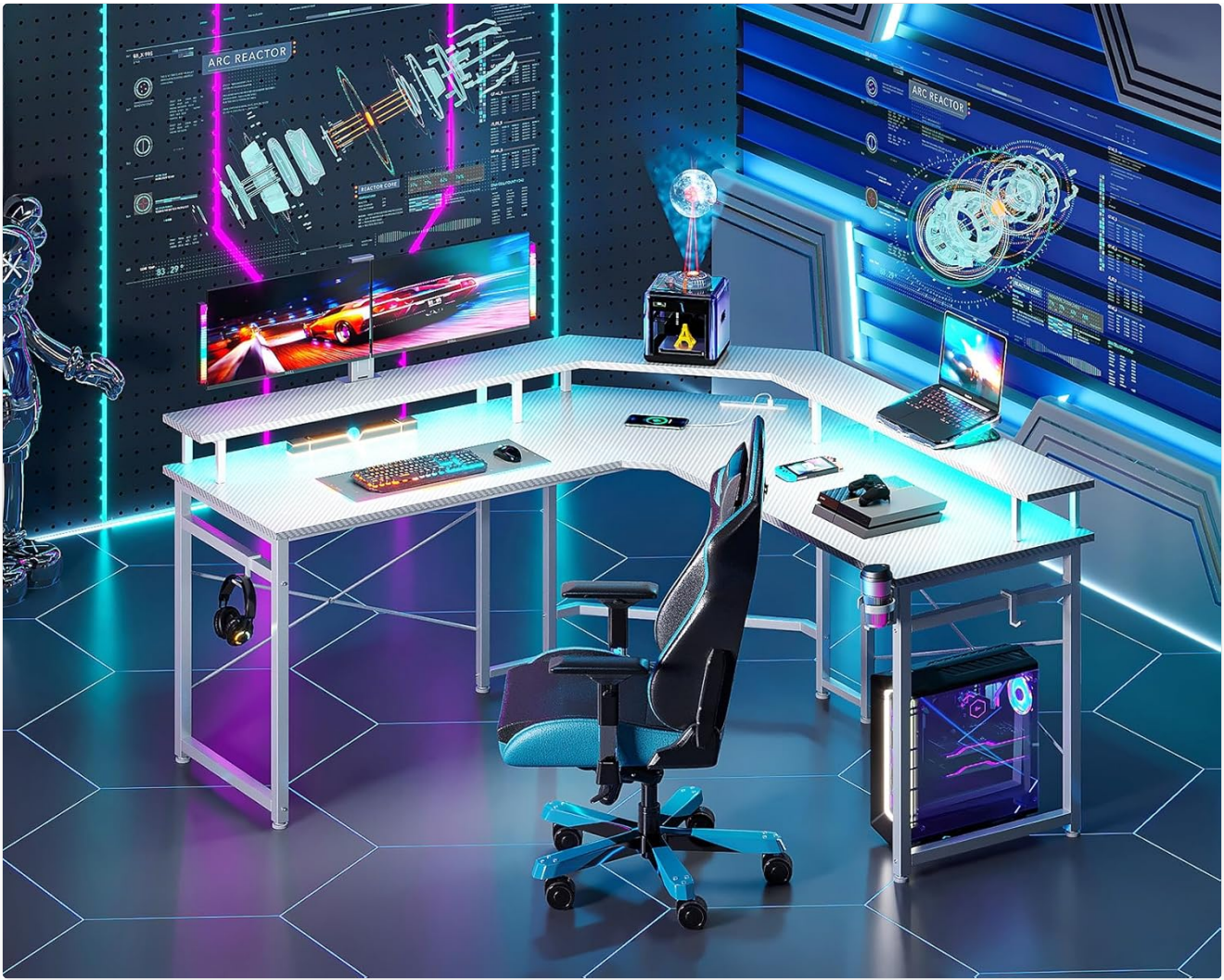
Figure 1: ODK L-Shaped Gaming Desk in a typical setup, showcasing its spacious design and integrated features.

Your browser does not support the video tag.