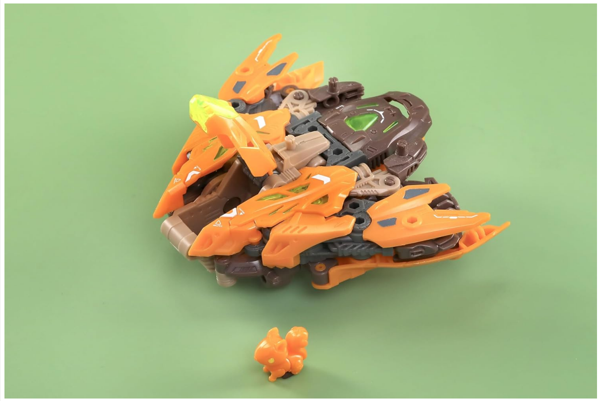
Figure 4.4: The BD-08 Sky Tail in Drive Mode.

Refer to the included instruction manual for specific steps and joint manipulations required for each transformation.