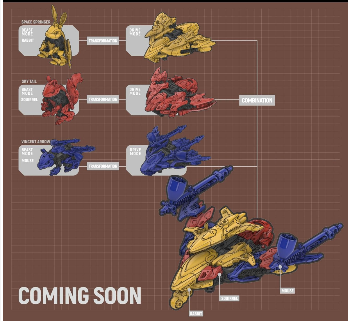
Figure 5.3: Concept of combining different BEASTDRIVE armor for custom builds.

Combine different armor to build your BEAST DRIVE!