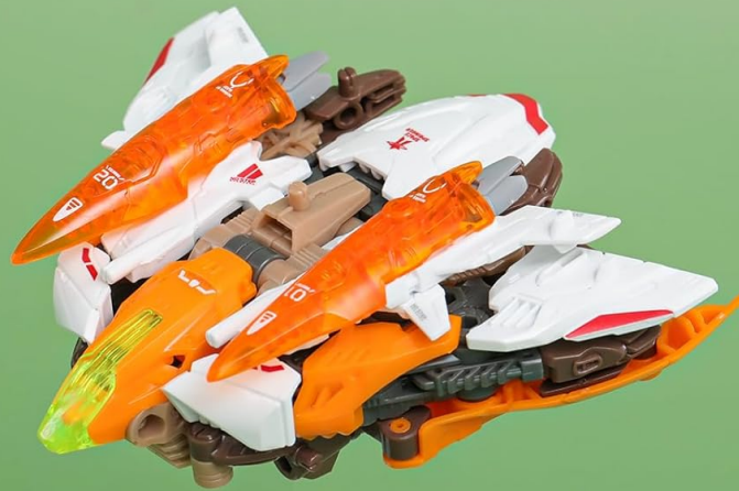
Figure 5.1: Example of armor change in Drive Mode.