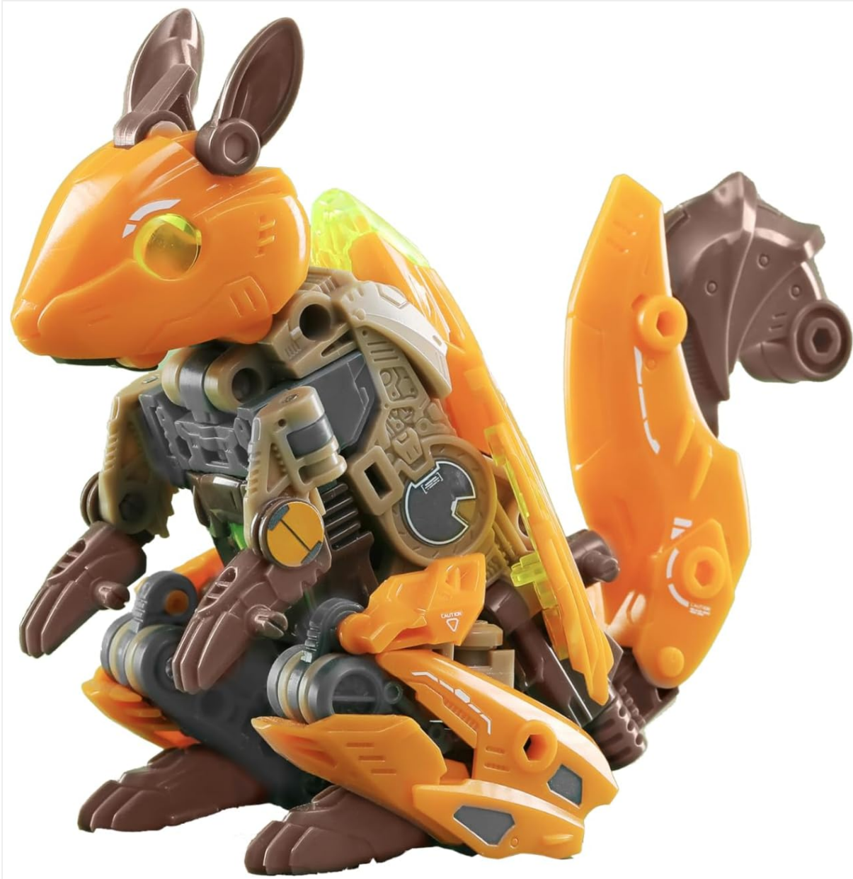
Figure 4.3: The BD-08 Sky Tail in Beast Mode.