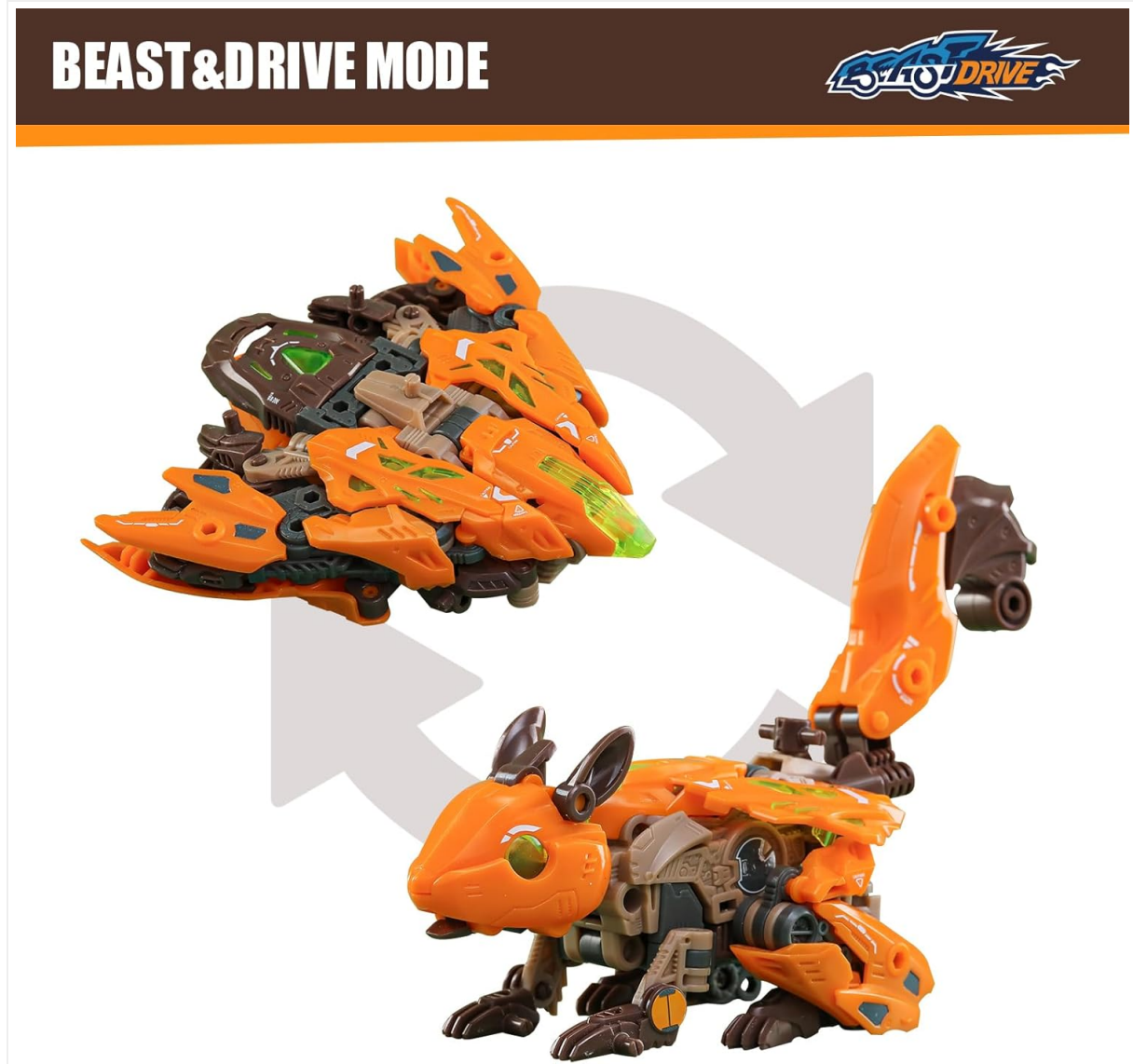
Figure 4.1: Visual representation of the transformation process between Beast and Drive Modes.

The BD-08 Sky Tail can transform between two distinct modes: Beast Mode (Squallole) and Drive Mode (Stealth Fighter Plane) . The transformation mechanism is designed to be intuitive, utilizing fully adjustable joints.