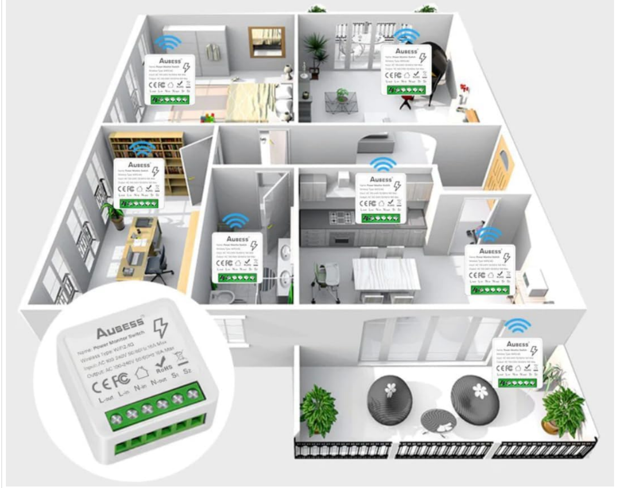
Figure 4: The energy monitoring feature provides detailed insights into power consumption directly through the app.

Com 16A, o interruptor é compatível com a maioria dos eletrodomésticos e sistemas de iluminação, oferecendo grande versatilidade.