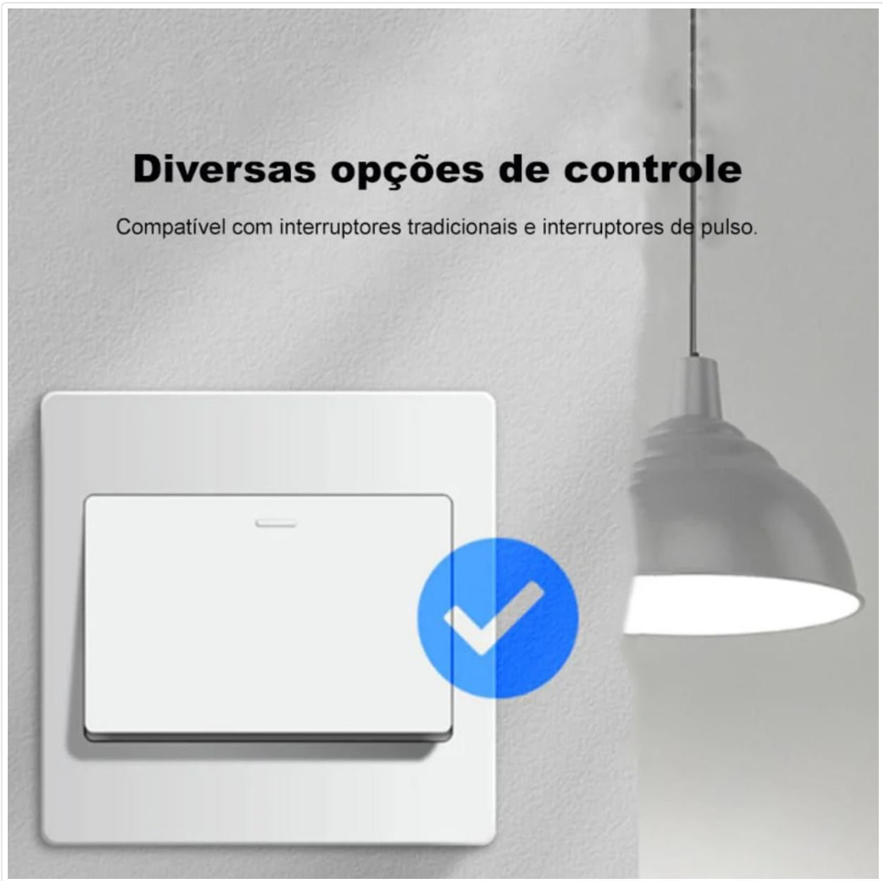
Figure 2: The Aubess Mini Smart Switch is compatible with traditional wall switches, offering flexible control options.

Compatível com interruptores tradicionais e interruptores de pulso.